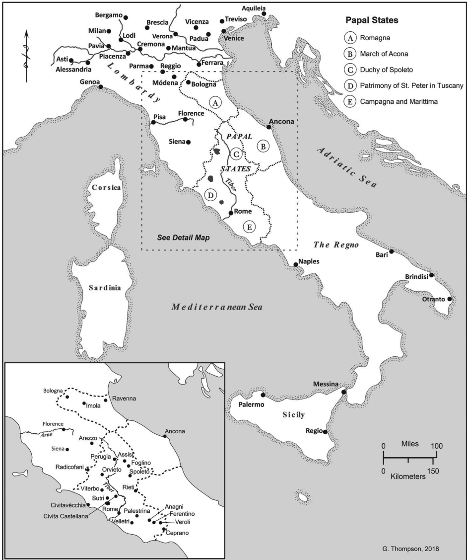
Map 1. Italy in the thirteenth century.