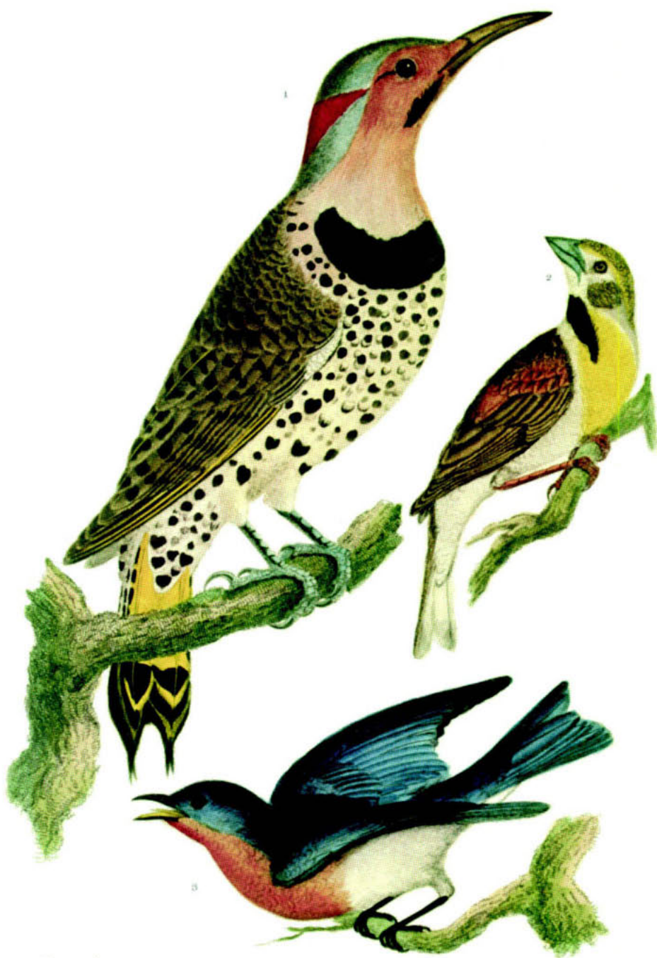
1. Picus Auratus . Gold winged Woodpecker. 2. Emberiza Americana . Black throated Bunting. 3. Sialia Sialis . Blue Bird.