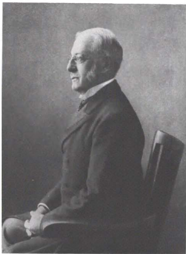
Charles W. Eliot