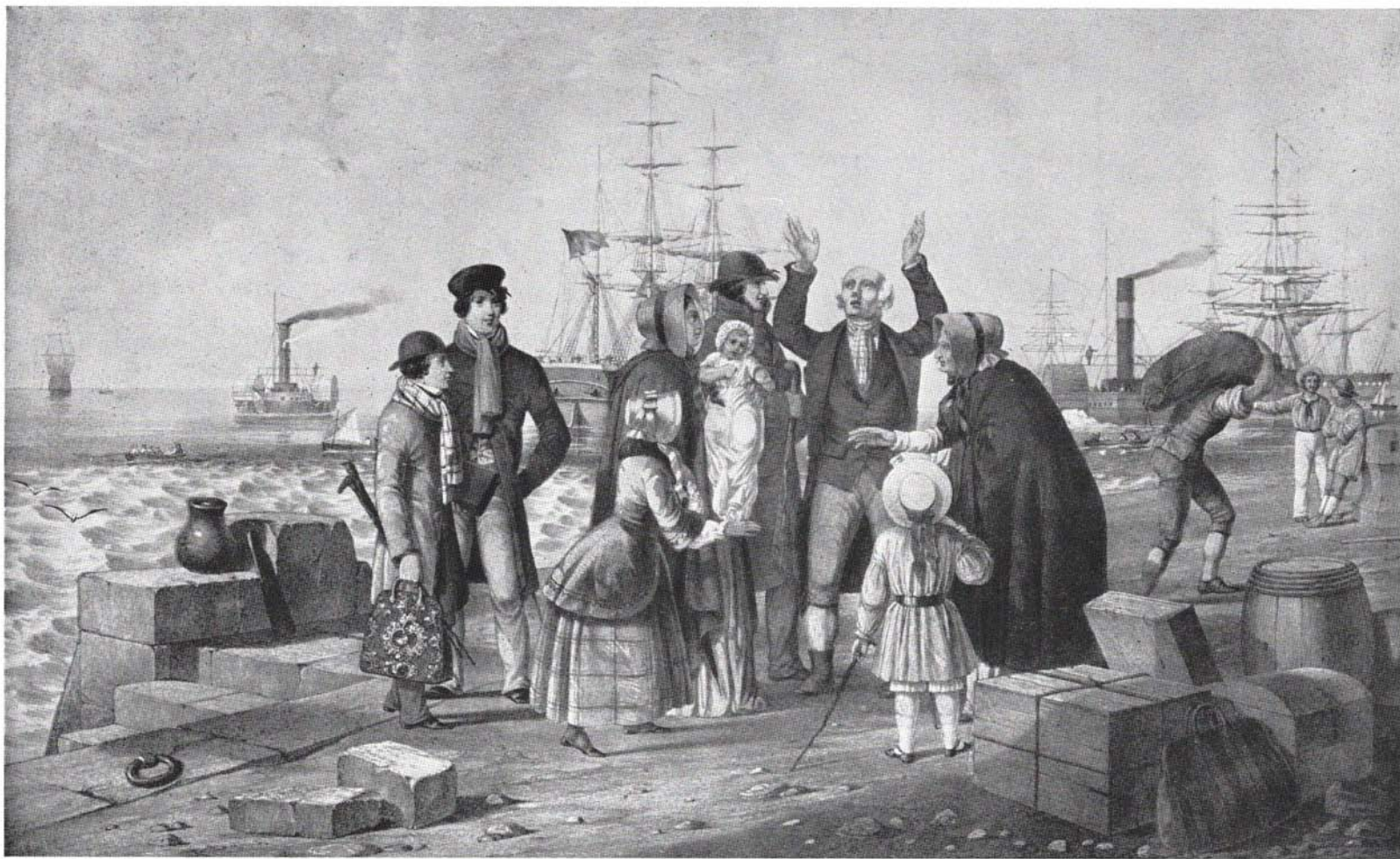
THE EMIGRANTS' RETURN: THE LORD BE PRAISED!