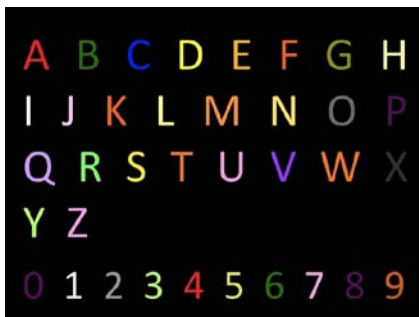
Figure 1. Alphanumeric symbols as coloured by a grapheme-colour synaesthete.

A different approach was used by Meier and Rothen (2007). They developed a startled response paradigm, where participants were conditioned to a specific colour. However, while non-synaesthetes demonstrated a startle response only for the conditioned colour, synaesthetes also developed the same startle response to the graphemes, inducing the conditioned colour. This was taken as evidence that the