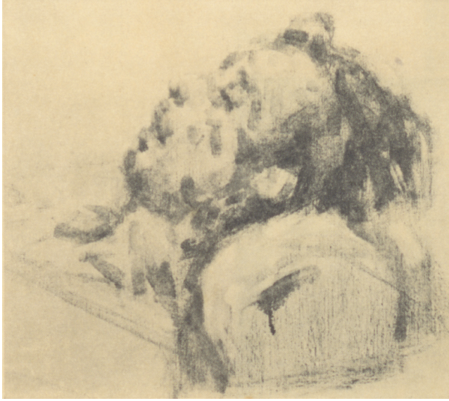
FIGURE 21. Oana Ryūichi's sketch of Akutagawa's "death face" ( shinigao ). Cover image for Oana Ryūichi (1956), Futatsu no e: Akutagawa Ryūnosuke no kaisō , Tokyo: Chūō Kōronsha.

Instead, I would suggest that what it offers is akin to a death mask: an impression taken in the immediate aftermath of death. It, too, purports to capture the face of the dead. Like this sketch drawn by Oana that serves as the cover image of his memoir (fig. 21), it offers a proxy for the deceased. It may seem to reveal to those left behind a privileged glimpse of their dead in this final moment, but it is an approximation, and a highly mediated one at that. Perhaps it was the delayed recognition of this that caused Oana to retitle the subheading of his memoir Futatsu no e ('Two drawings'). Initially published in December 1932 with the subtitle "The true face [ shinsō , 真相] of Akutagawa Ryūnosuke's suicide," the 1956 republication more modestly claimed to be a "Reminiscence" ( kaisō , 回想). Writings left behind are as malleable as our memories. Akutagawa's "face" comes in the forms of texts and images that are as sculpted as the plastic medium of the death mask.