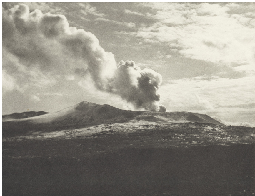
FIGURE 5. Billowing eternal smoke of Mount Mihara, 1930. Friedrich M. Trautz, Japan: The Landscape, Architecture, Life of the People (New York: Westermann, 1930).

crucial to the poetics associated with volcanos in particular. The volcano and its smoke offered a simultaneous promise of ephemerality and immortality.