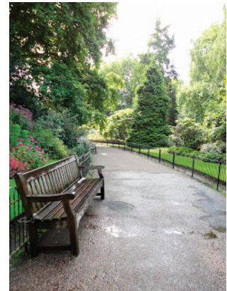
(Left) View from Arc de Triomphe, Paris, France (Right) Kensington Gardens, London, UK