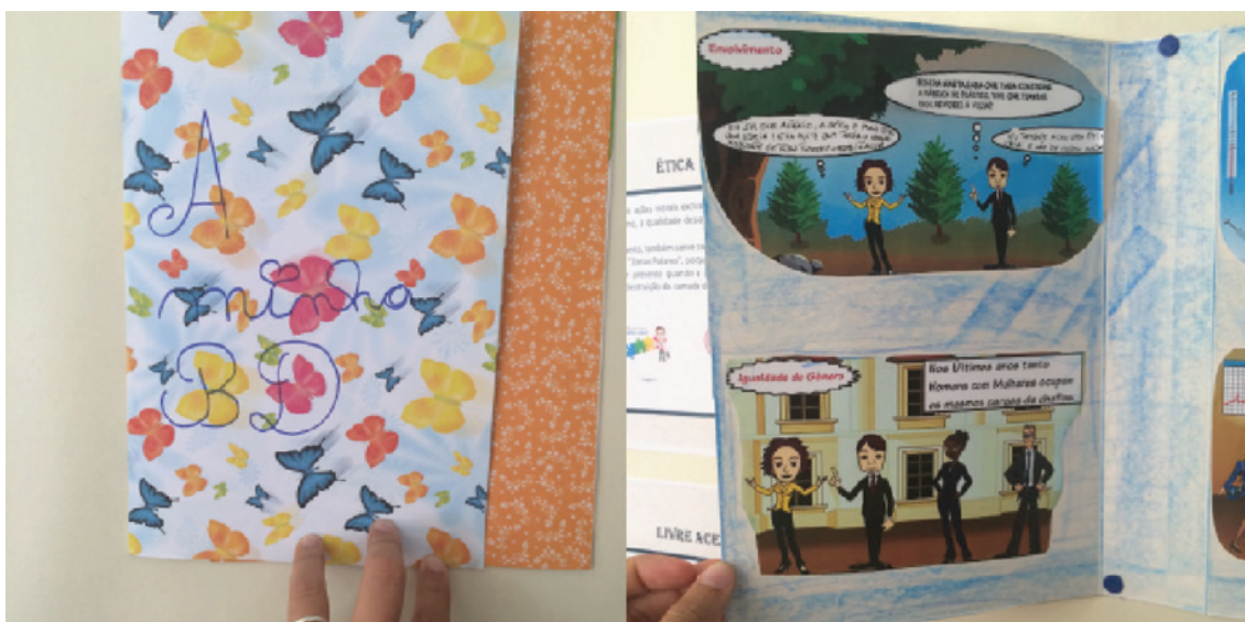
Fig. 5: Cartoons made to illustrate RRI – issues.