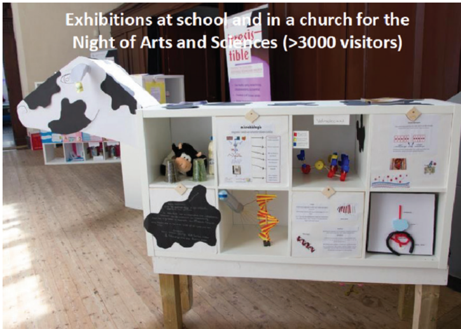
Fig. 4: Use of an Ikea cupboard as base for an exhibit.

In other cases cartoons were used (Fig. 5). In Fig. 6 an overview of the exhibition in Greece shown.