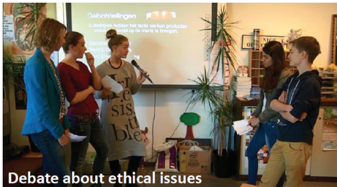
Fig. 3: Students debating about propositions.