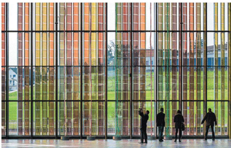
Fig. 1: Example of perovskite solar cells used in windows ( http://news.sciencemag.org/node/112358 ).

The implementation of RRI in the modules has been done in different ways. In the modules of Israel, Turkey and Germany the students are given a specific role. Incorporated in the role-play are the different RRI aspects. In the Turkish module, the students are given the roles of member (doctor, nurse, patient, cook, cleaning staff, technician etc.) of a committee. A hospital is asking them whether or not the hospital should introduce towels etc treated with nano silver particles. They then investigate the properties of cotton treated with silver nanoparticles and finally by discussing the consequences of washing textile containing silver nanoparticles, they highlight the key aspects of RRI and come up with an advice.