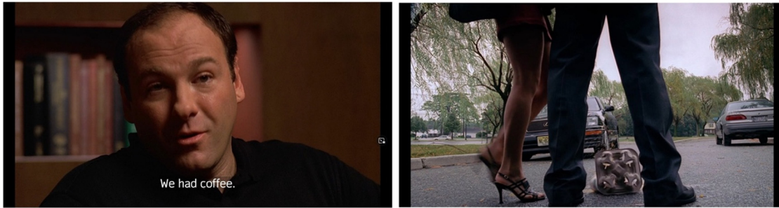
Figure 5: Splitting narration and monstration in The Sopranos (S1, Ep 1 “The Sopranos”).