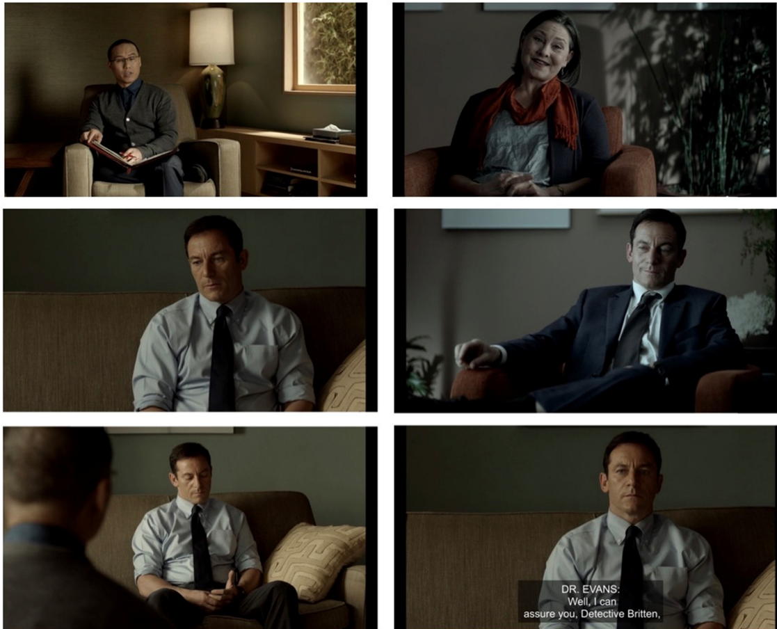
Figure 3: Escher twisting across two worlds in Awake , S1Ep1 “Pilot.”