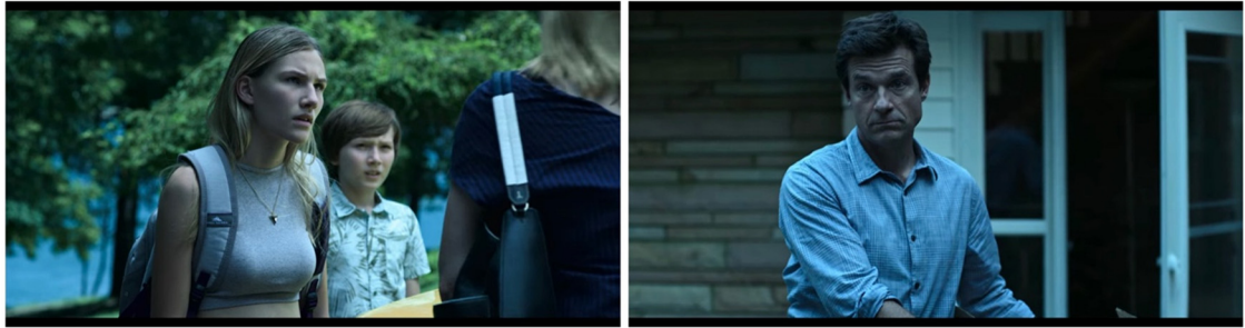
Figure 6: Disclosing the real reason for the move to the Ozarks, and the real reason for this disclosure. Ozark S1, eps. 2 (“Blue Cat”) and 3 (“My Dripping Sleep”).

and Jonah giving their mother an incredible look, leaving it in the middle as to whether their disbelief concerns the revealed fact or the fact of the revelation itself (Figure 6, left).