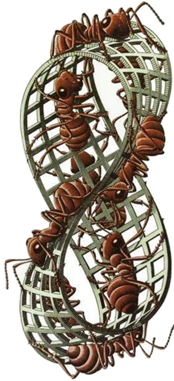
Figure 1: M. C. Escher, Möbius Strip II, 1963, woodcut print.