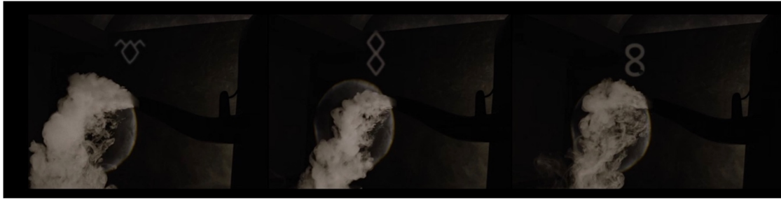
Figure 2: The Owl Cave symbol morphing into a Möbius strip in Twin Peaks – The Return “Part 17.”

been prophesized at the very beginning of The Return , when Cooper, having spent 25 years in the Lodge, is told by the Giant to “remember Richard and Linda: Two Birds with One Stone.” Both Cooper and the viewer are thus asked to recall something at the beginning of The Return that will not occur until the very end of it. Turning the tables, the Giant, still standing next to him, then tells Cooper: “You are far away” – upon which Cooper’s body (or its image) vanishes in thin air at the sound of electricity sparks.