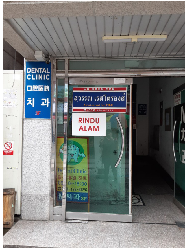
Figure 9: Signs at the entrance to the building, Ansan.