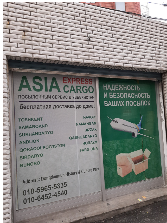
Figure 7: Advertising for a cargo company providing logistic services to Uzbekistan, Mongolian city.

is non-Korean. Nearly a quarter of the zone’s almost 1,400 commercial establishments, mainly restaurants, are owned by foreigners, and many more provide them with jobs and services (Life in Ansan 2019). There are numerous ethnic shops and restaurants catering to every taste, and signs in many different languages and writing systems can be seen everywhere.