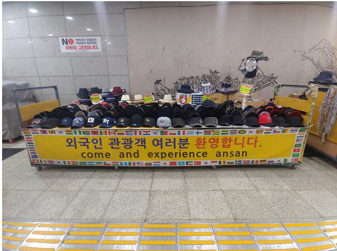
Figure 11: Stall selling baseball caps, Ansan.

representation. The vast majority of shops and restaurants in Itaewon use only two languages in their signboards and advertisements: Korean and English (Lawrence 2012). Other languages are used merely symbolically, mostly as a part of business names, as in the case of Vietnamese café named “Pho House,” referring to a famous Vietnamese dish, and the Uzbek restaurant “Lazzat” (“flavor” in Uzbek). Another Vietnamese restaurant has the name “Toi Toi” or “My My” (Figure 12) but its slogan – “Feel the real Vietnam” – is written in English. Ironically, an invitation to feel something real and authentic is made by means of another – global – language. In other cases, names are written in two languages, in English and in the ethnically relevant one: for example, “Egyptian restaurant Ali Baba” is written in larger letters in English than in Arabic. Also, many Muslim shops and restaurants place the word “halal” in Arabic on their signboards, but an almost equal number of them write “halal” in English. The American franchise “The halal guys” has a restaurant in Itaewon as well, and its name is written in English and transliterated into hangeul (in smaller letters) but without any written Arabic.