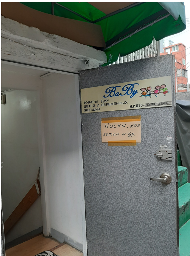
Figure 6: Signs on the door to a shop owned by Russian immigrants, Mongolian city.