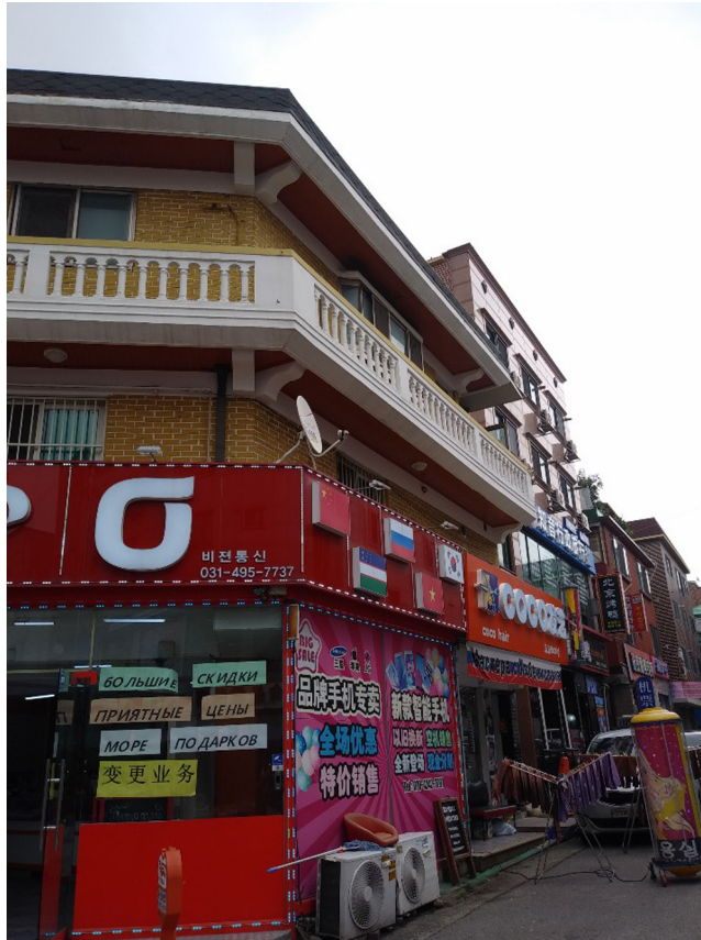
Figure 10: Corner shop, Ansan.

image further popularized by the pop-song “Itaewon Freedom” (2011) and later by the TV drama “Itaewon Class” (2020, available worldwide on Netflix) set there.