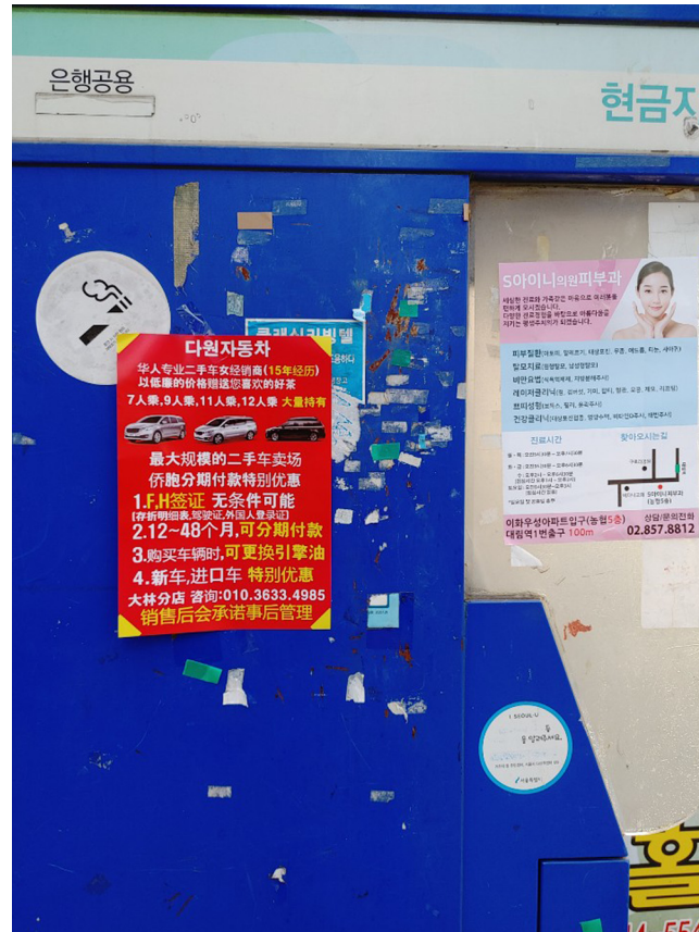
Figure 4: Advertisement for a second-hand car dealership, Daerim-dong.

company preceding the Chinese text – Dawon Motors (=Dawon cars) – is written in Korean. The adjacent advertisement for a dermatologic clinic is monolingual (Korean only). The two texts coexist in the same space parallel to each other; their respective choices of colors (bright red and yellow vs soft pink and blue) parallel their language choice (bilingual with predominance of Chinese vs Korean only). We can assume that they target different audiences; at the same time, since many ethnically Chinese local dwellers are bilingual in Chinese and Korean, the choice of “Korean only” in the second sign does not necessarily mean that Chinese speakers are excluded the same way Korean monolinguals are excluded by the first sign they would not be able to understand. It should be noted here as well that the characters used for writing in Chinese in Daerim-dong belong to the simplified version of Chinese orthography and not to the traditional one which is still in use in Korea and is known as hanja . Nowadays, some extremely rare examples of hanja can be found in linguistic landscapes in some brand names and sometimes in advertisements; overall, its function of “a prestigious form of writing among South Koreans” has been replaced by English (Song 2015, 481). The use of simplified Chinese characters in Daerim-dong signals the targeting of mainland Chinese audience rather than Korean speakers.