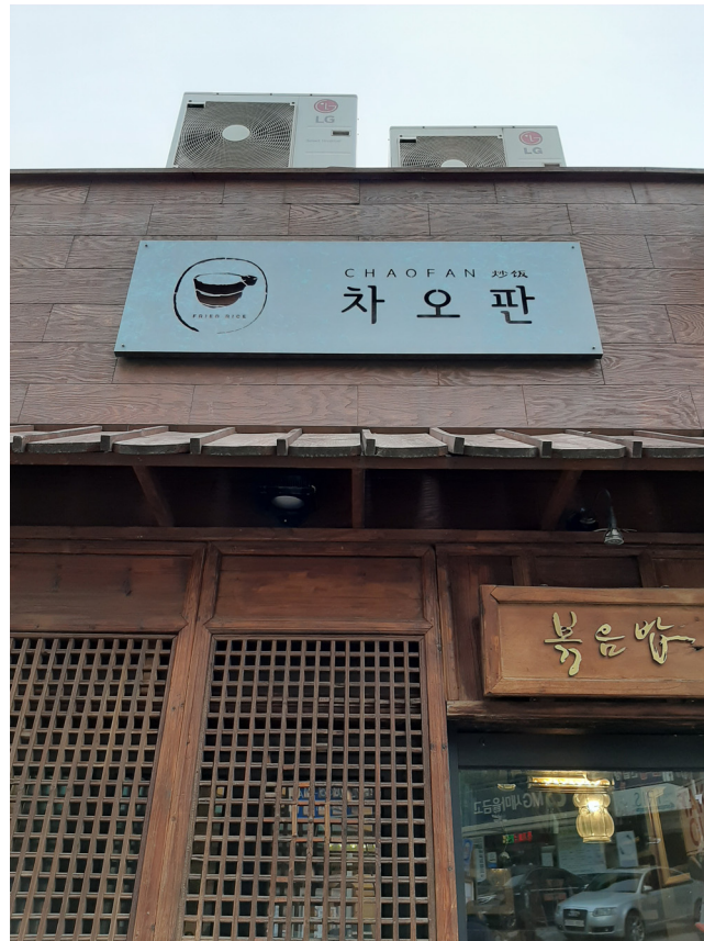
Figure 13: Chinese diner, Itaewon.