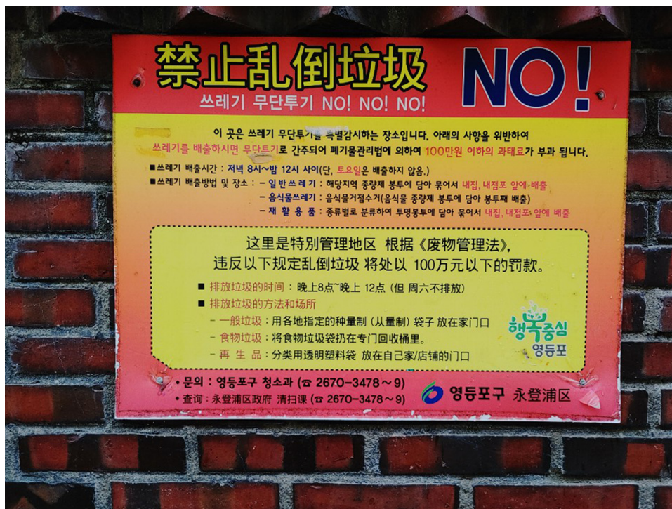
Figure 3: Sign regulating norms and rules of garbage disposal, Daerim-dong.

since it is centered and uses a bigger script. Meanwhile, English is represented via the four-times-repeated exclamation “NO!” – aiming, evidently, at drawing attention and reinforcing the prohibitive message for Korean and Chinese speakers but not at addressing English speakers.