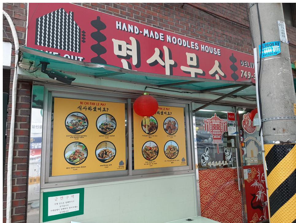
Figure 14: Menu of a noodle house, Itaewon.