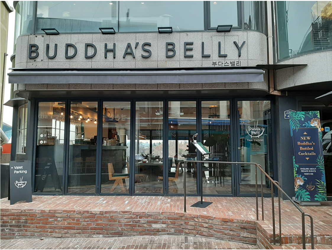
Figure 16: Thai restaurant, Itaewon.