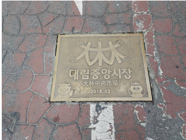
Figure 2: Brass plate in the pavement, Daerim-dong.