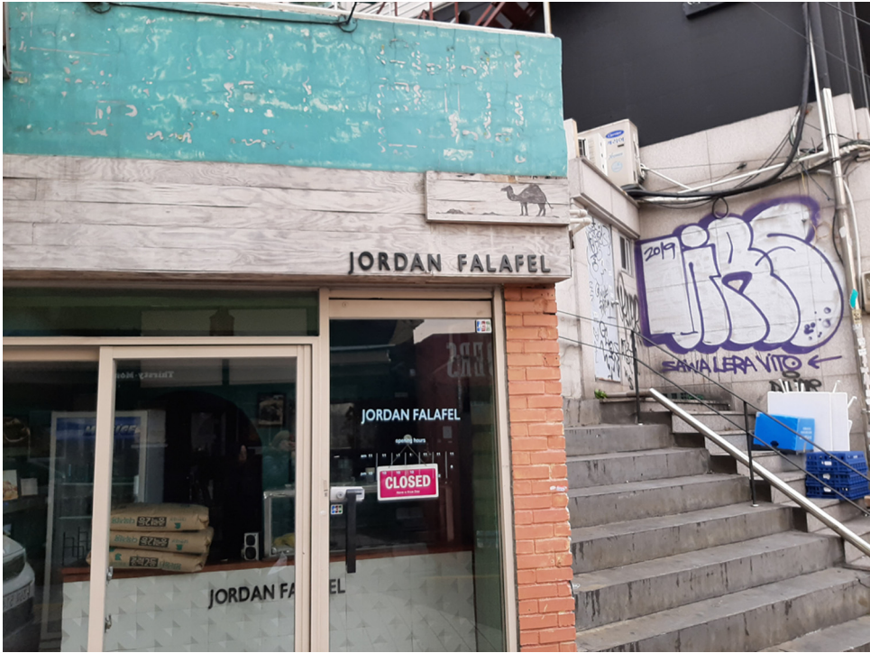
Figure 15: Jordan diner, Itaewon.