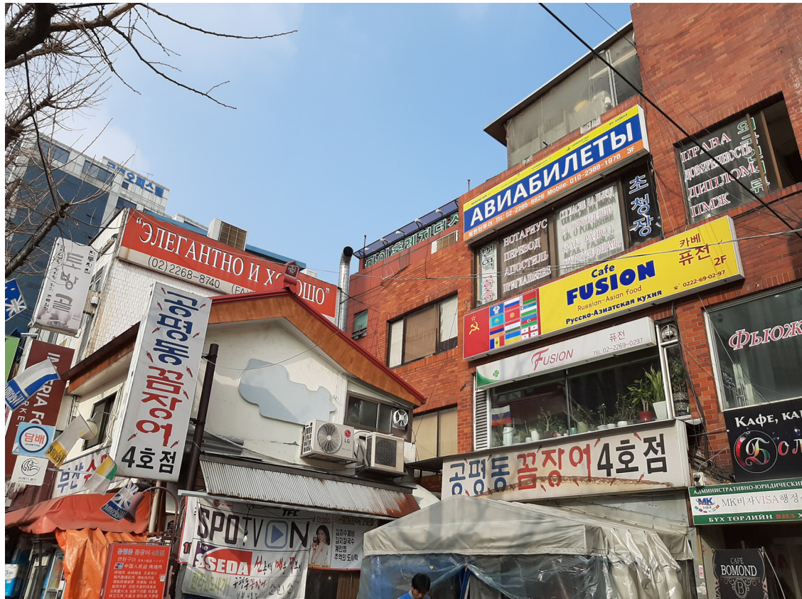
Figure 5: Signboard of café “Fusion,” Mongolian city.

Russian; others acquired it in their home countries where it is still widely in use and occasionally retains its former high prestige (Hogan-Brun and Melnyk 2012). An interesting example of such unequal distribution of symbolic power is represented by the advertising for a cargo company providing logistic services to Uzbekistan (Figure 7). The company’s name and address are written in English; the description of services and the slogan (“Reliability and safety of your parcels”) are given in Russian; the names of the destination cities in Uzbekistan are listed in Uzbek, with some minor misspellings (such as the mixing letters “x” and “h”). In other words, Russian is perceived as a more powerful and persuasive language, suitable to be used in commercials and even in communication between non-native Russian speakers.