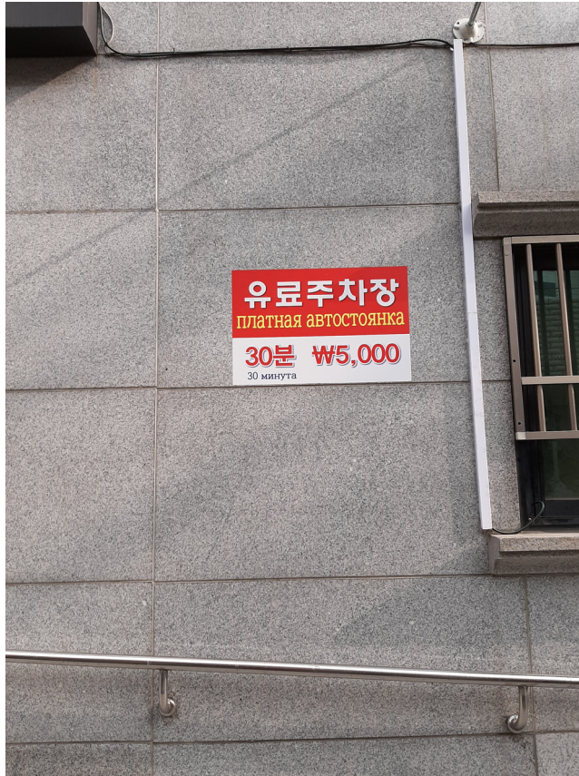
Figure 8: Parking sign, Mongolian city.

because there was no Korean menu; another Korean reviewer, who enjoyed the food and low prices, mentions that it had a menu in English. All other reviews for this restaurant are from Indonesian speakers, evidently its main target group.