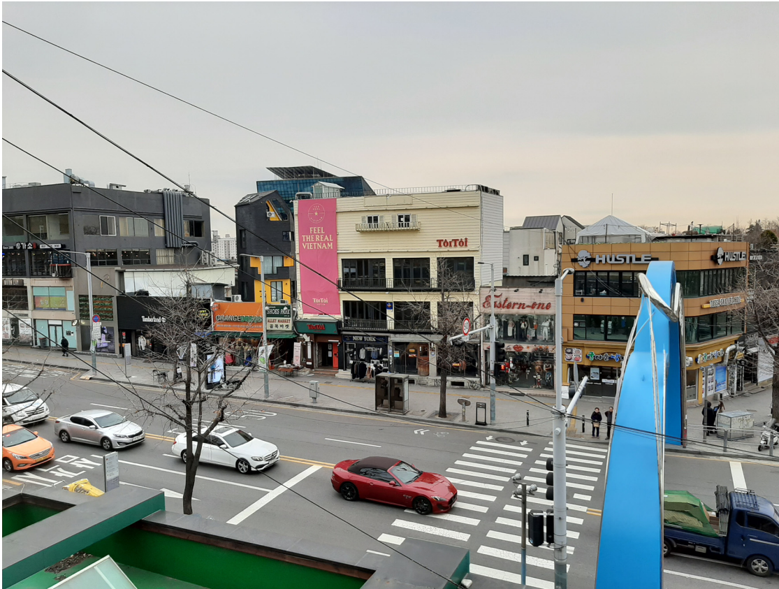
Figure 12: Vietnamese restaurant, Itaewon.

the language itself, is represented in the menu of a noodle house (Figure 14). The Chinese phrase “Have you eaten yet?” is transliterated in English alongside its Korean analogue, written in hangeul . In both Korea and China, the question is traditionally used as a greeting.