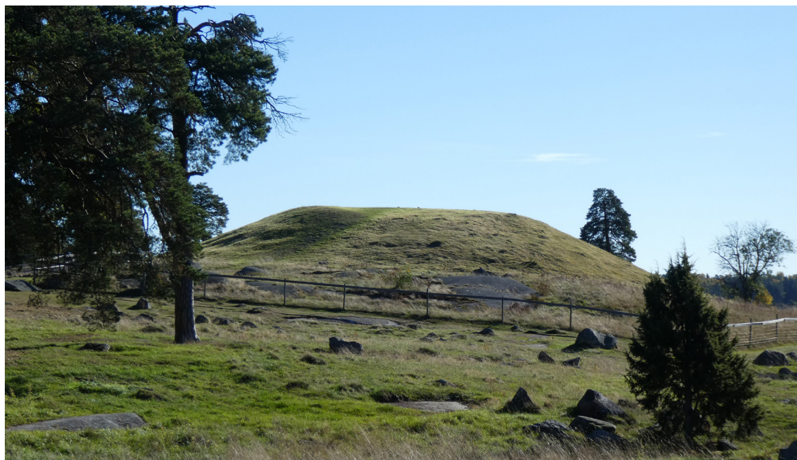
Figure 3: The Late Bronze Age mound at Håga, Uppland. The Håga mound has been a symbol for the southern connections of the Bronze Age period in Uppland.

In the following, we will look at two important Bronze Age sites in Uppland which were investigated during the first decade of the 20th century, two cairns in Torslunda and one mound in Håga (Almgren, 1905; Ekholm, 1921, p. 13–17; see Fig. 3). At both of these sites, excavated graves contained artefacts with southern parallels, and both sites have been of great importance for the interpretation of Uppland's Bronze Age and in discussions on the relations of the Mälaren Valley with areas further to the south.