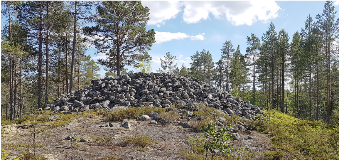
Figure 4: A stone cairn along the coast of northern Sweden, located south of Umeå in the province of Västerbotten.