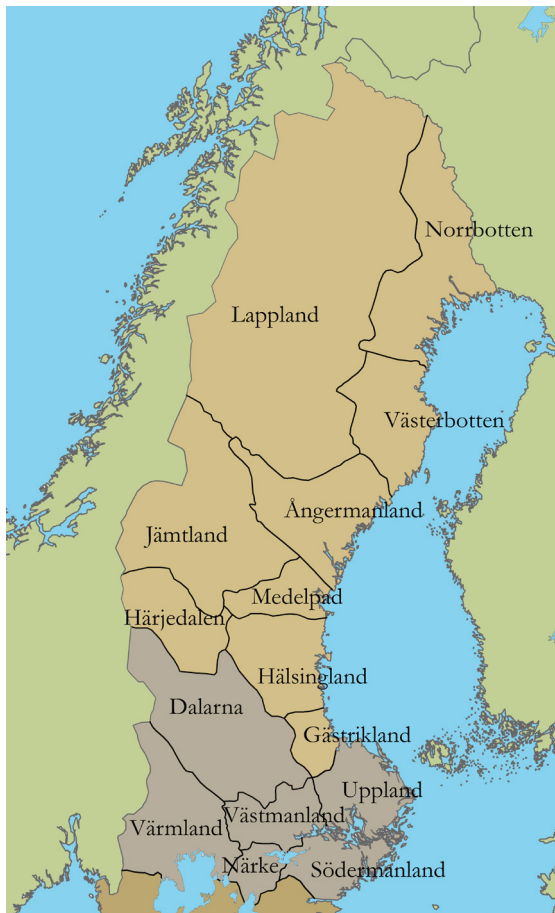
Figure 2: Map showing the provinces of northern and central Sweden. The lighter (brown) areas are northern Sweden or Norrland, the darker (gray) areas are middle Sweden or Svealand. Map by authors.

Ojala & Nordin, 2015, 2019). This structural relation still has a strong effect today on social and economic relations within Sweden, and has deeply influenced the structures of Swedish archaeology. Through much of the history of Swedish archaeology, northern Sweden has to a large extent been reduced to a resource colony, providing different natural resources to middle Sweden (Loeffler, 2005). Here, hierarchical thinking, connected with views on the Sámi population and Swedish colonialism in the north, has played a central role. In the case discussed in this article, concerning interregional contacts in middle and northern Sweden during the Bronze Age, the contacts and influences have mostly been seen as a one-way communication, from the south to the north, as part of this hierarchical thinking. However, there are no reasons to assume that influences did not go in both directions, and that the interregional interaction in prehistoric times was much more complex than earlier thought.