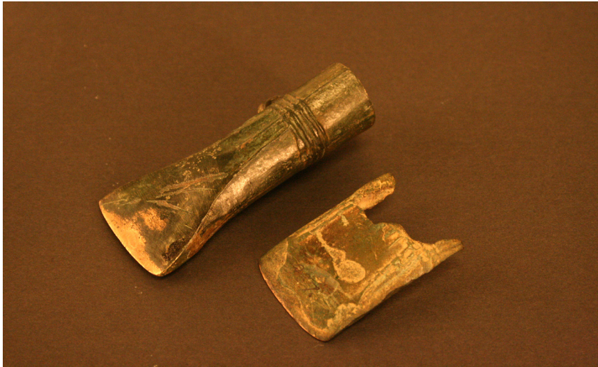
Figure 6: A Mälär axe and an Ananino axe found in the province of Uppland, in middle Sweden. These two types of bronze axes have been connected with the Volga-Kama region in Russia, and have played important roles in discussions on eastern contacts in middle and northern Sweden.

Within Sweden, the Mälär axes have been found mainly in Middle Sweden, with a concentration in the Mälaren Valley area. Besides the axes in Russia, some finds of similar axes are also known from Bornholm in Denmark, Norway, Finland and the Baltic countries (Baudou, 1960; Kuzminych, 1993; Yushkova, 2011; Melheim, 2015; Ojala, 2016). In the end of the 19th century, researchers noticed that the distribution pattern of the Mälär axes in Sweden was concentrated to the Mälaren Valley region. It was not until the work of the Finnish archaeologist A. M. Tallgren during the early 20th century that the distribution of the axes in Sweden was connected with the distribution of similar axes in the Volga-Kama region in Russia (Tallgren, 1911). The Mälaren Valley was considered by Tallgren and others to have been a prosperous central region with a wide-ranging network of contacts which stretched across the Baltic Sea to the Volga-Kama region (see e.g. Tallgren, 1911, 1916). Furthermore, it was stated that the influences originated from Sweden (Tallgren, 1916, p. 362; Nerman, 1954).