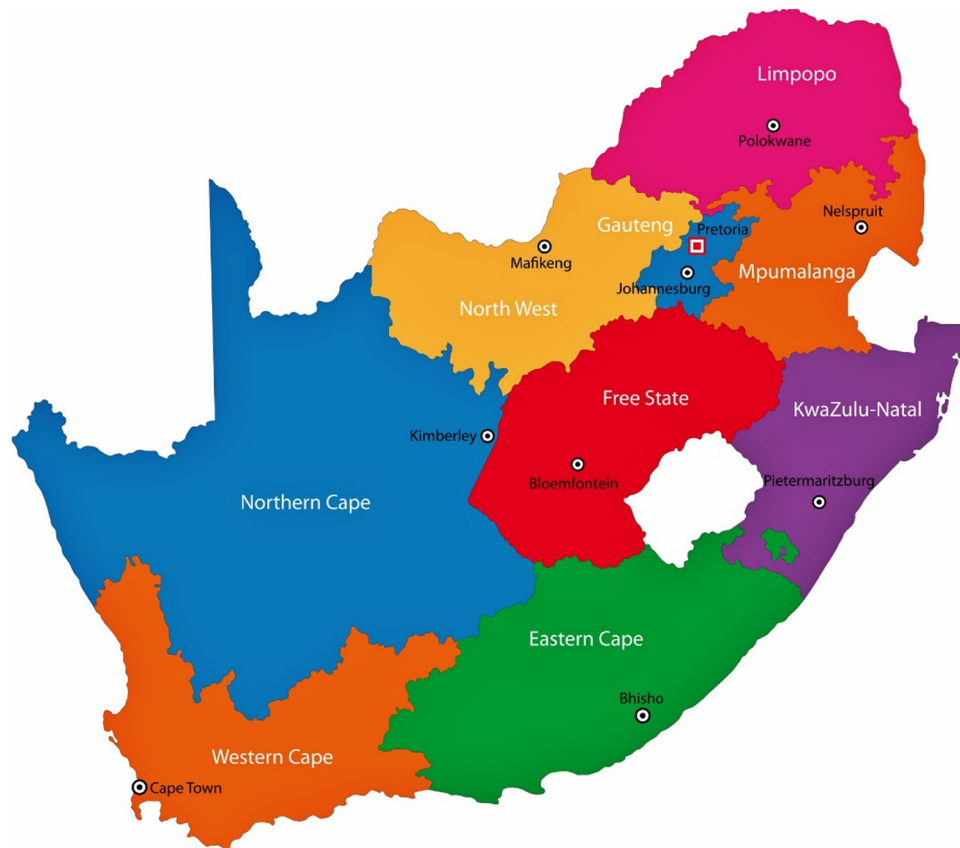
Figure 3: A map of South Africa [54].

collected through this method, also known as computer-administered data collection. Second, questionnaires were distributed by the researcher among the respondents at agricultural events across South Africa. Different organisations involved in the development and management of agriculture in South Africa assisted with this distribution, including the largest agricultural event, the annual NAMPO Harvest Day (2018). Approximately 480 questionnaires were collected through this method.