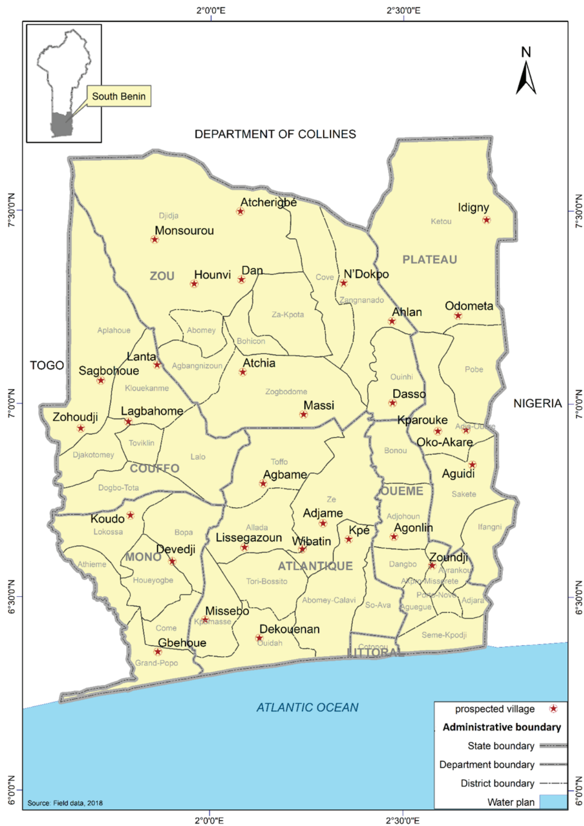
Figure 1: Map of Southern Benin showing the geographical position of the surveyed villages