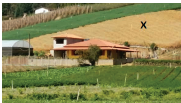
Figure 3: No-tillage, straw not incorporated, identified with X

As for the green manure cultivation, 22 respondents used herbicide to burn the black oat, and 2 respondents