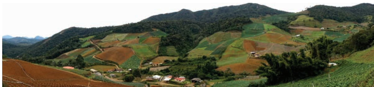
Figure 2: Barracão dos Mendes micro basin's landscape, Nova Friburgo County