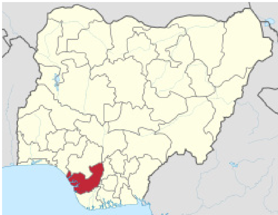
Figure 1: Location of Delta State in Nigeria; Source: Wikipedia, 2017 ( https://en.wikipedia.org/wiki/Delta_State )