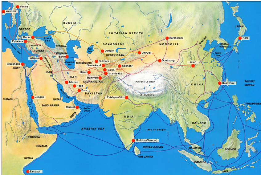
Figure 2: Silk Road on today's map.

the Persian Gulf and the Red Sea (Pirie 2019). Perhaps, China's coastal cities of Guangzhou and Xinjiang can be thought of as 13th-century global free trade zones.