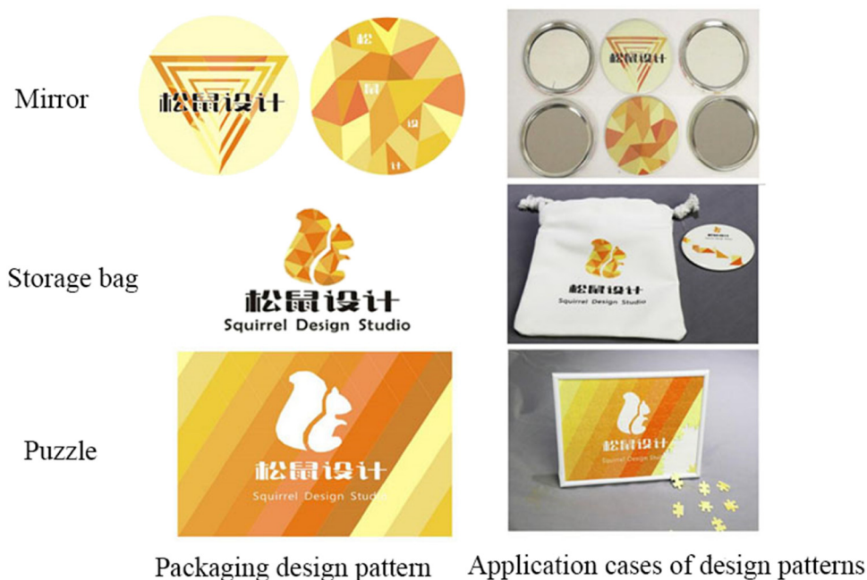
Figure 3: Packaging design patterns used for the three types of gifts and application cases.

This study evaluated the gift packaging pattern design of Squirrel Design Studio. Due to the variety of gifts and the relatively large number of packaging pattern design solutions used on the surface packaging of the gifts, limited by space, only three gifts and their packaging patterns were selected for analysis, and their patterns and application cases are shown in Figure 3. The gifts chosen were mirrors, storage bags, and puzzles. The mirror was a 7.5 cm diameter round flat mirror with a paper packaging design on the back. The storage bag was made of knitted fabric, 18.5 cm long and 15 cm wide, white in color, with the packaging design printed on the center. The puzzle was made of a panel and corresponding puzzle pieces, all made of