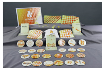
Gift packaging samples