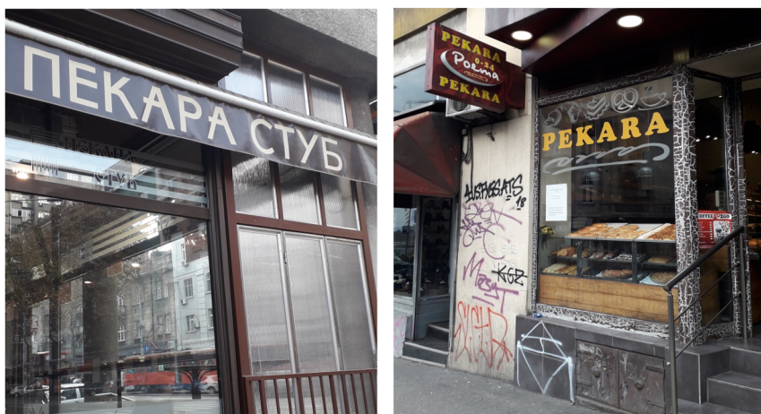
Figure 1: Two bakeries in Belgrade.

The fact that Serbians can choose between two scripts is at least in part attributable to former Yugoslavia. There, both Cyrillic and Latin were co-official. Since the fall of Yugoslavia, however, Latin and Cyrillic have acquired pertinent semiotic properties in popular Serbian discourses. Latin has become discursively associated by some with modernisation, cosmopolitanism, an affiliation with the West and an openness to integration with Europe (Ivić 2001; Radovanović 2000), but by others with an assault on Serbian heritage, often intertwined within discourses of Serbia being victim to a western-led international conspiracy (Hodges 2016). Cyrillic, on the other hand, has for some been iconised, as Jovanović (2018) discusses, with the preservation of a Serbian, quintessentially non-Croatian identity to aid the post-war nation-building process, and for others with over-zealous religious ethnonationalism, conservatism and Russian political sympathies. What is more, the Russian invasion of Ukraine has, for Serbian discourses, only amplified attention to the pull of Russia from the East into its orbit, and the pull from the West towards democratisation and integration. Serbian government-backed media, known for its Russian sympathies, is criticised for seeing the West “a provocateur, hegemon, instigator of the crisis, promoter of a fake pandemic and vaccines bearing chips to track humans”