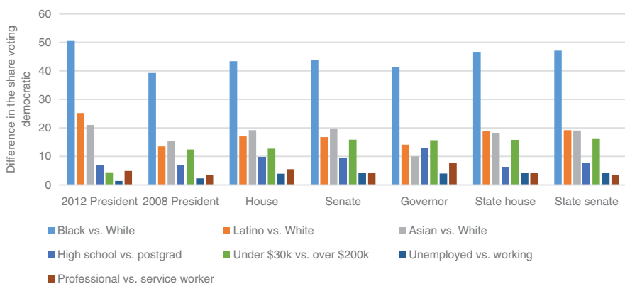
Figure 2: Race and Class in American Elections.

And when we look more broadly across a range of national and state elections between 2006 and 2012 as we do in Figure 2, we see essentially the same pattern of heightened racial divisions and muted class divisions. In every type of contest from Presidential elections all the way down to state legislative elections, race typically outweighs class. Across these different contests, the average Black-White gap hovers between 40 and 50 points. But it is not just the Black-White divide that stands out. The gap between White voters and Latino voters