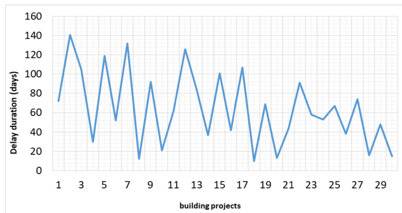
Figure 3: Line chart of the total delay due to five factors in 30 projects.

them and finally among the 5 factors from among all factors with the highest repetition rate. It is as follows: (1) problems with neighbors; (2) changes by the employer in the implementation phase; (3) use of inexperienced contractors; (4) security problems; and (5) irrational contract period.