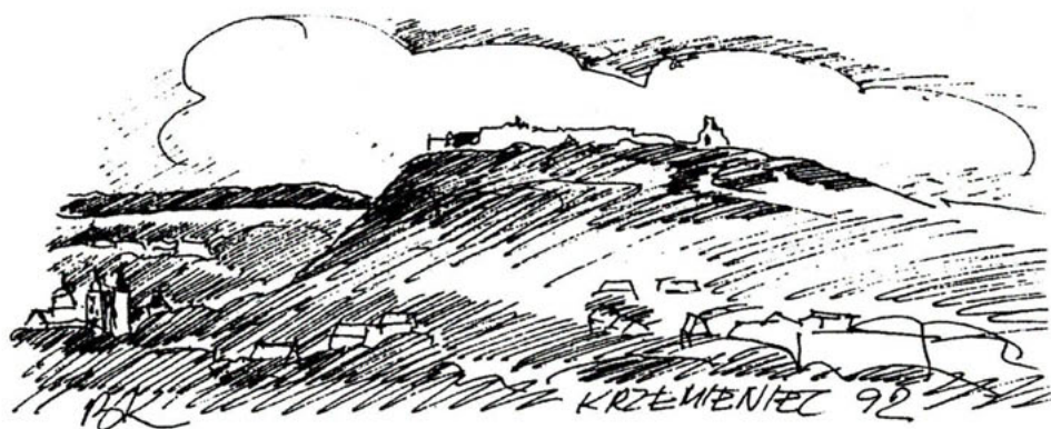
Krzemieniec, drawn by Boleław Kopociński