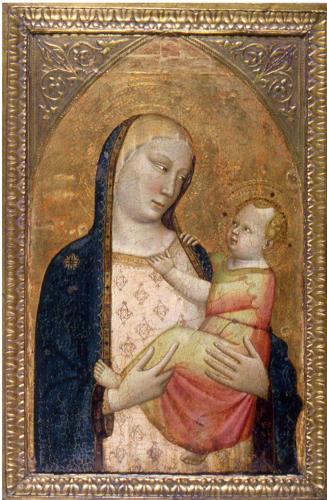
Figure 11. Workshop of Bernardo Daddi. Madonna and Child . 1345–1349. Tempera and gold leaf on panel, 27 1/16 x 18 7/16 in. Baltimore: Walters Art Museum. Web. 27 May. 2017. < http://art.thewalters.org/detail/38112/madonna-and-child-26/ >.