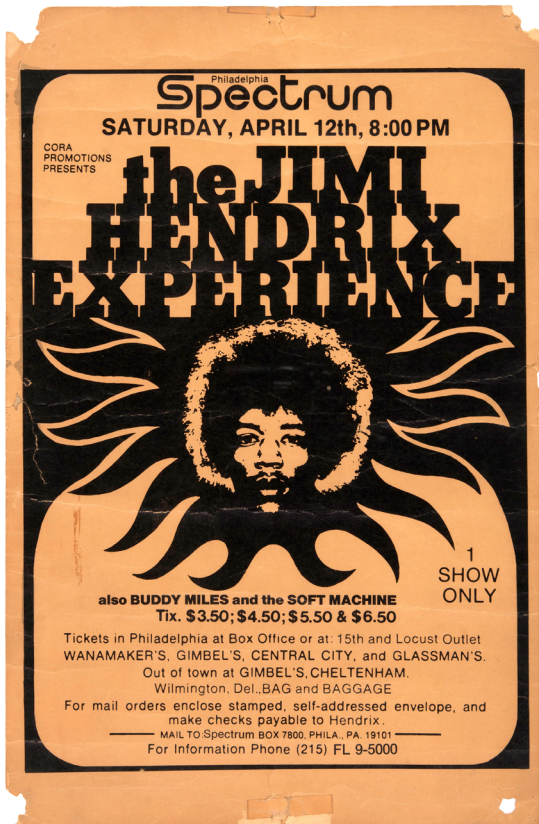
Figure 5. Jimi Hendrix and the Band of Gypsies Concert Poster, April 12, 1969. The Philadelphia Spectrum, Philadelphia, PA.