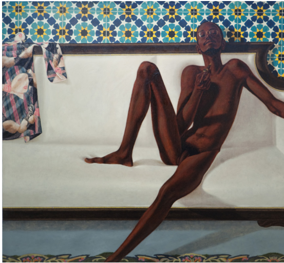
Figure 8. Hendricks, Barkley L. Family Jules: NNN (No Naked Niggahs) (1974). Oil on Linen, 72 x 66 inches. ©Estate of Barkley L. Hendricks. Courtesy of Jack Shainman Gallery, New York.

Perhaps making another camp statement probing the boundaries of black male expression and/or gay performativity, Hendricks does not reserve the odalisque convention for Taylor. He also renders a young Mother or Sister in an odalisque lean in Sweet Thang (Lynn Jenkins) (Figure 9) that, in part, echoes Taylor's NNN position. Hendricks uses camp to give visibility to intimate black spaces and an expanded habitus in Philadelphia MFSB contexts by simultaneously referencing significations of orientalism within these imaginaries. In this way, Hendricks's painting offers an opportunity to reflect upon the manner in which both black vernacular and "orientalised" cultures have been historically subjugated by heteropatriarchal design (Smith 67, 68).