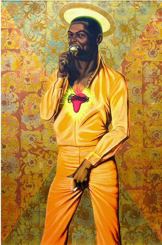
Figure 13. Hendricks, Barkley L. Fela: Amen, Amen, Amen, Amen (2002). oil and variegated leaf on linen canvas, wooden frame, altarpiece, armature, 27 pairs of high heels 66 \frac{3}{4} x 46 \frac{2}{4} in. ©Estate of Barkley L. Hendricks. Courtesy of Jack Shainman Gallery, New York.

In the Nasher [Museum version of the] show, the framed painting sat on an altar shelf above a jumble of 27 pairs of hand-painted high-heel shoes, representing the women in Fela's life (singers, dancers, girlfriends).