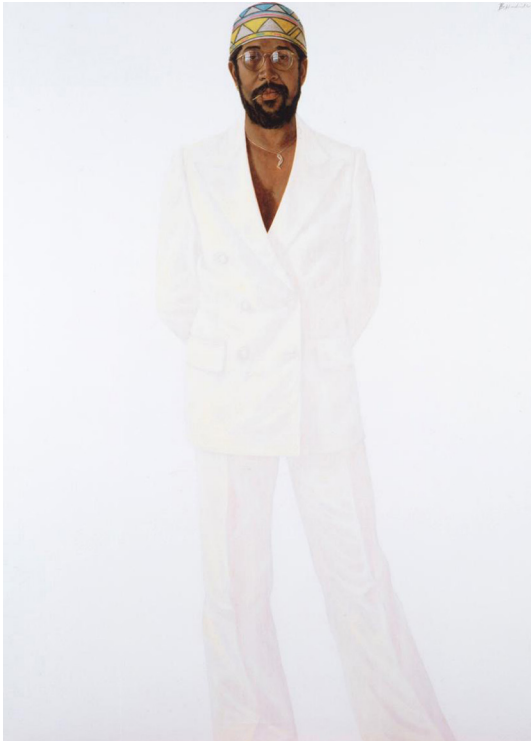
Figure 15. Hendricks, Barkley L. Slick (Self-Portrait) (1977). Oil, acrylic, and magna on linen canvas, 72 x 48 inches. Chrysler Museum of Art, Norfolk, VA Gift of the American Academy and Institute of Arts and Letters, New York 78.62