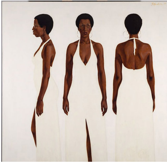
Figure 4. Hendricks, Barkley L. October's gone... Goodnight , (1973). Oil and acrylic on linen canvas, 72 x 72 inches ©Estate of Barkley L. Hendricks. Courtesy of Jack Shainman Gallery, New York.

Moreover, the energy of Hendricks's works is not to be exclusively a function of his portrait scale, but one that is most viably actualized by his virtuosic attention to surface details, such as the sheen of skin or a sunglass lens and the fuzz of a fur lapel, the sparkle of a button or medallion, and the shine of a hairdo or faux-leather coat, to create an overarching sense of “making everyday black people special,” to borrow Ellen Dissanayake's term, “making special” being how artists distinguish between states of the ordinary and the “extraordinary, or supernatural,” and exhibit this difference in their works (22). The “shimmering whole” (Wölfflin 46) that Hendricks creates through his mastery of surface elements is one of a black “familial” 7 as a visuality of artistic and social agency and freedom.