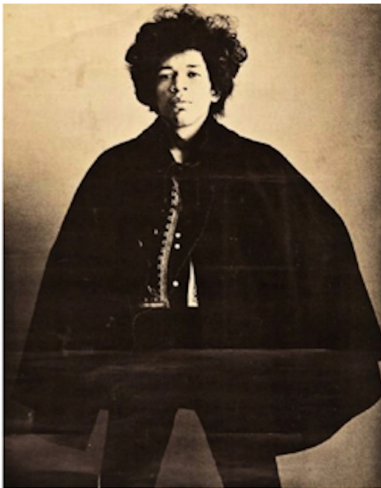
Figure 7. Jimi Hendrix in a cape, 1967. The ensemble and pose remind us of Barkley Hendricks's George Jules Taylor (Figure 1).