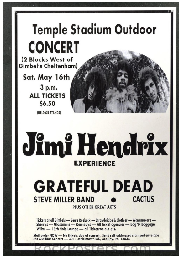
Figure 6. The Jimi Hendrix Experience Concert Poster, May 16, 1970. Temple Stadium, Philadelphia, PA.