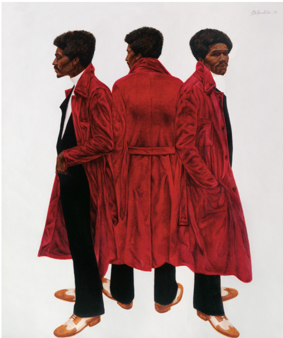
Figure 3. Hendricks, Barkley L., Sir Charles, Alias Willie Harris (1972). Oil, acrylic, and aluminium leaf on linen canvas, 84 1/8 x 72 in.

By endeavouring to create a sense of totality in his paintings of individuals, the implication may be the insertion of a spiritual significance. Hendricks's technique of simultaneity imbues the resultant portraits with a hyperrealism, if not supernaturalism, 6 as seen in, for instance, Eastern Orthodox religious icon paintings, which exaggerate features and otherwise intensify an uncanny presence of the body to evoke “not the portrait of the outward form of a man but . . . the inner form of a saint” (Robinson 354-355). To appropriate and/or add an alternative significance to the hegemonic symbolism of the number three as a reference to the Holy Trinity showcased in Italian Renaissance painting (Aiken 173), in Hendricks's portraits, “three” might signify the jazz god Charles Mingus, whom Hendricks revered (Mangan 38). Mingus opens his autobiography with a line that may inform Hendricks' gesture of excess in this regard, which reads: “Mingus One, Two and Three. Which is the image you want the world to see?” (Mingus and King 3). Hendricks states that to a great extent, he transposes into his painting Mingus's musical approach, wherein the jazzman builds each composition “from the previous one” (Mangan 38).