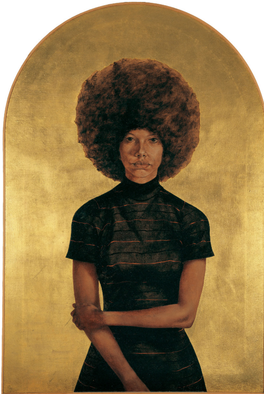
Figure 12. Hendricks, Barkley L. Lawdy Mama (1969). oil and gold leaf on canvas 53 3/4 x 36 1/4 inches