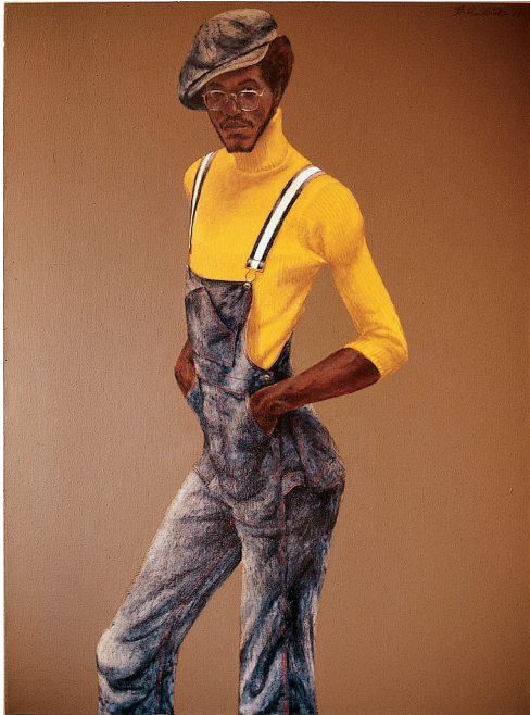
Figure 10. Hendricks, Barkley L. Jules (1971). Oil and acrylic on linen canvas, 60 1/2 x 45 3/4 in.