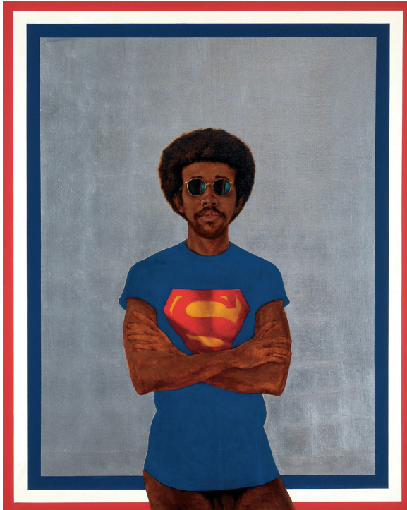
Figure 2. Hendricks, Barkley L., Icon for My Superman, (Superman Never Saved Any Black People—Bobby Seale) (1969). Oil, acrylic, and aluminium leaf on linen canvas, 59 1/2 x 48 in.

The exhibition Soul of a Nation: Art in the Age of Black Power , traveling from Summer 2017–Winter 2019 to various museums, revisits the dialogue jump-started by curator Golden’s Black Male and is complicated by Hendricks’s self-portrait, Icon for My Man Superman (Superman Never Saved Any Black People—Bobby Seale) (1969) (Figure 2), included among the works on display. Hendricks paints himself not as an exceptional figure of fame, but also as an ordinary figure of greatness.