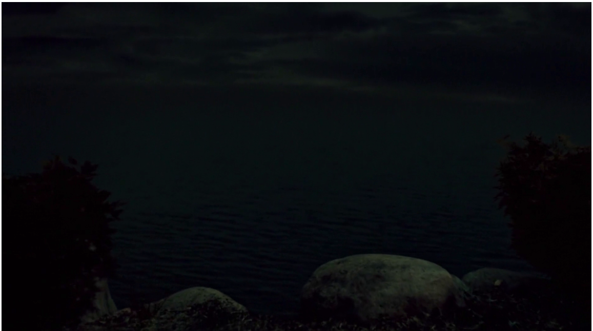
Figure 12. Return to nigredo ? The tracking shot moves from over the cliff towards the murky waters below. Darkness prevails. We are back to square one (and to Will’s natural element); the descent to hell is happening again. Screenshot from the thirteenth (and final) episode of season 3, “The Wrath of the Lamb.”