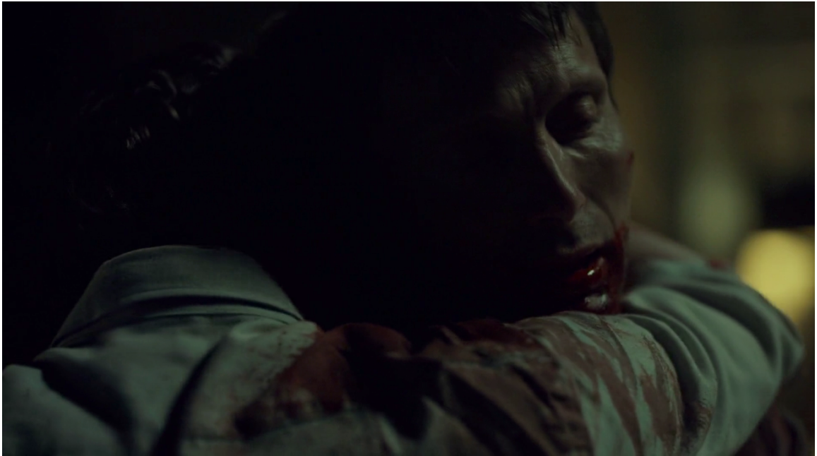
Figure 11. The split second before Will pushes Hannibal off the cliff. The yellowish light on the right (corresponding to the alchemical stage of citrinitas ) is dominated by greenish hues. This is not the beginning of a new cycle, but rather a devolution into its initial phases. Screenshot from the thirteenth (and final) episode of season 3, “The Wrath of the Lamb.”