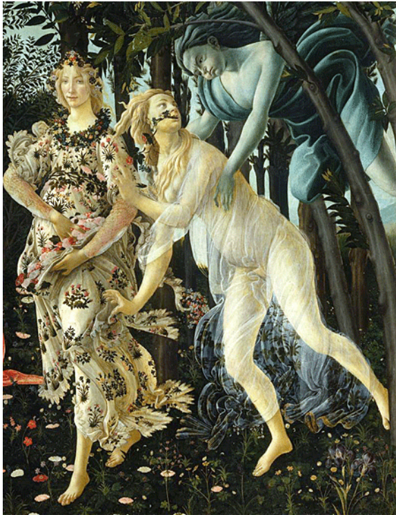
Figure 3. The detail focuses on the aggressive Zephyrus (whose wings are stuck in the branches of the tree) and fearful Chloris, who is literally pushed by him onto the scene. https://artstor.wordpress.com/2013/03/20/spring-mysteries-botticellis-primavera/ .