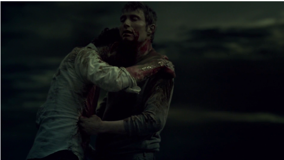
Figure 10. Will embraces his true nature by embracing Hannibal. Screenshot from the thirteenth (and final) episode of season 3, “The Wrath of the Lamb.”