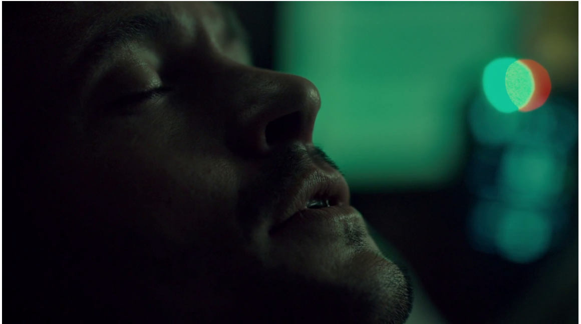
Figure 7. The motif of Jungian Mysterium Coniunctionis returns in Season 3, ep. 2, “Primavera,” directed by Vincenzo Natali. The screencap shows Will waking up in hospital, after the ordeal inflicted by Hannibal which took place at the end of season 2 and is brought back, almost in its entirety and maybe in Will’s nightmarish dream, at the beginning of the episode. Medical equipment is the source of intersecting circles of light which, however, could also be a projection of Will’s subconscious and appear only in the brief moment of lucidity between Will’s coma and his subsequent hallucination involving dead Abigail’s visit to the hospital ward.