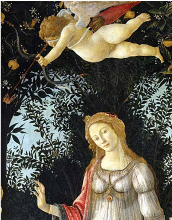
Figure 2. Sandro Botticelli, details of Primavera ; Allegory of Spring, c. 1478, Galleria degli Uffizi. Image and original data provided by SCALA, Florence/ART RESOURCE, N.Y.; artres.com ; scalarchives.com | (c) 2006. The detail above shows Venus, or rather Isis, with her characteristic pendant, and the idea of passionate, blind love embodied by the Cupid's arrow. https://artstor.files.wordpress.com/2013/03/venus_detail.gif?w=314 .