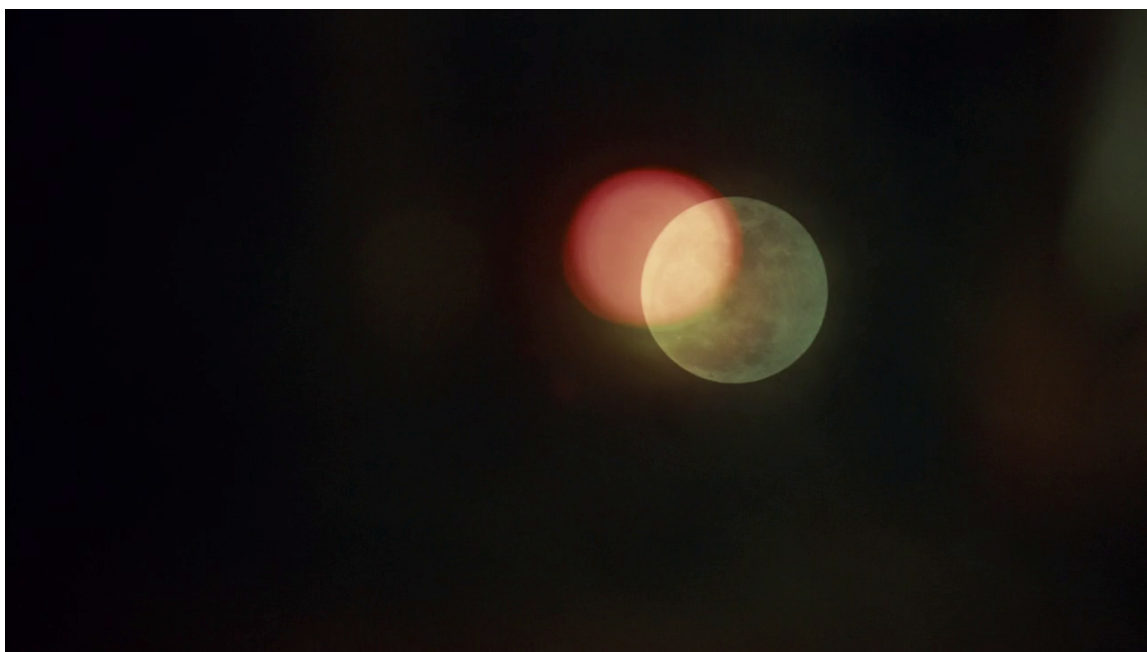
Figure 6. The rear light of Hannibal's bike is match-cut with a full moon. This visual codes the pairing of opposites, or, to use Jung's description, the “marriage” of consciousness and unconsciousness, symbolized by the closeness of Sol and Luna (106); it also foreshadows/foregrounds the theme of love between Hannibal and Will and, alchemically speaking, announces the possibility of transitioning from the albedo to rubedo stage. Worth recalling is Zeri's comment about Venus's (more likely, Isis's) medallion in Primavera , in which “the flame of the fire of love” is “captured by the ruby set into the pendant” (Zeri 12). Screenshot from Hannibal , season 3, episode 1, “Antipasto.”