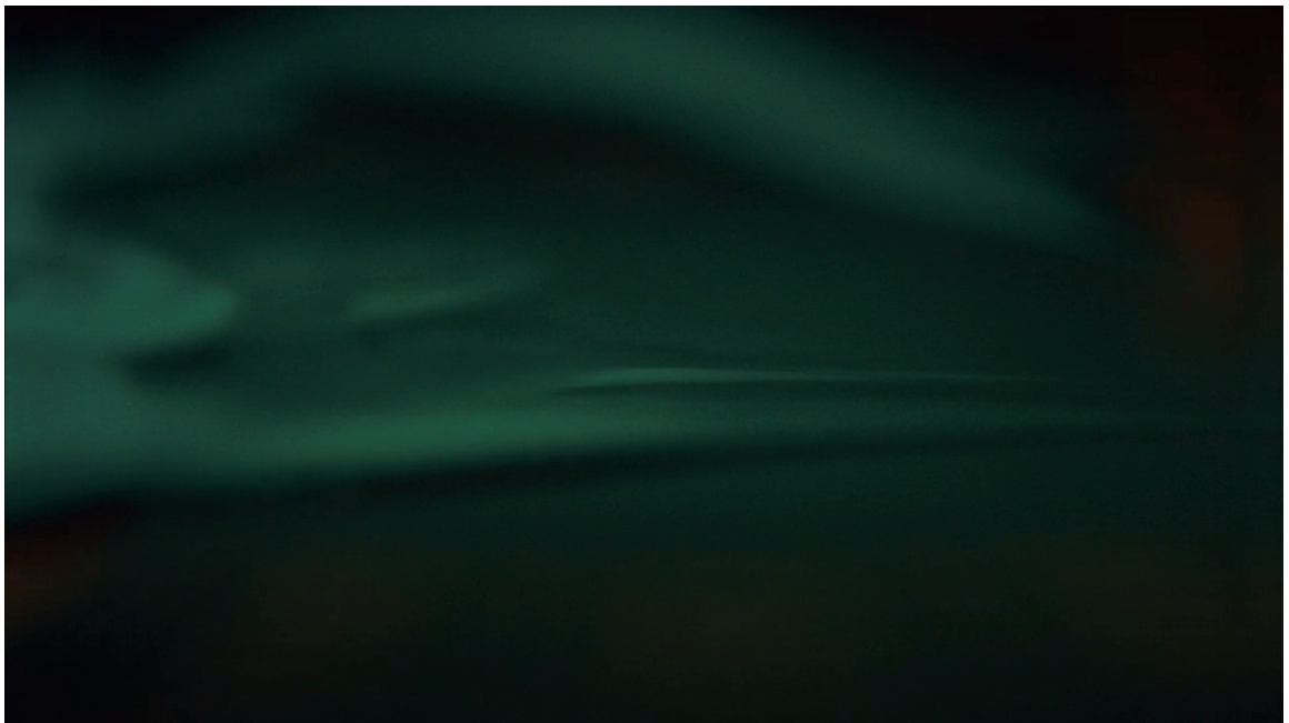
Figure 4. The symbolic beginning of the “nigredo” stage rendered by dark green colour palette at the beginning of the third season of the series, right after the flashback from season 2. Symbolically, the visual is also a reminder that the first half of season 3 is “really about the afterlife,” mostly “in the sense of life after trauma,” which irrevocably changes the characters, including Hannibal (MM). The key of Hannibal’s motorbike is put into ignition. The fumes are reminiscent of Zephyrus’s angry/furious breath. Screenshot from Hannibal , season 3, episode 1, “Antipasto,” directed by Vincenzo Natali.