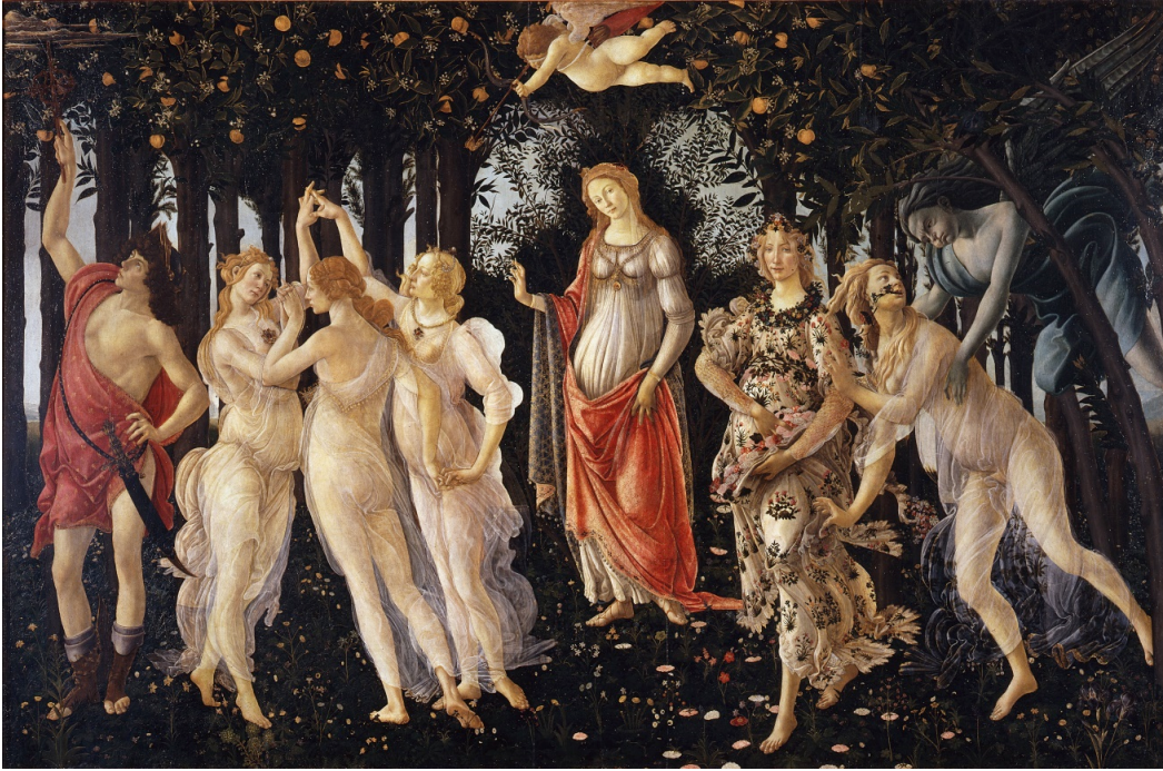
Figure 1. The photographic reproduction of Sandro Botticelli's Primavera available at https://en.wikipedia.org/wiki/Primavera_(painting) , dated to 1482 and linked to the following source/photographer: http://www.googleartproject.com/collection/uffizi-gallery/artwork/la-primavera-spring-botticelli-filipepi/331460/ . Read from right to left, Primavera celebrates the desired progression in the “healthy” alchemical cycle, from darkness to whiteness to redness.