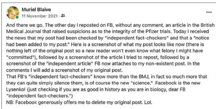
Figure 3. Little communist joke addressed to the “Facebook independent fact-checkers” on November 11, 2021

Lysenko was a Stalinist pseudo-scientist who rejected Gregor Mendel’s revolutionary discoveries on genetics and who “used his political influence and power to suppress dissenting opinions and discredit, marginalize, and imprison his critics, elevating his anti-Mendelian theories to state-sanctioned doctrine.” 56 Sadly, Lead Stories missed the reference and failed to censor my little joke.