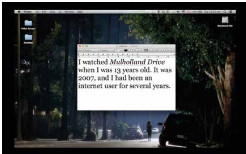
Fig. 15.1. Jessica McGoff's desktop documentary My Mulholland (2020).

of cinephilia, even as it is caught in the compulsion to repeat,” 55 as in the case of the desktop documentary My Mulholland (2020), by Jessica McGoff. The video is a sort of re-enactment, through screen-capture technology, of her experience as a precocious preteen cinephile frightened by Mulholland Drive (David Lynch, 2001). 56 McGoff's singular experience becomes the starting point for a deep dive into the history of the internet, allowed by the Internet Archive and the digital repository Wayback Machine, and a meditation about the pervasiveness and the ambiguous nature of images.