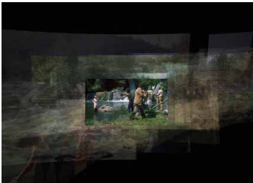
Fig. 15.3. A still from Davide Rapp's VR film Montegelato (2021).

methodological tool has not held back the hybridization between languages, between fields and areas of film studies, and between practitioners from different backgrounds that has characterized its birth and development. This hybridization allows video essays to circulate in platforms and contexts that range from festivals and events to online magazines, from streaming platforms to university classrooms, and helps such form to reach an audience that goes beyond film scholars or professional film critics.