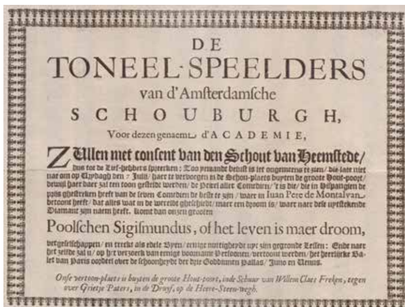
Figure 4.1 Poster announcement for Sigismundus , the Dutch performance of Calderón's La vida es sueño , by the Schouwburg actors on tour in Haarlem, 1656