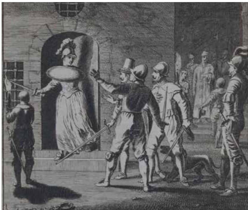
Figure 4.3 Stantvastige Isabella (1651), frontispiece