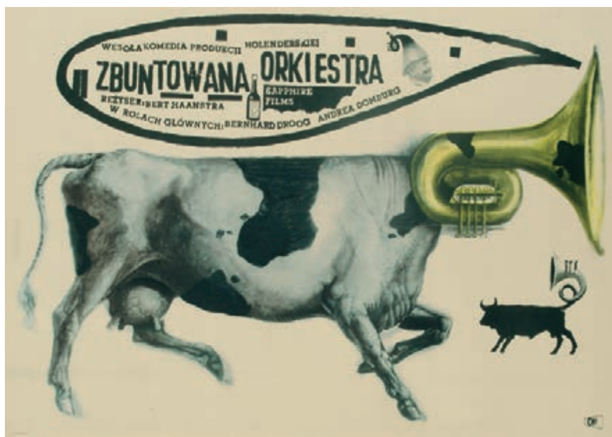
Plate 1. FANFARE