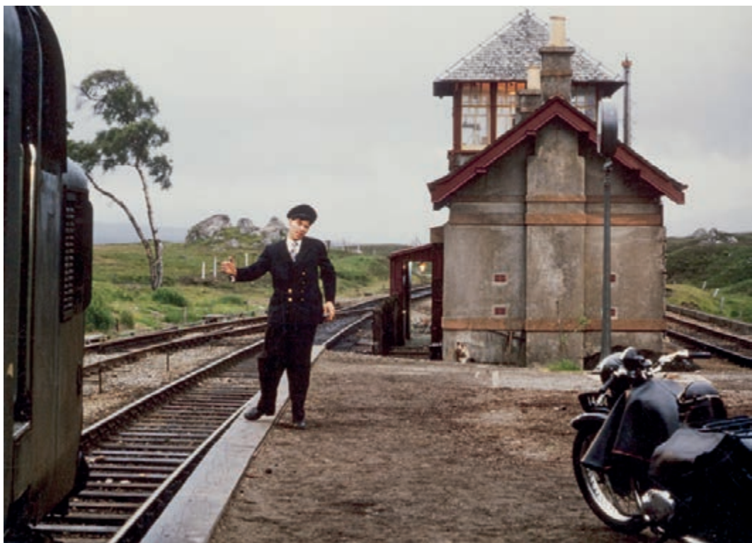
Plate 2. DE WISSELWACHTER