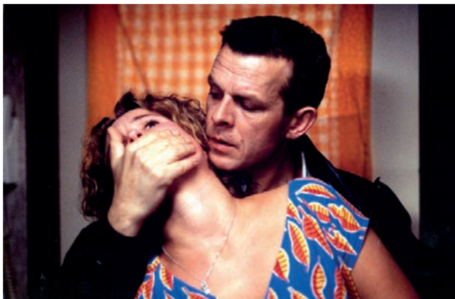
Plate 23. DE JURK