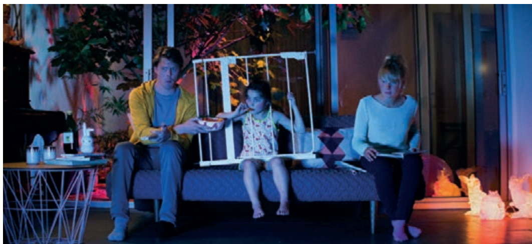
Plate 21. AANMODDERFAKKER