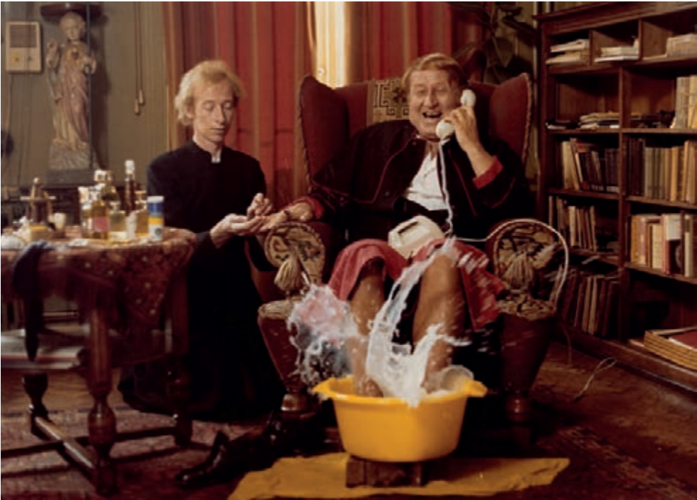
Plate 25. DE MANTEL DER LIEFDE