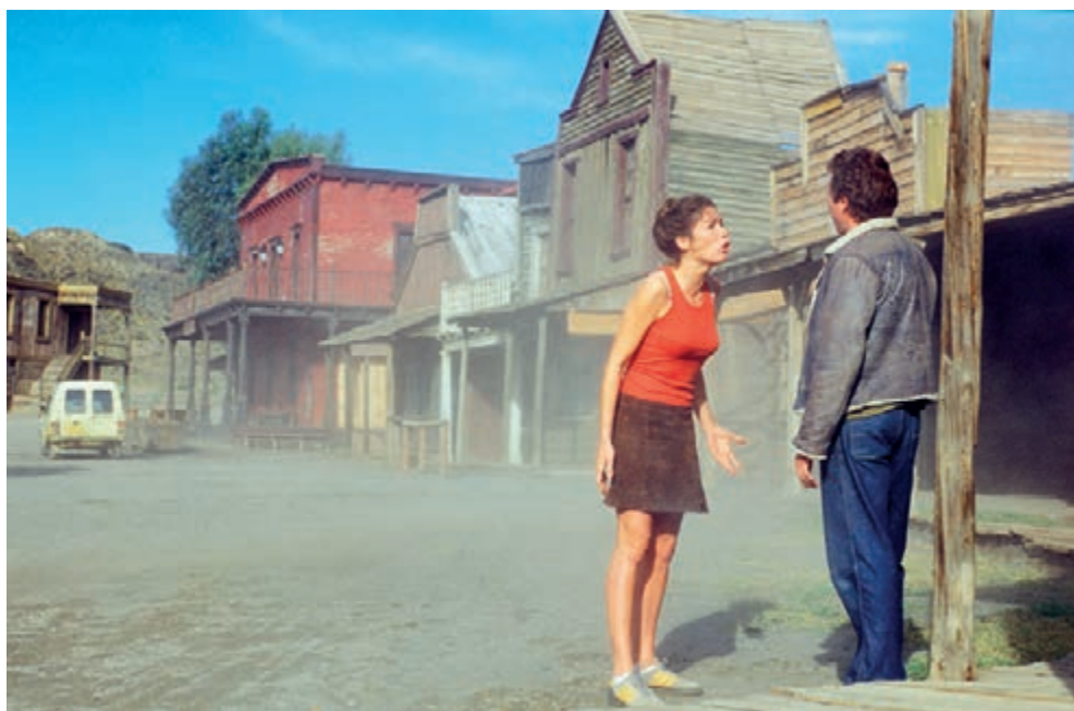
Plate 18. GRIMM