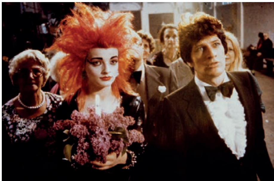
Plate 13. CHA CHA