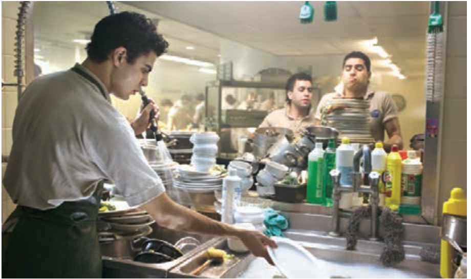
Plate 10. HET SCHNITZELPARADIJS