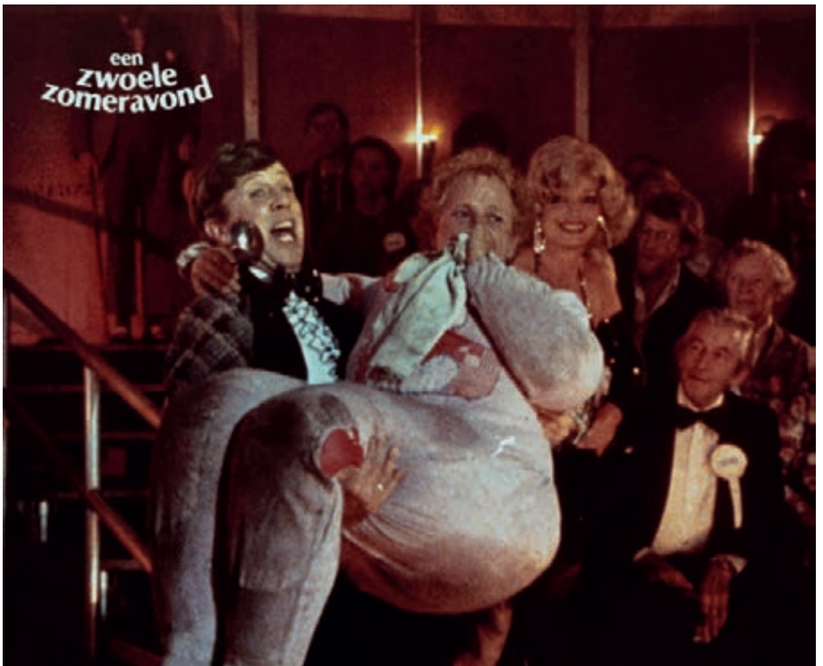
Plate 11. EEN ZWOELE ZOMERAVOND