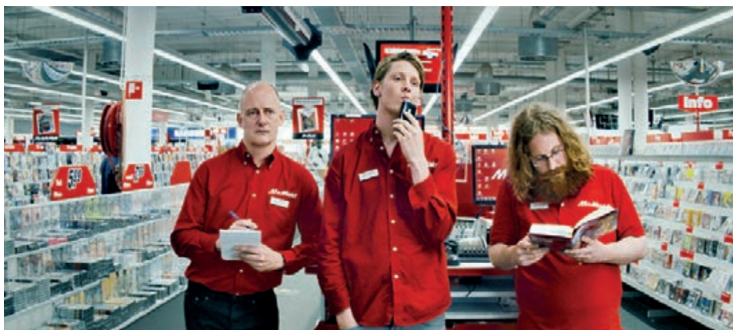
Plate 20. AANMODDERFAKKER