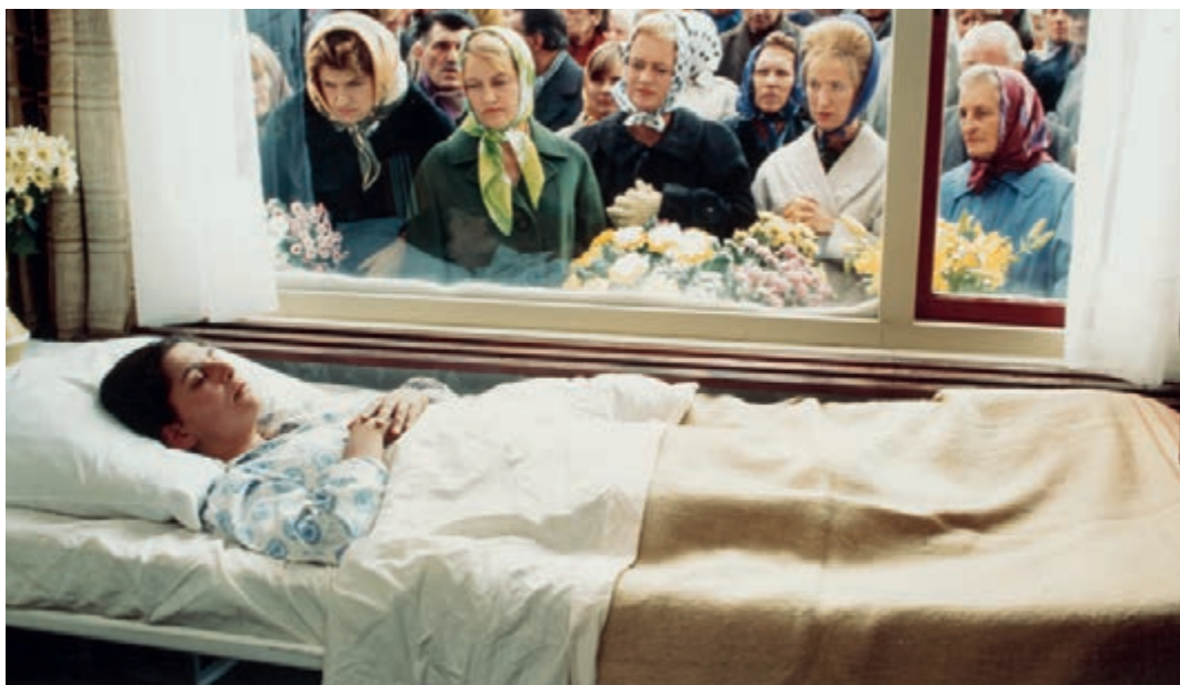
Plate 5. DE NOORDERLINGEN