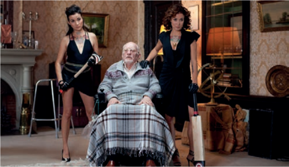
Plate 24. BLACK OUT