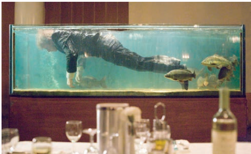
Plate 15. OBER