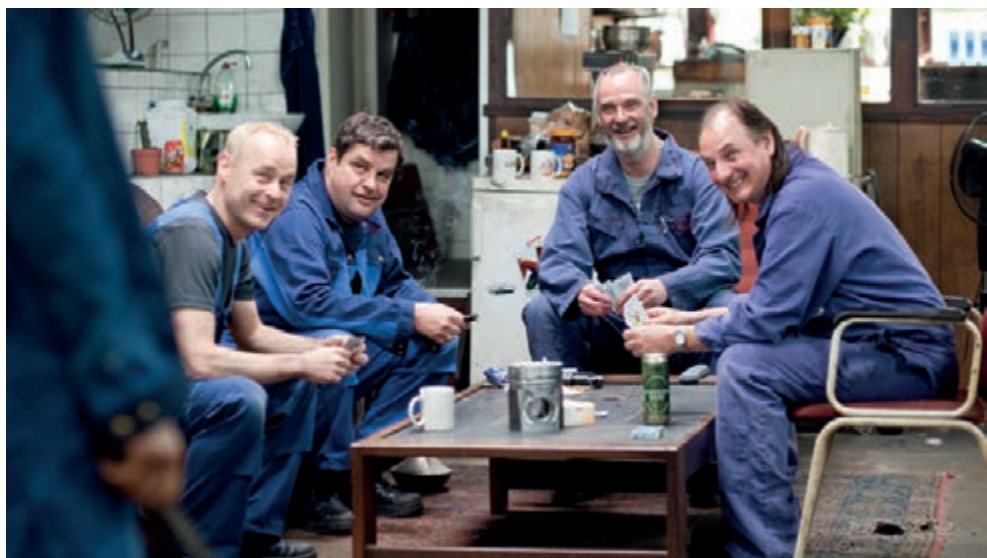
Plate 14. DE MARATHON