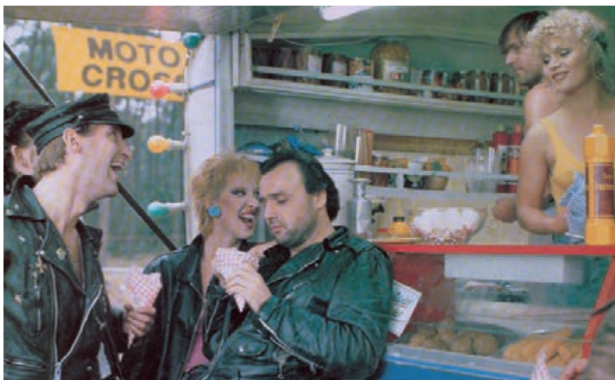
Plates 29. SPETTERS