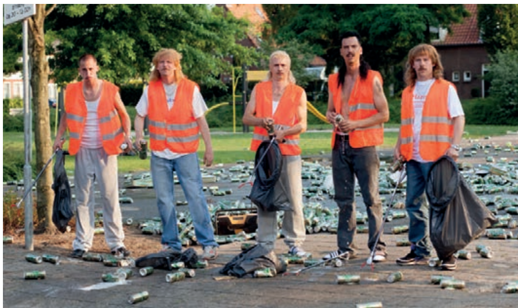
Plate 9. NEW KIDS TURBO