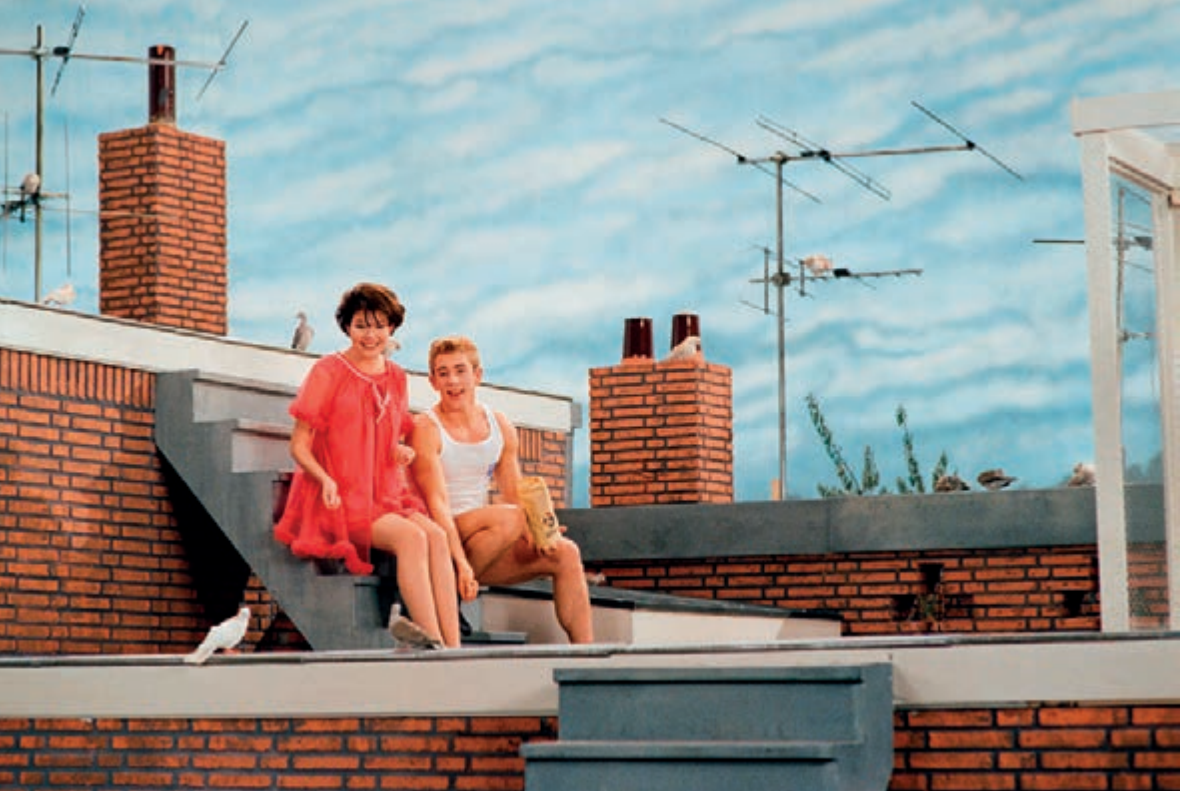
Plate 12. JA ZUSTER, NEE ZUSTER