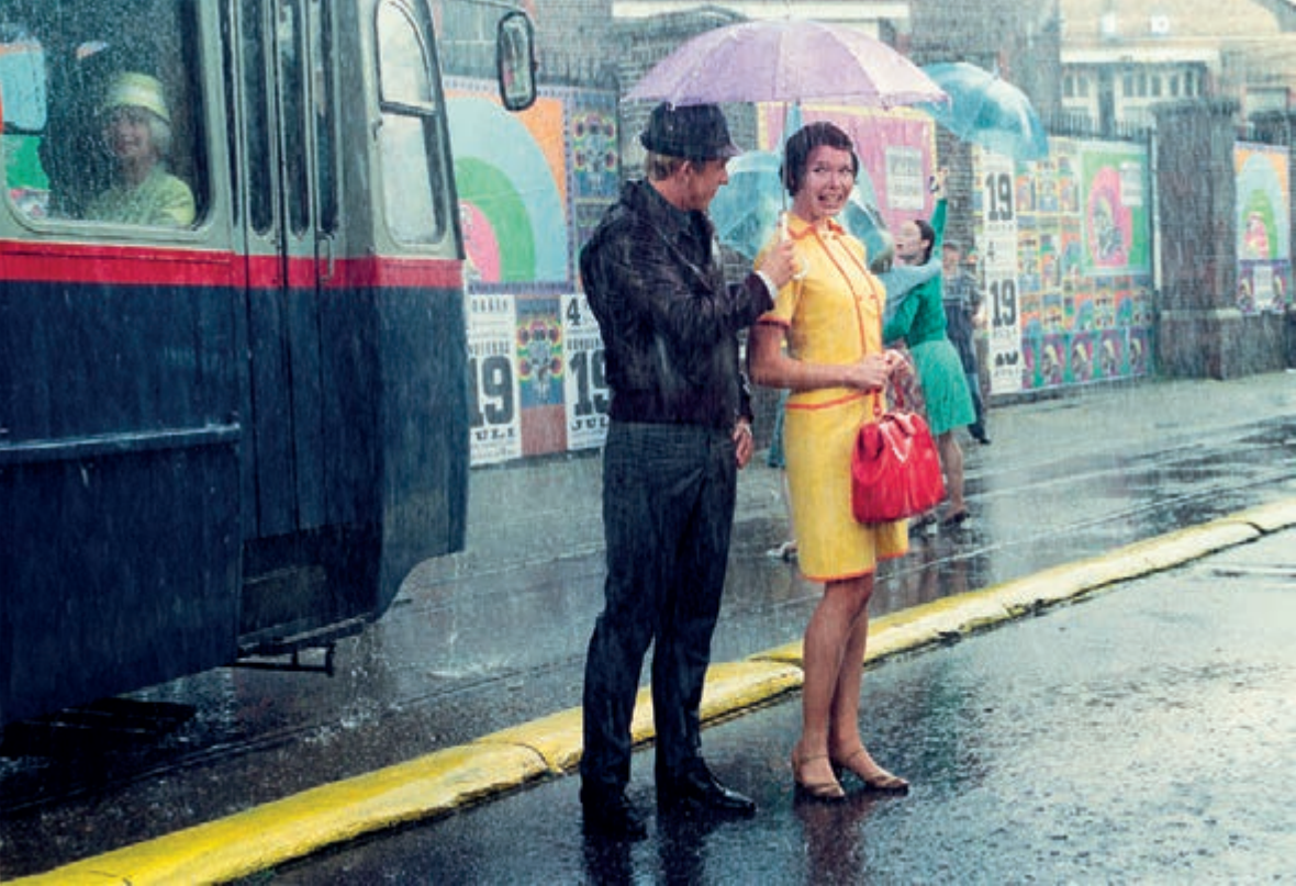
Plate 26. JA ZUSTER, NEE ZUSTER