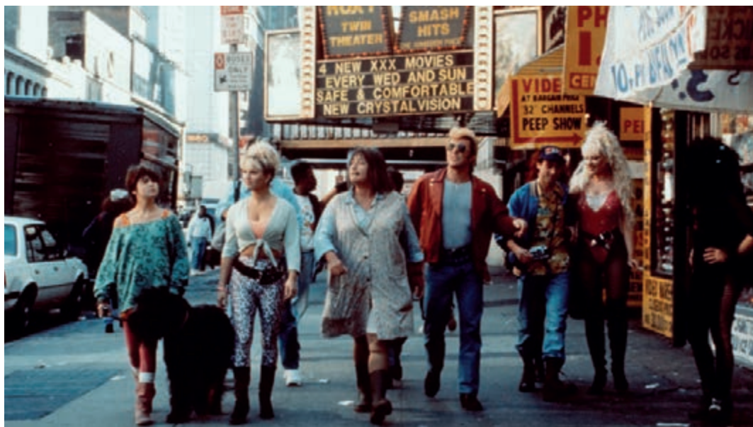
Plate 8. FLODDER IN AMERIKA!