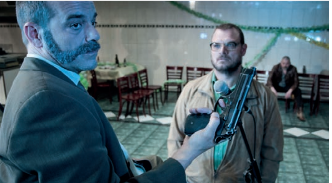
Plate 17. DE WEDEROPSTANDING VAN EEN KLOOTZAK