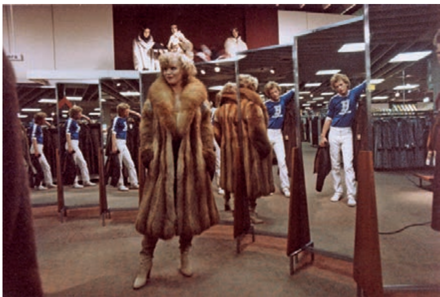
Plate 28. SPETTERS