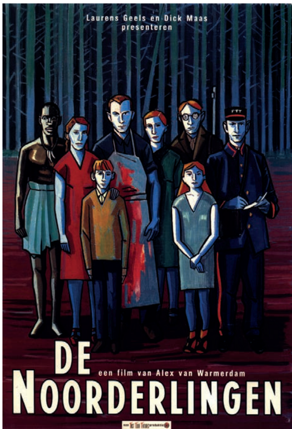
Plate 7. DE NOORDERLINGEN