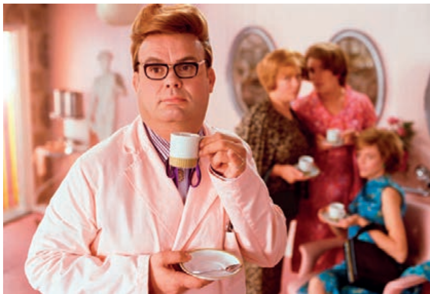
Plate 27. JA ZUSTER, NEE ZUSTER