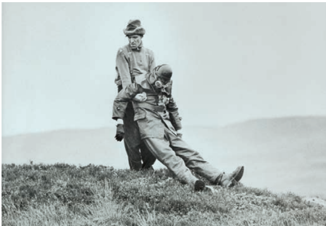
Plate 3. DE WISSELWACHTER