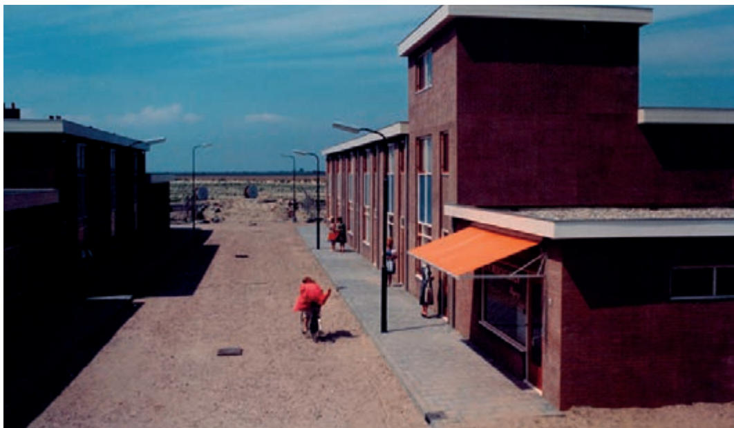
Plate 6. DE NOORDERLINGEN