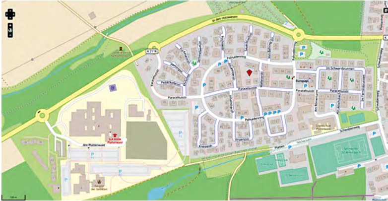
Figure 42: Overview map of Plattenwald in Open Street Map.

OpenStreetMap data is available under the Open Database Licence: openstreetmap.org/copyright .