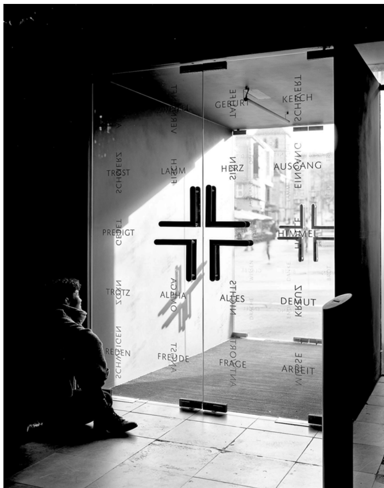
Figure 40: raumschiff.ruhr, Essen, view from the church.