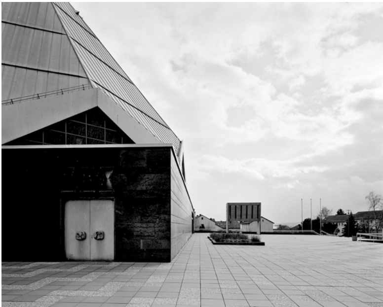
Figure 33: St. Paulus, outside view.

The building design which won the architectural competition was a modern plan in form of a square base with an octagonal roof that resembled a tent. The architect Herbert Rimpl, a well-known architect in the post-war 10 period, placed the structure on a plateau overlooking the district with the octagonal