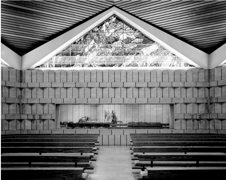
Figure 34: St. Paulus, inside view.

itself in the Catholic tradition, in this case through the material that connects St. Paul with the churches of Rome. At the same time, the folded stone cladding changes the acoustic properties of the interior. Together with the pinewood ceiling it minimises reflections and optimises the audibility of speech and music. According to Michael Will, who regularly worships in the church, the atmosphere of St. Paul is subtly different from other churches: There is a “warm harmony between speech and music. It just feels more homely” *12 (MF 2020).