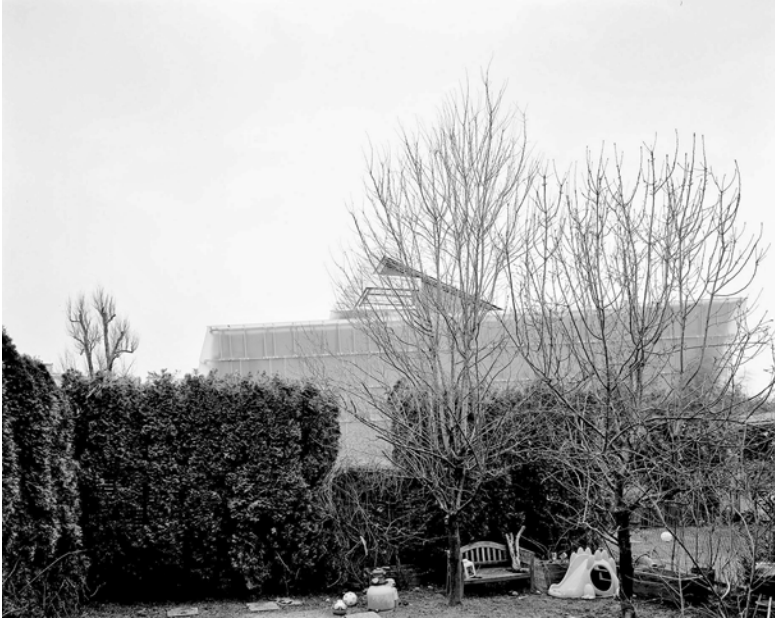
Figure 31: St. Albrecht in Rif, outside view from a neighbour's garden.

Figure 31 shows the church from a neighbour's garden. While the roofline is clearly visible from behind the trees, the glass façade of the building makes it blend in with the sky, reducing the visual impact. This is important for the church as a part of the neighbourhood. During the planning process the architect and the planning committee held one of their meetings in a garden adjacent to the planned site to demonstrate their sensitiveness to the demands of the neighbours. The translucent material of the building and its specific shape – as well as its height which was kept well below the allowed dimensions – highlight the importance of architecture that respects its surroundings.