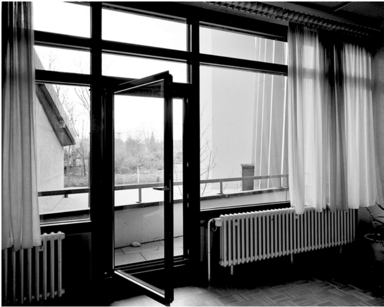
Figure 38: St. Maria, Ditzingen, meeting room.

works well internally, with many groups and many committees, but there is already a discrepancy between the community, which in itself functions well, and the city and its life realities, as my interview partner mentions.