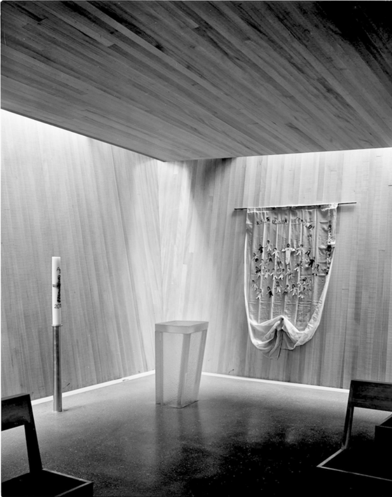
Figure 32: St. Albrecht in Rif, inside view.

From that perspective it is important to notice that despite the architect's intention the church's users have appropriated the building. Also visible in the picture is a small tapestry made by a group of children preparing for their First Communion.