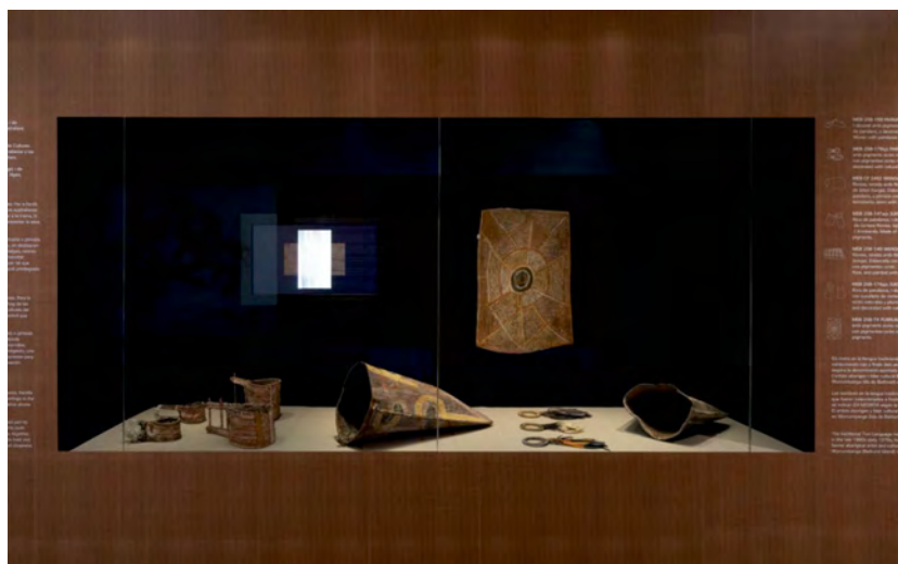
Fig. 5: Exhibition display case. Inside are the two tungas from the museum’s collection. MEB 258–140, MEB CF 2453, alongside other Tiwi objects.