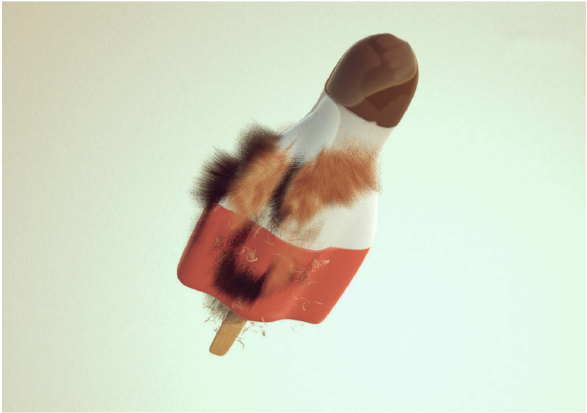
Figure 2: Popsicle with hair growth.