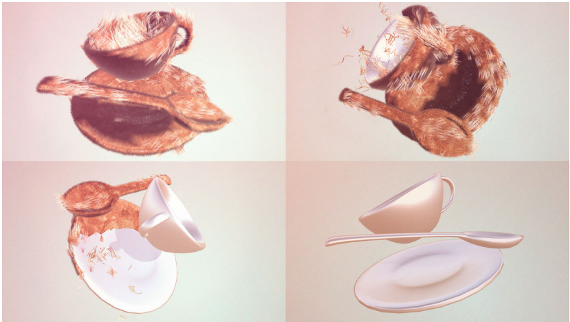
Figure 1: Shaving a tea cup in the game as homage to Meret Oppenheim (1936).

formed from archetypes, cultural-historical clichés and stereotypical themes that can be easily read and understood by the player. Content in which we can predict what kind of experience will await us is appealing, and many Triple-A computer games operate according to this lowest common denominator. For comparison, imagine a visit to a fast food restaurant which promises us a predictable and consistent experience. By contrast, an experimental food choice, such as molecular cuisine, offers new flavors and taste combinations – with the high risk that it may not be for everyone. And you probably won't order the same food twice. The motivation for visiting an experimental kitchen is not pure pleasure, but entertainment, which also contains an element of surprise and curiosity for the new and unexpected.