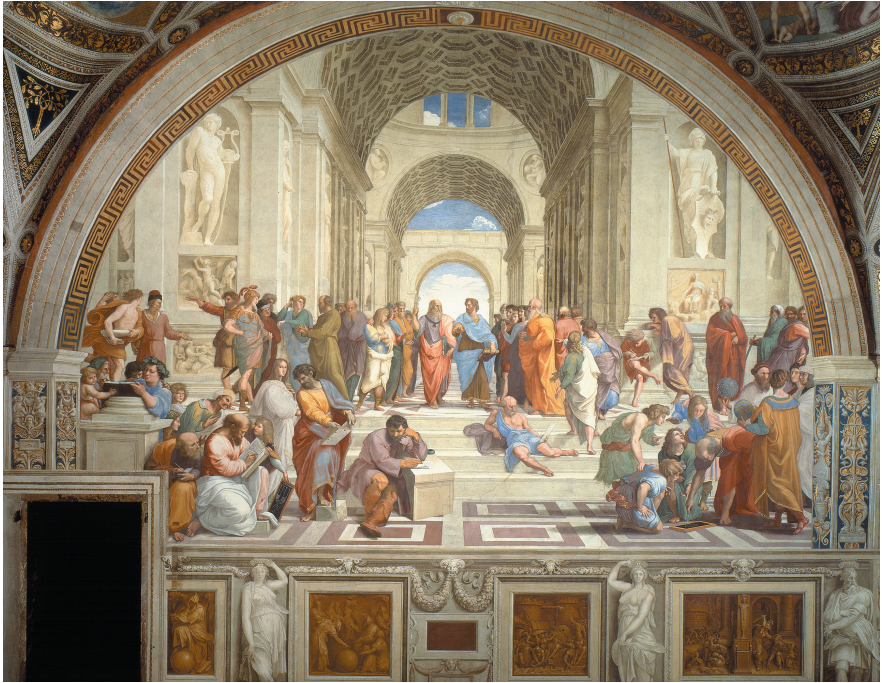
Image 1: The School of Athens (1509–1511). Fresco, 550 x 770 cm (18 x 25 ft). Raphael Rooms, Apostolic Palace, Vatican City. https://commons.wikimedia.org/wiki/File:%22The_School_of_Athens%22_by_Raffaello_Sanzio_da_Urbino.jpg .