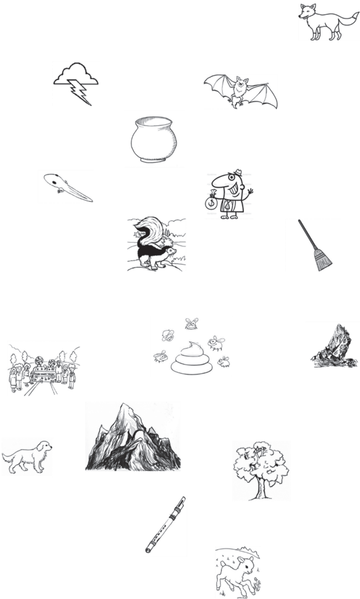
Figure 188: Maptask map without the path as used by TP03 in TP03 & KP04_MT_Q.