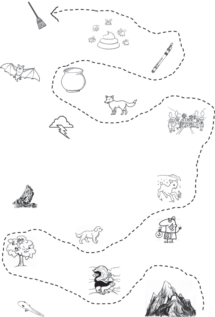
Figure 191: Maptask map with the path as used by as used by ZR29, SO39, TP03, and SG15 in ZR29 & HA30_MT_ES, SO39 & MD40_MT_ES, TP03 & KP04_MT_ES, and SG15 & QF16_MT_ES.