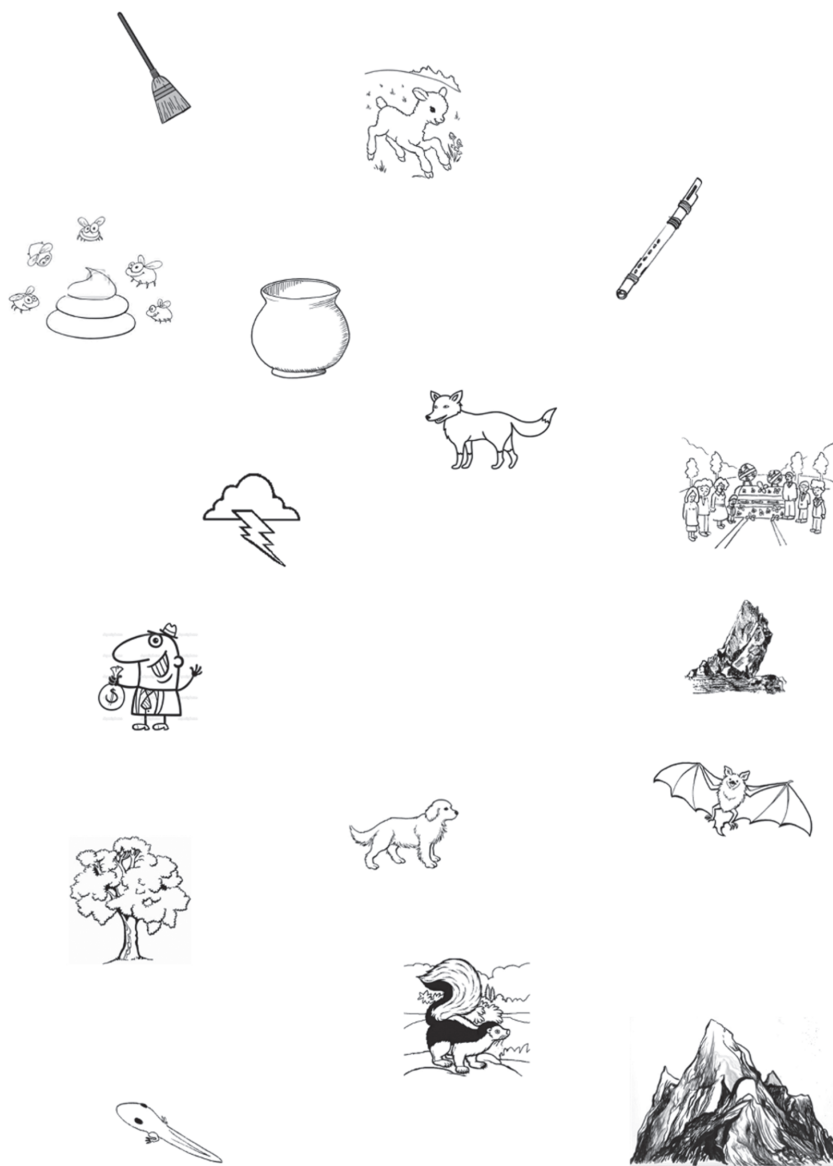
Figure 190: Maptask map without the path as used by HA30, MD40, KP04, and QF16 in ZR29 & HA30_MT_ES, SO39 & MD40_MT_ES, TP03 & KP04_MT_ES, and SG15 & QF16_MT_ES.