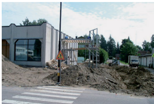
Fig. 4: The biggest external structural change: the main entrance relocated to a safer location in the side street.

A new door was provided in the main library area to provide a fire exit and easy access to the basement. A separate staff entrance was created. The storage rooms of the grocery store were converted into staff work areas. Numerous new windows were needed as the former large grocery store windows covered only one wall facing the street. The side and the back walls had no windows. The new windows dramatically changed the appearance of the building, making it lighter and more approachable.