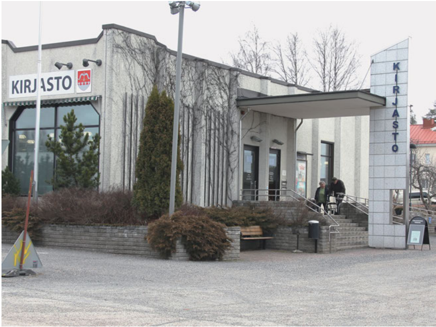
Fig. 1: The Joutsa Public Library moved into a renovated former grocery store from the late 1970s.