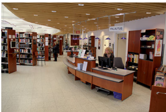
Fig. 6: The main desk area is indicated by a beautiful ceiling.

The floor plan gives a clear picture of the functions and the room arrangements (Figure 3). Although the main space is large at 315 m 2 and has no partitions, the different functions are separated in an innovative way. The shelves are grouped in different zones for adult fiction and non-fiction areas and the main desk area is indicated by a beautiful ceiling finish that gives the interior architectural character (Figure 6).