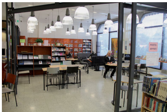
Fig. 5: Newspaper reading room with dark shelving providing warmth in the bright interior.

The original street-facing large windows made the interior light and it was possible to install dark shelves which created a warm atmosphere in the large space (Figures 5 and 6). The windows were problematic. Surprisingly, the existing air-conditioning system was not included in the purchase deal and was removed before selling the building to the municipality. The canvas awnings were too small to give the necessary protection against the summer sun and heat, and venetian blinds covering the whole window area were needed. The blinds do not provide the best solution in terms of design and appearance but a better one has not yet been found. It took a couple of years before the new cooling system was installed.