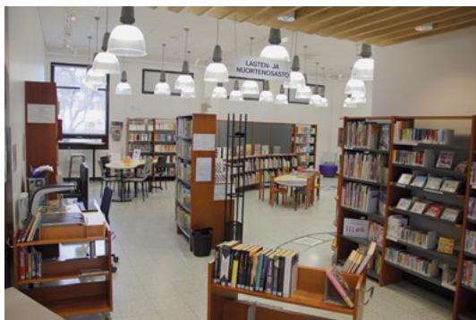
Fig. 7: Children's and young adults' department has different furnishings from elsewhere in the library.

As well as the larger floor space, the bookshelves and the books have more space. The collection can be displayed in a much better way which matters a lot to the customers. Being able to present books by placing them in a front-facing position showing the covers entices the customers to borrow more. There is also more space for computers which has resulted in increased use. Cosy reading corners and comfortable surroundings ensure that customers enjoy visiting the library and stay longer. Many services are still unknown to the wider public. One elderly lady, after an introductory visit to the library with her group, said: "I feel like Alice in Wonderland!"