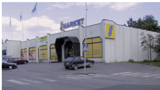
Fig. 2: The former grocery store built in 1978.

Planning the new library was a process that commenced in 1995 and took several years as there were many options to be considered. One possibility was to renovate the old library; another concerned the renovation of a larger building; a third alternative was to build a new cultural and sports centre beside the school. The old library was too small for its renovation to be a seriously considered option and the decision to construct a new building was taken by the majority of members of the municipal council. The ground was bought, an architectural competition organised, and the winning plan chosen. The new municipal council, however, overruled the decision and put the plan on hold. It was thought to be too expensive and the location of the library distant from the municipal centre. The customers meanwhile petitioned the decision makers to locate the library in the centre of Joutsa and the final political decision was to reuse the former grocery store (Figure 2). The location was perfect. An additional advantage was that the building gained a new lease of life. The demise of village centres and even those of smaller towns is an increasing problem worldwide in the 21 st century as populations change and services decrease.