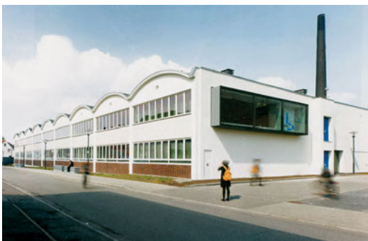
Fig. 7: Readers' bay window as a panoramic window.

The five voids cut out of the Tonnenhalle do not point to the past like the thirteen holes, dug into the sand of the death strip of SubBerlin. They clearly and consciously point to the future and have clearly defined functions. The ceiling opening brings light and air into the building; the panoramic window looking out to the Swabian Alps lends distance to the view (Figure 7); the smaller bay window offers a more focused, telescopic view.