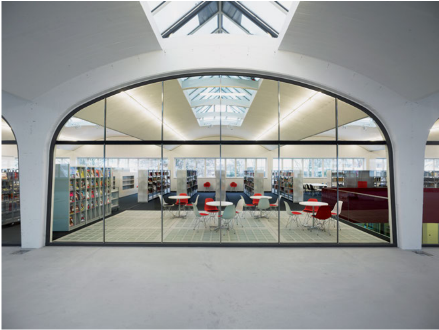
Fig. 14: The library: the fitted glass walls allow a functional division of the old production hall without destroying the spatial context.