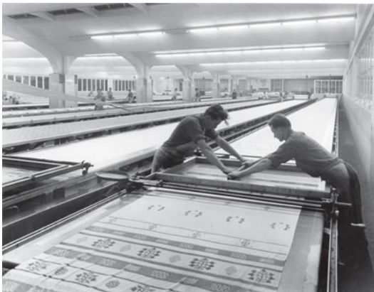
Fig. 4: Workers printing fabrics in the old factory hall.

The way in which their Pausa was destroyed remained in the collective memory of the people of Mössingen. Jewish history and the rebellion against Hitler marked by the Deutsche Kommunistische Partei (DKP)/German Communist Party flag on the chimney of the Pausa, were collectively suppressed. After the closure of Pausa in 2004, the original deep connection, and perhaps also the love/hate relationship of the community towards its company, were followed by great bitterness and disappointment, which almost led to the demolition and extinction of the listed historic complex.