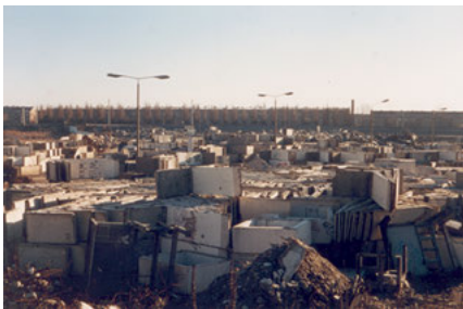
Fig. 2: Wall-graveyard in Berlin-Pankow, January 1991.

In Berlin, in 1990, most inhabitants wanted to bury the history of the Deutsche Demokratische Republik/German Democratic Republic (GDR) commonly known as East Germany, and in particular the so-called Todesstreifen/death strip which had divided the city in two. The border between the GDR and the Bundesrepublik Deutschland/Federal Republic of Germany (FDR) commonly known as West Germany, in place between 1949 and 1990 took various forms. Until 1956, the GDR officially designated the border as a demarcation line, then a border and from 1964 a state border; it was also called a death strip. Rather than a critical or conceptual debate about urban design, the overriding imperative after 1990 seemed to be the erasing of history and memory as quickly as possible. Indeed, the Berlin Wall was gone in an amazingly short time and reduced to rubble (Figures 2 and 3)!