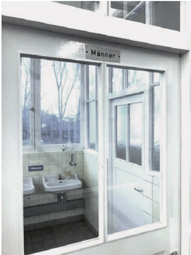
Fig. 15: The most striking and frequently used heritage feature serves today as toilet.

history. The library retains memorabilia from the old Pausa building with display cases containing fabric samples and pictures integrated into the counter and information desk. The most striking and frequently used heritage feature is the toilet, which has been faithfully preserved (Figure 15).