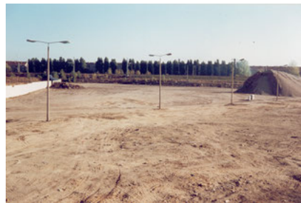
Fig. 3: Wall-graveyard in Berlin-Pankow, July 1991.