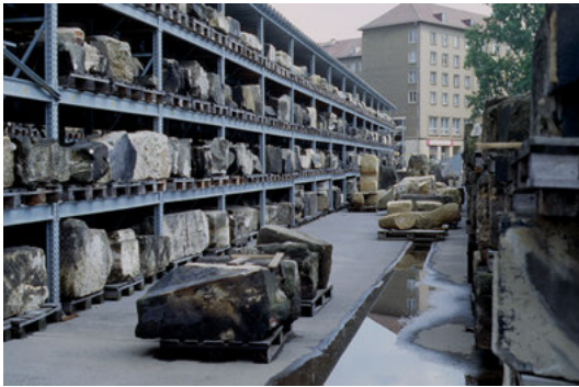
Fig. 5: Structural fragments stored in front of the ruins of the Frauenkirche in Dresden.

The old stones, blackened by the devastating fire, stand out in the rebuilt façade and serve as physical and conceptual reminders of the past. With the passing of time, the variation in patina will disappear, as perhaps will the trauma of loss. Dresden has successfully embraced the concept of trauma recovery, remaking the city and rebuilding community in a convincing, urbanistic and architectural way.