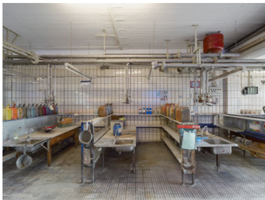
Fig. 13: The abandoned original dyeing room.

From rough surfaces, historical structures and materials to ancient remnants of past activity, old paint spots, amusing legacies of the workers (Figure 12) and time clocks, all the way to a whole production unit, the Farbküche/dyeing room (Figure 13), much could be kept as it was. Even with all the modern requirements of technology and users, history still lives in the building. The evidence of past use, much of it apparently archaic today, occupies its proper place and tells the young and future generations about the production processes in the old Pausa complex.