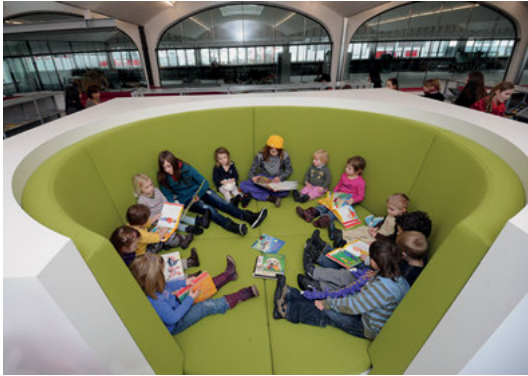
Fig. 16: An island for the children.

The former Pausa building is incredibly special. The high ceilings, the numerous windows and the fact that it is a single-storey building provide a very pleasant workplace and the interplay of modern furniture and old factory elements gives the library its very own charm (Figures 14 and 16). Accessibility and openness are highly valued by visitors and users with disabilities have easy access.