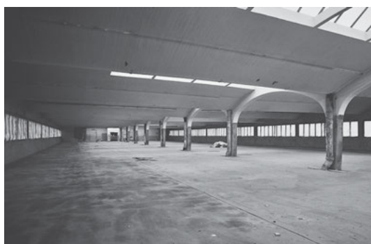
Fig. 6: The upper floor before reconstruction.

The aim of my work has always been to expose the many facets and layers of a city and of its buildings to ensure they speak to and connect with current and future generations who will identify with the specific aura of the place. Cities around the world are changing rapidly and becoming ever more indistinguishable. I would argue, perhaps a little controversially, that beneath the ubiquitous shopping malls, the unique stories, evidence and memories of the past lie buried, unheralded, unidentified and unknown.