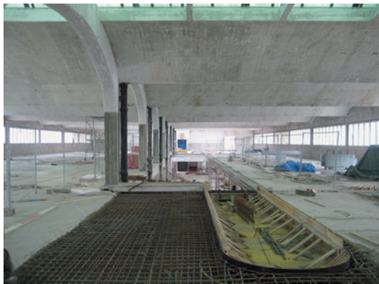
Fig. 8: The central element of the reconstruction work is a cut through the concrete ceiling.