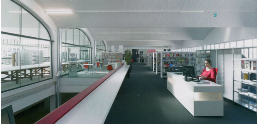
Fig. 1: The high ceilings, the many windows and the barrel-vaulted structure of the Mössingen library offer a very pleasant workplace.

used as a runway for races between children! The library is a place where people meet, learn together, exchange ideas and spend time.