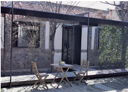
Fig. 7: Leisure space.

The west wing is an open dining area and coffee shop with a broad window ledge where people can sit, relax and enjoy views over the courtyard (Figure 7). The east wing is designed as an exclusive space for art exhibitions where local and international artists are invited, from time to time, to exhibit their artworks to the community.