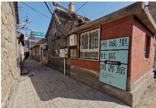
Fig. 2: The guiding sign to the library in the historic hutong style district.

During the reign of Shunzhi (1644–1661) in the Qing Dynasty (1636–1912), the defence garrison became a civilian city at the end of the war and the population increased accordingly. The most famous residents were the Zhang, An and Liu clans. Although economic and social change over many years created a modern urban landscape, the Suochengli District retained a relatively complete northern hutong/laneway style (Figure 2) with traditional siheyuan/courtyard compounds lining both sides.