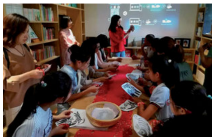
Fig. 8: Papercutting.

on local traditional skills like paper cutting and shadow play (Figures 8 and 9). The audience can participate and experience the techniques for themselves. A series of popular and influential lectures has been held giving the residents, especially children, a better understanding of their community and city and awakening their cultural spirit.