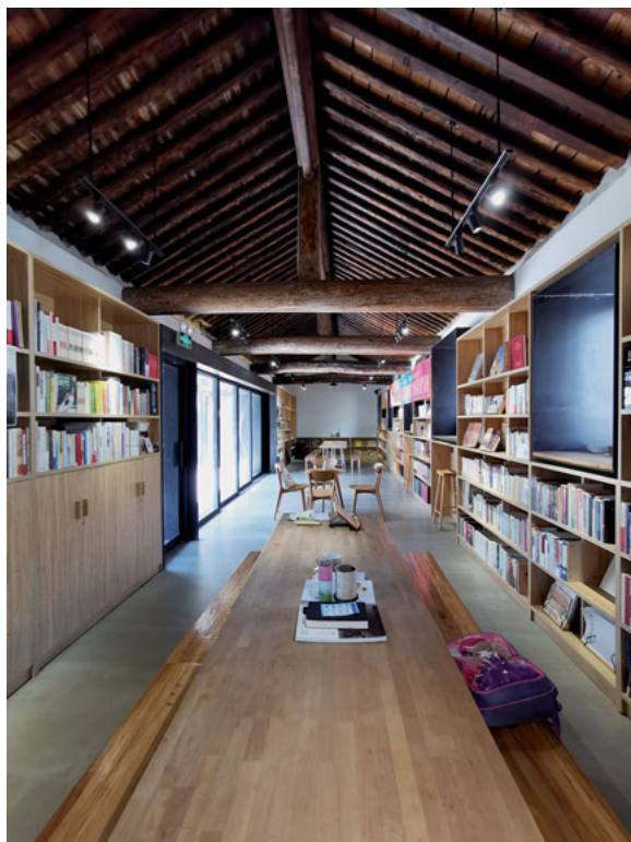
Fig. 1: Reading room of the Suochengli Neighbourhood Library.