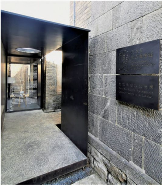
Fig. 5: The entrance to the library.