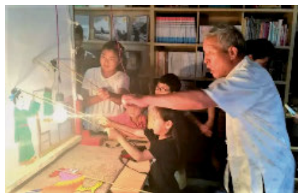
Fig. 9: Shadow play.