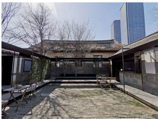
Fig. 4: The contrast between the library and the surrounding modern buildings.

The architects for the Suochengli Neighbourhood Library were the well-known practice, Vector Architects, with the work led by Principal Architect Dong Gong ( http://www.vectorarchitects.com/en/projects/39 ). Dong Gong ( https://www.archilovers.com/gong-dong/ ) studied architecture at Tsinghua University in Beijing and the University of Illinois. His work has been exhibited at the Biennale-