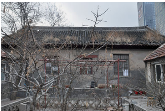
Fig. 3: Inside the courtyard before the renovation.

The Suochengli Neighbourhood Library is part of the Kwan-Yen Project, an urban renewal plan supported by the Yantai city government, focusing on Yantai's past, its specialist location and culture including its history, archaeology and folk traditions (Ling 2017). The project name comes from Guangren Road, which was formerly known as Kwan-Yen Road, the first street of Yantai Port constructed in the second half of the 19 th century. On both sides of the road, parallel to the coastline, more than 40 historical colonial buildings covering a period of over one hundred years were constructed. As the city changed, most of the colonial buildings were rented and operated as high-end clubs, restaurants and bars. Most of the tourists and residents who came to the seaside seldom stayed in the area. The use of the colonial buildings declined, and many fell into disrepair (Figure 3). The government decided to commence urban renewal and commercial revitalisation and invited architects, designers, artists and other groups to bring life and activity to the historical area. The Kwan-Yen Project respects the complexity of the old district and the concept of civil society, paying attention to the importance of maintaining traditional street life and local culture, emphasising interpersonal interaction and integration into the community, and opposing plans to demolish the old road and historic district for redevelopment.