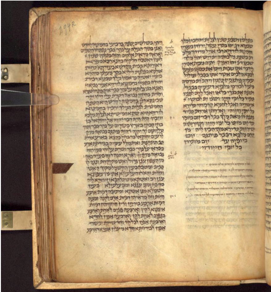
Fig. 1: Badische Landesbibliothek Karlsruhe, Cod. Reuchlin 3, Prophets, fol. 294r, beginning of Ezekiel.

The same largely holds true for biblical commentaries: Reuchlin's library contained four such manuscripts in addition to four printed volumes. With the exception of one manuscript containing David Qimḥi's commentary on Isaiah, which was bound together with another manuscript of Yehuda ha-Levi's philosophical work Sefer ha-Kuzari , was removed from the collection and is now found in the State Library of Württemberg in Stuttgart (Stuttgart, Cod. or. 20 2), all of these items survived and remained in place until World War II. Only two biblical commentaries which were quoted by Reuchlin and may therefore have been in his