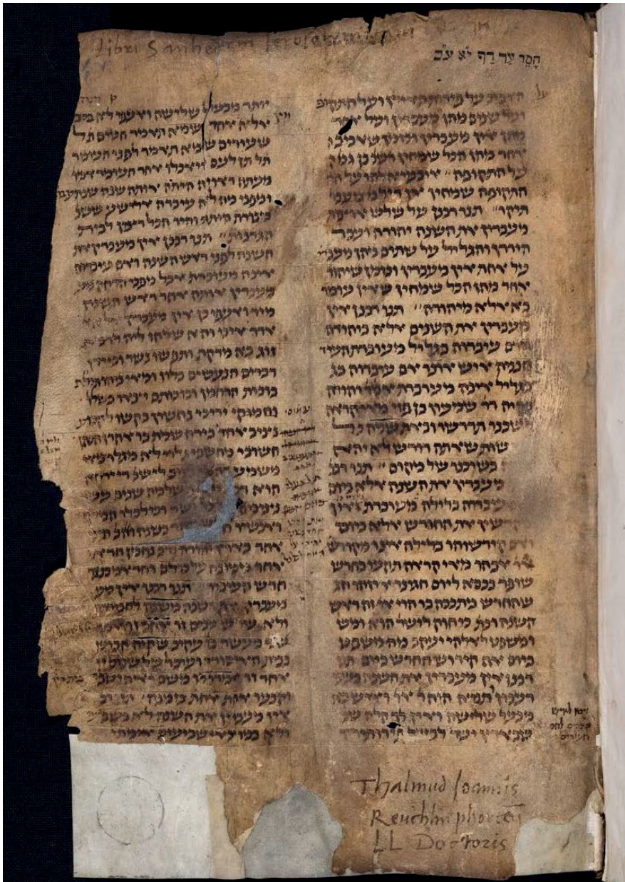
Fig. 3: Badische Landesbibliothek Karlsruhe, Cod. Reuchlin 2, Talmud, Sanhedrin , fol. 1r, with two notes by Reuchlin, above: 'Libri Sanhedrin Jerosolymitani'; below: 'Thalmud Ioannis Reuchlin Phorcei LL. Doctoris'. © Badische Landesbibliothek Karlsruhe (urn:nbn:de:bsz:31-46200).