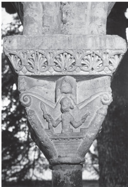
Fig. 10: Moissac (France), cloister abbey, Holy City capital, detail © J. Michaud, CESCO/CIFM.

The main part of the capital presents the image of a walled city located under a foliate frieze on the abacus, along with a blank tailloir . We can see that the artist has sculpted the bulwarks, high towers and monumental gates with care. The city walls are topped with a series of human figures, perhaps soldiers, defending the town. 20 On the long sides of the capital, these figures point their right arms towards the door of the abbey church on the opposite wall, indicating with their fingers the south gallery of the cloister and inviting the viewer to look beyond the capital (all the bodily movements create a dynamic towards the church wall— from the city wall on the capital towards the church wall in the cloister ). All around the bulwark (fig. 10) one can read the inscription sancta Iherusalem or Iherusalem sancta (depending on the point at which the reader begins). The city on the capital is not just a town but the town, the Holy City described in the Bible, 21 both in the Old Testament (as the historical place of God's people) and in the Book of Revelation (as the promise of God's realm). The