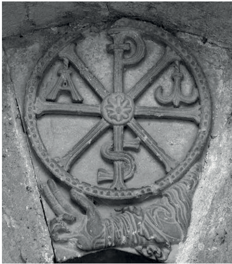
Fig. 16: Irache (Spain), Santa María la Real abbey, church doors.

The three doors of the church are stamped with a chrismon: the west door, opening to the outside; the north one, facing the Camino de Santiago and giving access to the pilgrims; and the south one, opening onto the cloister and reserved for the monastic community. With a lasting representation of the crosses traced with Holy Oil during the liturgical ceremony of consecration, Irache's chrismated doors can be considered