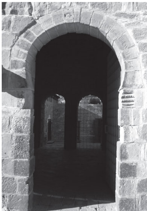
Fig. 3: San Juan de la Peña (Spain), monastery, cloister door © CЕСSM/CIFM.