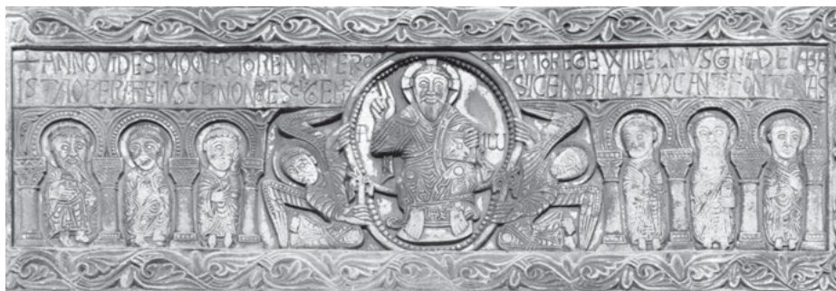
Fig. 4: Saint-Genis-des-Fontaines (France), lintel of the church door © J. Michaud, CЕСSM/CIFM.