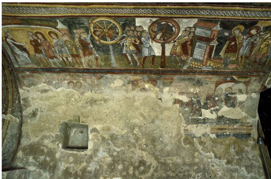
Fig. 18: Saint-Savin-sur-Gartempe (France), abbey church, wall painting in the crypt © Vincent Debiais.