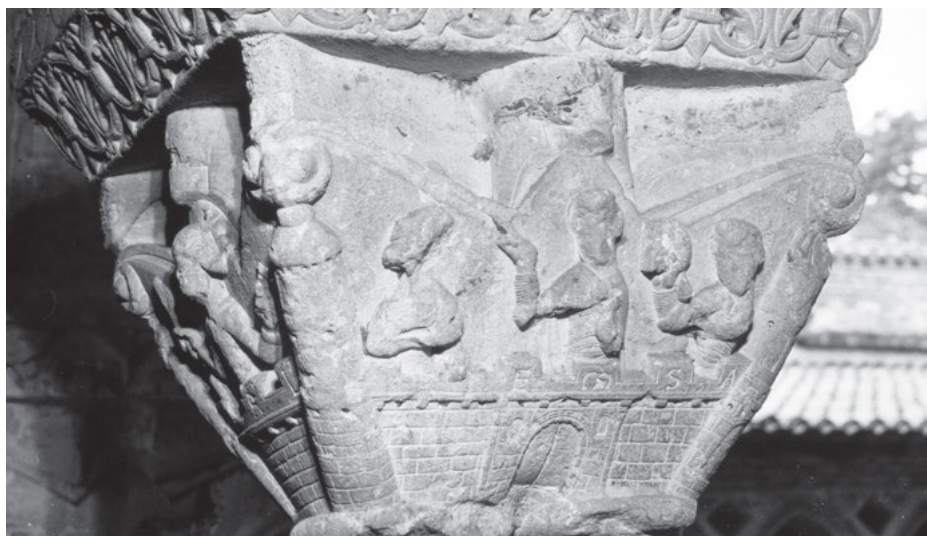
Fig. 17: Moissac (France), cloister abbey, Holy City capital, detail © J. Michaud, CESC/CIFM.

Paradoxically, inscriptions in doorways invite the reader to stop; to suspend the movement induced by crossing the doorway. The content of epigraphic texts relies on the social, liturgical and broadly symbolic implications of changes in space to transform the suspension of the reader's movement into a dramatic understanding of the precise features of the space he is entering. On the Moissac capital, narrative tension is concentrated at three points: on the gates to Jerusalem; on the long sides of the basket where the character sculpted behind the walls points to the city's door; and on the door that provides access to the church (fig. 17).