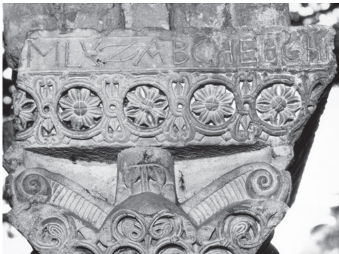
Fig. 12: Moissac (France), cloister abbey, alphabetical capital

movement from the outside inward: both the act of reading and the poetic content lead the viewer's eyes and mind into the heart of the visual construction.