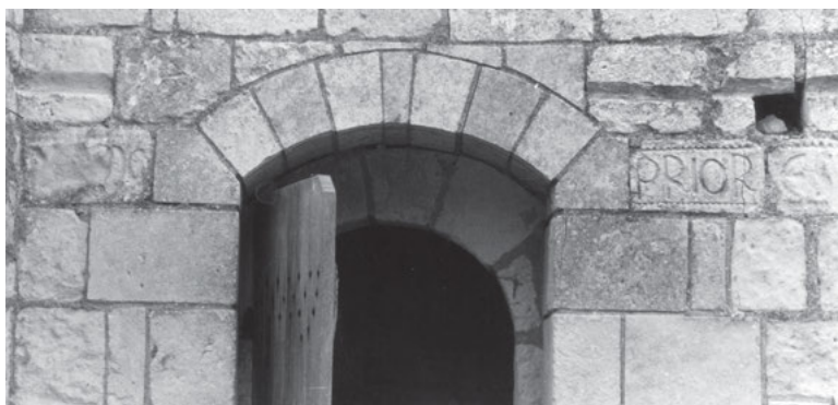
Fig. 6: Chênehutte-Trèves-Cunault (France), St Macé priory © J. Michaud, CESC/CIFM.