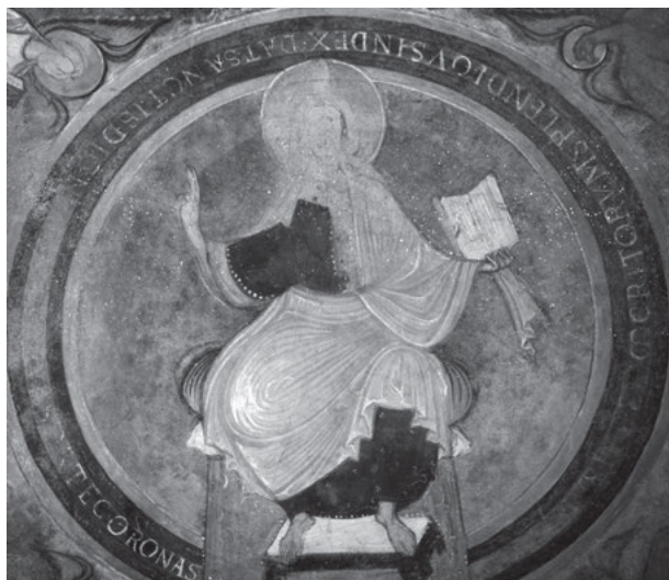
Fig. 14: Saint-Savin-sur-Gartempe (France), abbey church, vault of the crypt.