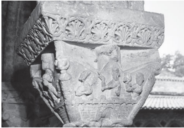
Fig. 9: Moissac (France), cloister abbey, Holy City capital © J. Michaud, CESC/M/CIFM.