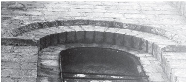
Fig. 5: Chauvigny (France), church, east window of the south wall © J. Michaud, CESC/CIFM.