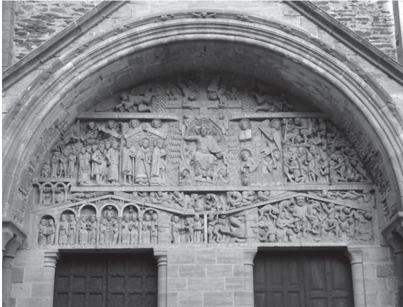
Fig. 2: Conques (France), Sainte-Foy abbey, western portal of the church © Vincent Debais.

passage that allows to enter spaces that lack a door or open those defined by their separate and inaccessible nature.