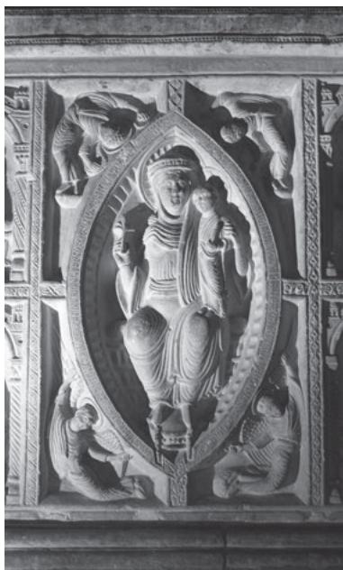
Fig. 13: Saint-Junien (France), church, Saint Junien's sarcophagus © Manon Durier.