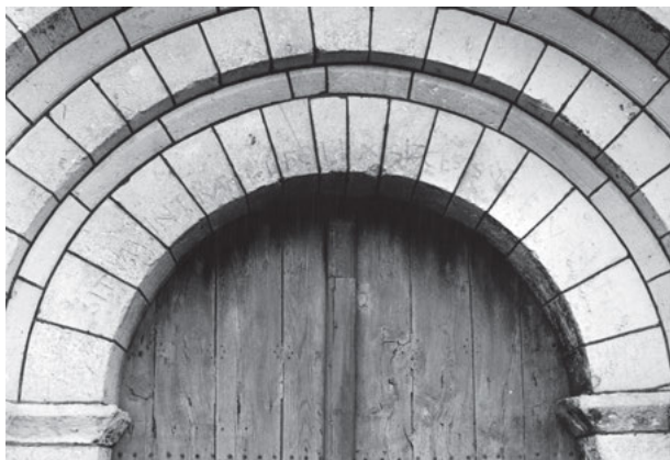
Fig. 7: Saint-Léger-en-Pons (France), church door