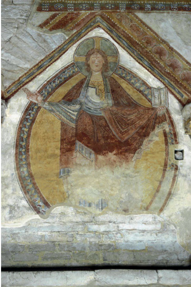
Fig. 19: Poitiers (France), St John Baptistery, central room © CESC/M/CIFM.

only aspirations. Because Jesus is Verbum Dei , this medieval graphic phenomenon plays on the deliberate ambiguity between the hyper-materiality of the written shapes and the absolute transcendence of its contents.