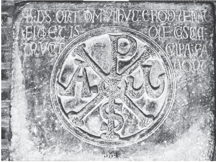
Fig. 15: Toulouse (France), Musée des Augustins, chrismon from Hospitalliers church