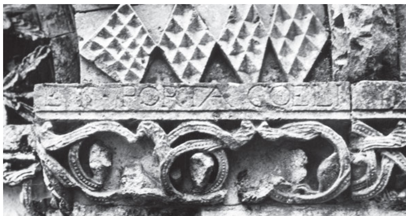
Fig. 1b: Saint-Pierre-de-l'Isle (France), western portal of the church © J. Michaud, CESC/CIFM.

As they often are iconic documents of medieval epigraphy—the monumental inscription of the portal of Saint Foy church in Conques 5 is published in all the catalogues dealing with Romanesque sculpture in France (fig. 2)—these inscriptions have been studied repeatedly by medievalists. 6 Nonetheless, as can be deduced from their titles, these works deal mainly with the content of the inscriptions and the symbolic, theological or iconographic implications of their location at the doors of churches. Such a lexical approach is essential and leads to a better understanding of how medieval inscriptions were composed according to their function. However, it tends to consider doorways and epigraphic writing as separate elements whose presence within a shared ‘writing space’ and ‘reading moment’ is either fortuitous or insignificant to the form and meaning of the architectural structures. 7