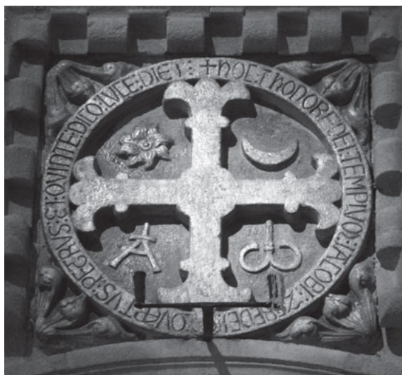
Fig. 11: Santiago de Compostela (Spain), cathedral, consecration cross © CESC/CIFM.

complex alphabetical composition combining two letters, and ends with a few words from Ps 54.3: Deus in nomine . In this scale representation of the capital, the Latin alphabet surrounds nature as if it has been shaped in stone. Christian exegesis of the alphabet associates the layout and number of letters with knowledge and creation. 31 The inscription in Moissac could be interpreted as follows: writing delimits and contains the sculpted shapes both in material and analogical terms.