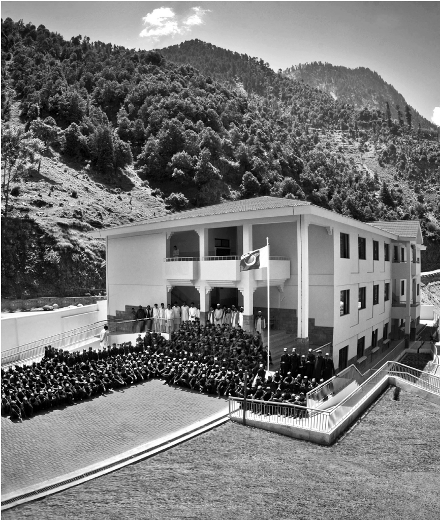
Figure 1.2. Mohandri School. At this location, the earthquake dislodged boulders, which rolled down the nearby steep mountain slope, smashing into the school, taking several lives. Here, students and teachers pose in front of their new school constructed by the PERRP project. Government Boys' Primary and Secondary Schools, Mohandri village, Khaghan Valley, KP. See anecdote in Chapter 6: "Mohandri School, Mountainside Boulders." 2011.

At Muzaffarabad, AJ&K's Prime Minister Sikander Hayat Khan (2005) explained the tragic scene to gathered international media representatives: "For the first two days we have been either digging in the ground to recover bodies or digging to bury them. I have become premier of a graveyard."