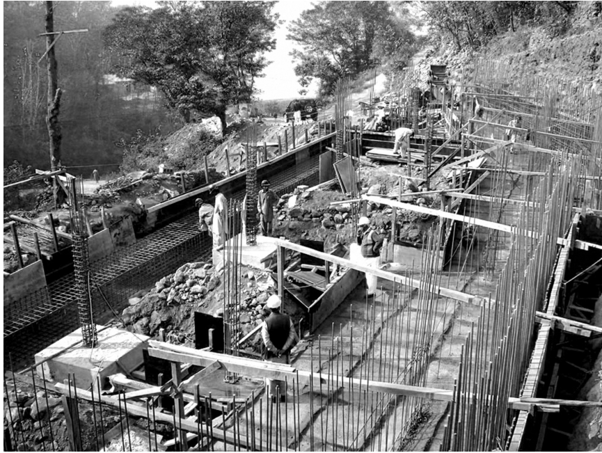
Figure 1.3. Reconstruction in Mountainous Areas. Most of the reconstruction in this project was in mountainous areas on small plots of land, such as this AJ&K location. Here, construction work underway was being inspected. Government Girls' Middle School Kahna Mohri. 2007.