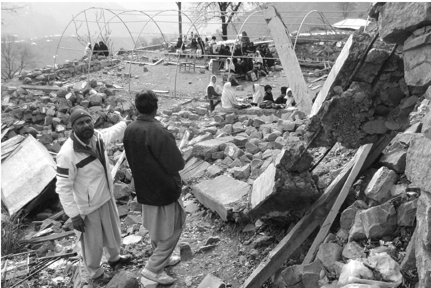
Figure 1.1. A Collapsed School. A community member indicates how, in the earthquake, the Government Girls' High School Kheral Abbasian collapsed. Students continued attending class in the rubble. 2010.

Much of the quake area is of similar typography, covered with mountains on the southern edge of the Himalayas. Few roads exist, and those that do are narrow, barely wide enough for two vehicles to pass when they meet. These roads were treacherous even before the quake. The only way for most inhabitants to get to markets or seek services of any kind has always been through long walks on footpaths, up and over the mountains, through riverbeds and across narrow wood-and-rope suspension bridges. In this part of Pakistan, it is not uncommon for children to have to walk