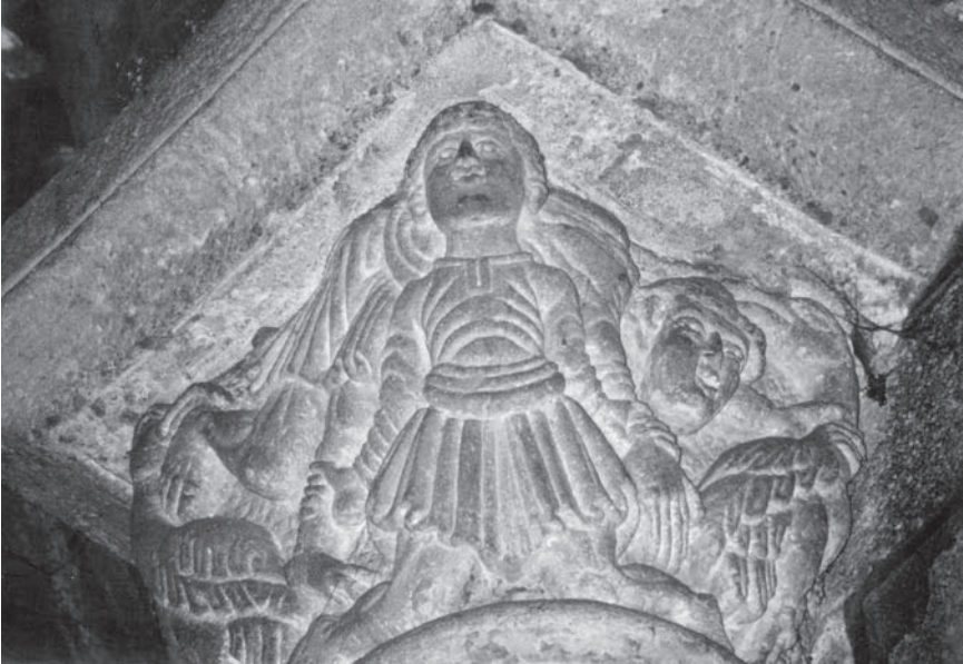
Figure 7. Notre-Dame-du-Port, Clermont-Ferrand (Auvergne), capital of about 1100 apparently recalling Ganymede story.