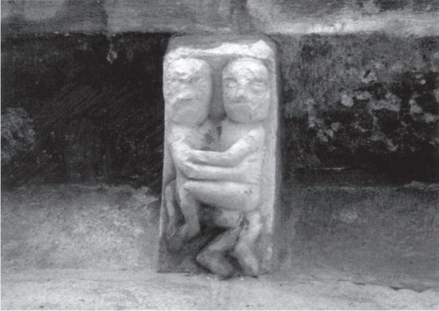
Figure 29. Santa María (Marína) de Yermo (Cantabria), twelfth-century portrayal of seated intercourse, faces in grimaces.