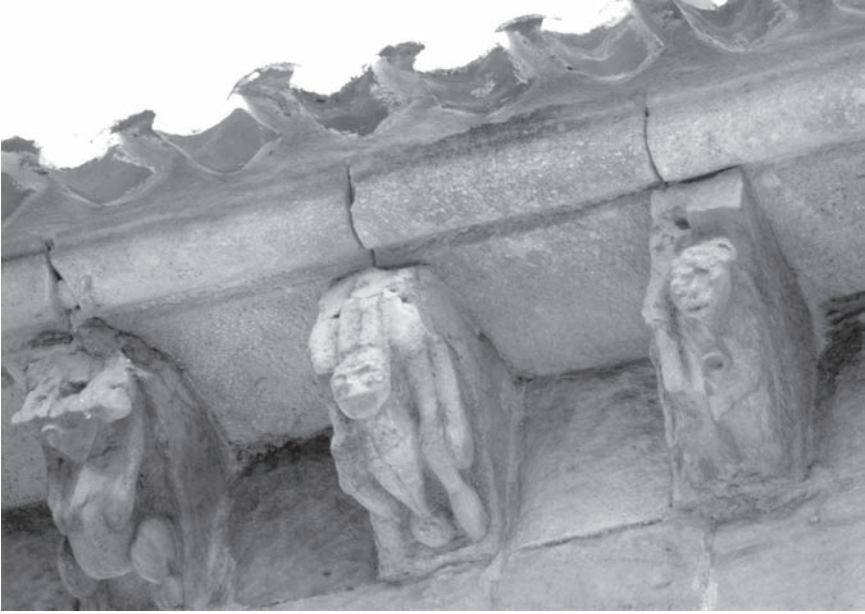
Figure 42. San Cipriano, Bolmir (Cantabria), man (canecillo in center) in coitus with a bird (?), twelfth century.