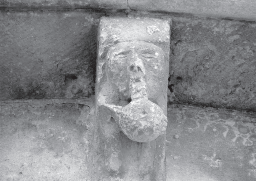
Figure 40. Barahona de Fresno (Segovia), auto-fellatio.