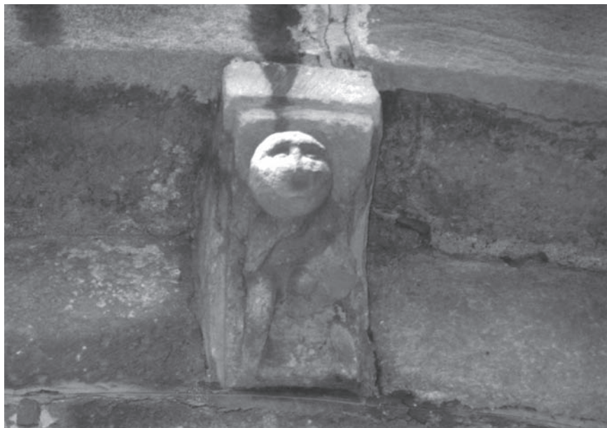
Figure 45. Santos Cosme y Damián, Bárcena de Pie de Concha (Cantabria), possible twelfth-century portrayal of man choking himself with his right hand as he masturbates with his left.