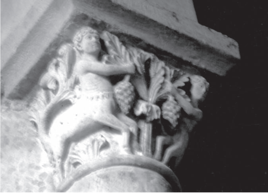
Figure 12. Mozat (Mozac), near Clermont-Ferrand (Auvergne), nave capital with centaur, of about 1080.