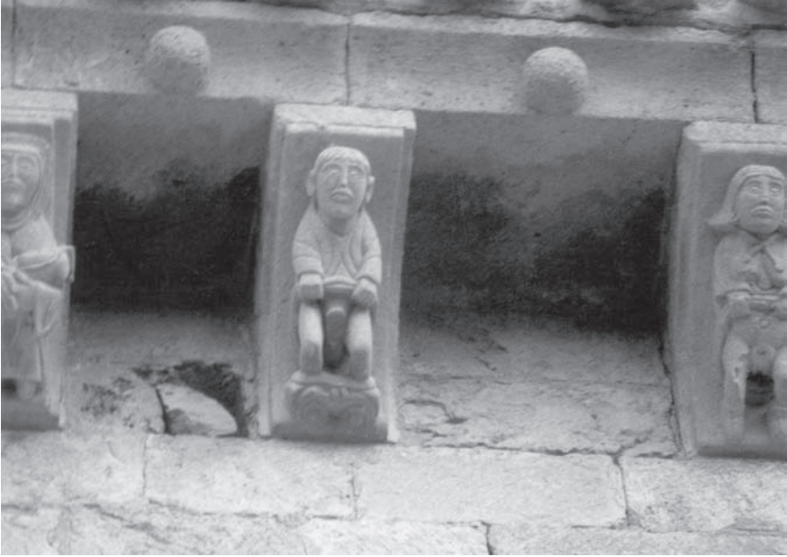
Figure 19. Tejada (Burgos, Castilla-León), male and female apse exhibitionism, twelfth century.