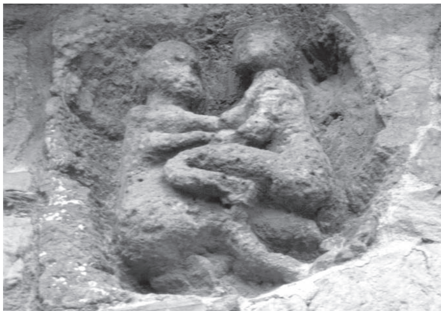
Figure 27. San Pedro de Abrisketa, Arrigorriaga (Vizcaya, País Vasco), south of Bilbao, naked couple in the act of coitus on the exterior wall of an eleventh-century hermitage.