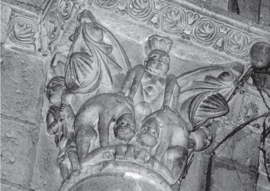
Figure 30. San Isidro, León (Castilla-León), aisle face of twelfth-century nave capital showing nude acrobats, one of which, an exhibitionist woman with a rope around her neck, stands on the chests of two men.