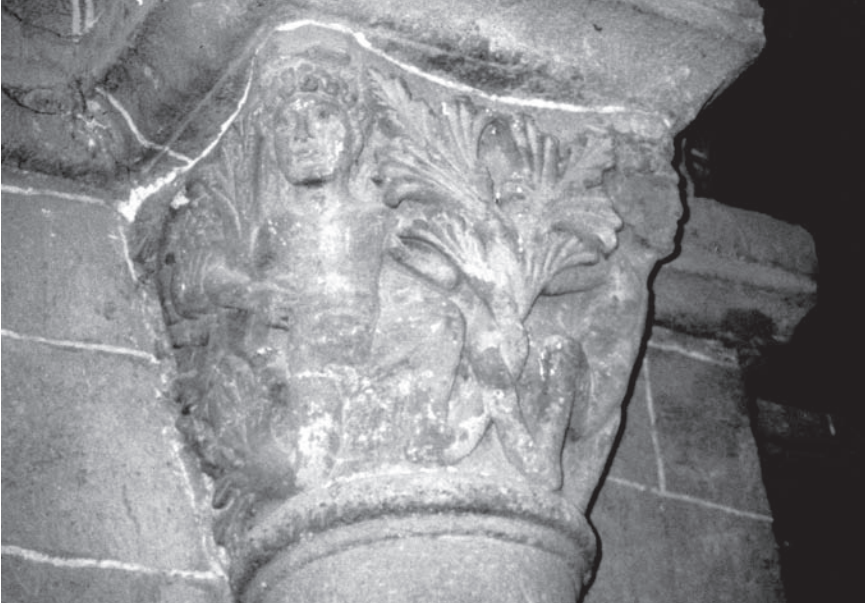
Figure 16. Saint Marcellinus, Chanteuges, near Clermont-Ferrand (Auvergne), portrayal of nude men among foliage.