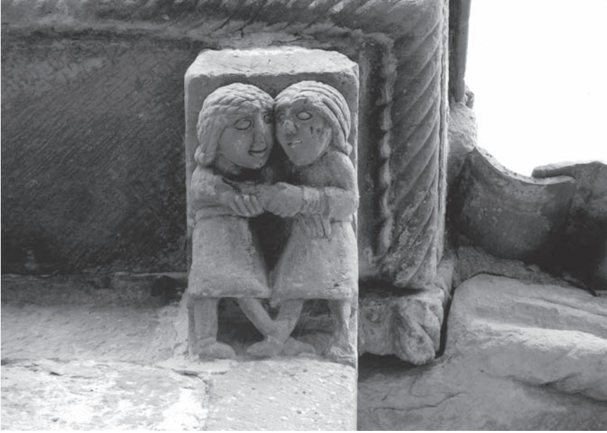
Figure 48. San Martín de Elines (Cantabria), twelfth-century canecillo of disputed interpretation (Cain and Abel; youths embracing; or youths fighting, symbolizing anger).