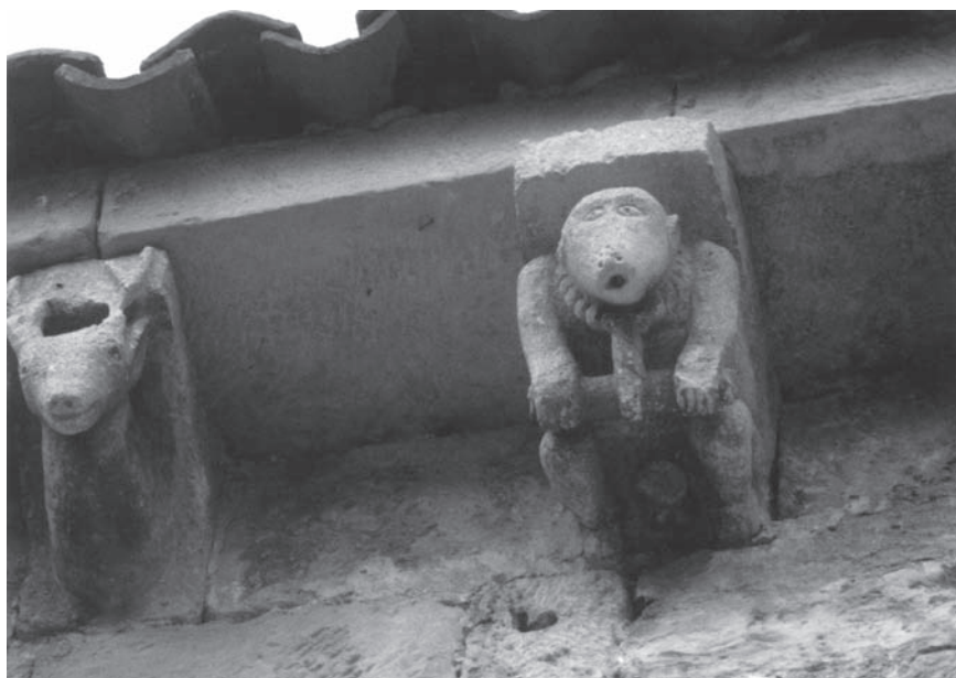
Figure 44. St Martín de Elines (Cantabria), twelfth-century canecillo of monkey engaged in asphyxiophilia.