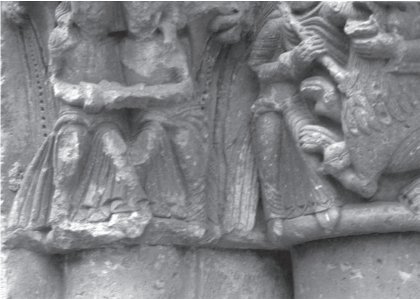
Figure 49. St. Pierre, Matha-Marestay, entwined men on a twelfth-century window capital.