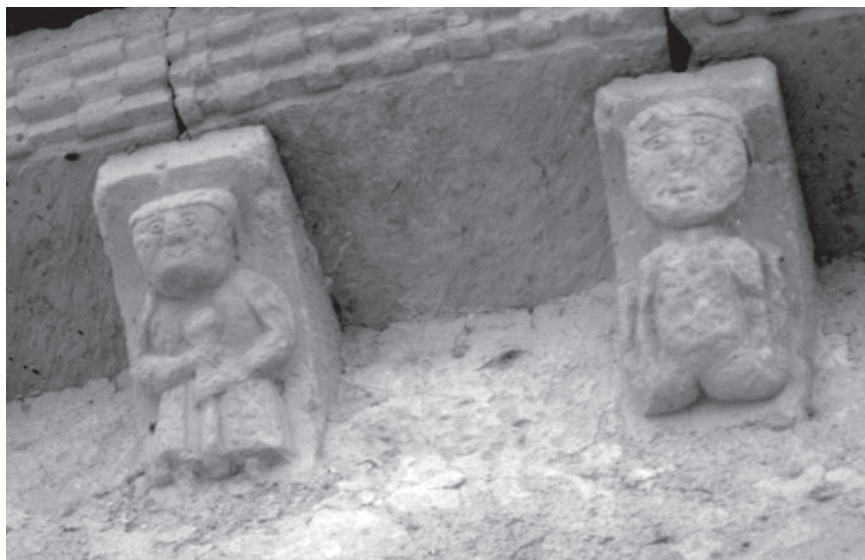
Figure 38. Santa Marta del Cerro (Segovia), parallel twelfth-century canecillos, one a male with a very long, erect phallus, presumably the result of the other, a female exhibitionist.