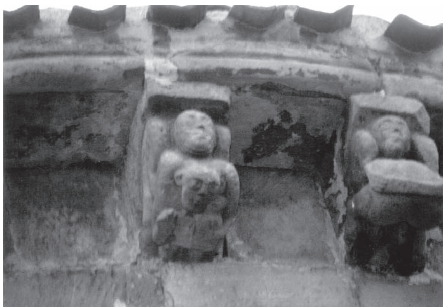
Figure 3. San Juan Bautista, Villanueva de la Nie (Cantabria), probable portrayal on cancello of male-male anal intercourse, twelfth or early thirteenth century.