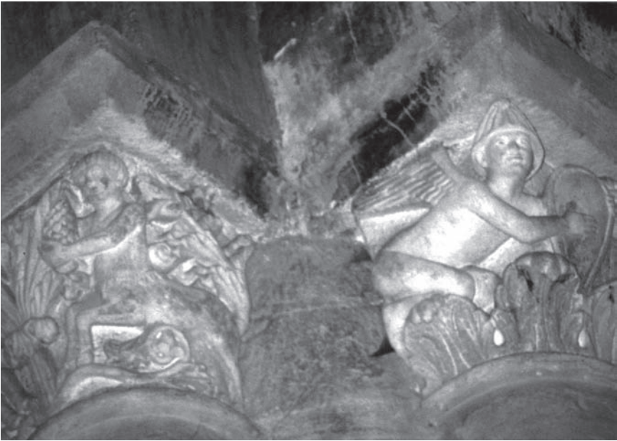
Figure 13. Mozat (Mozac), near Clermont-Ferrand (Auvergne), on left, nave capital with centaurs, on right, nave capital with nude adolescent Victories, about 1080.