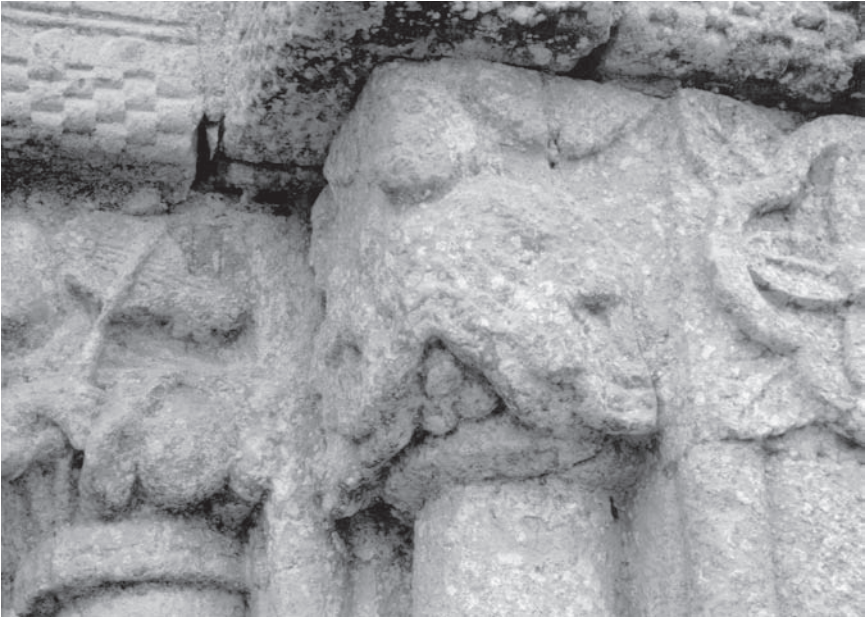
Figure 36. Sta. Maria de los Angeles, San Vicente de la Bárquera (Cantabria), thirteenth-century monastic or clerical exhibitionist.