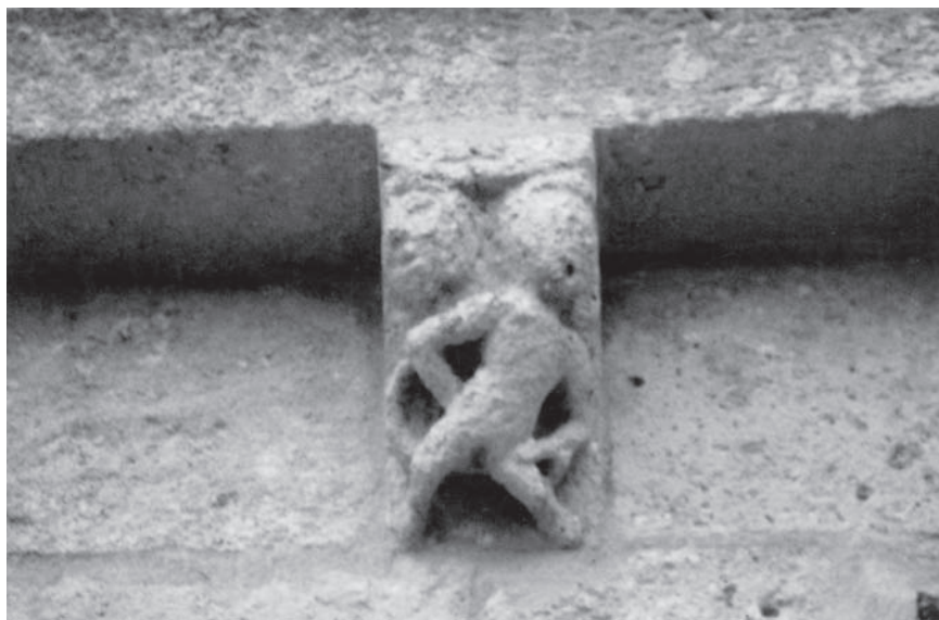
Figure 1. Tayac (Aquitaine), erotic interlace, likely anal intercourse, involving two naked men on an apse modillion, late eleventh or twelfth century.