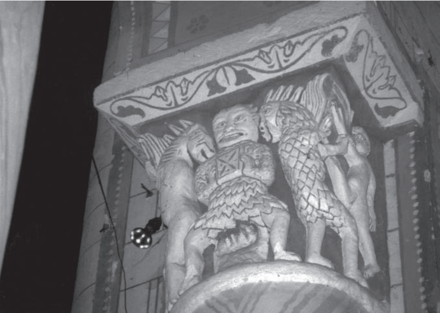
Figure 17. Saint-Pierre, Chauvigny (Vienne), Satan and his devils on a repainted figured capital of about 1080–1120.