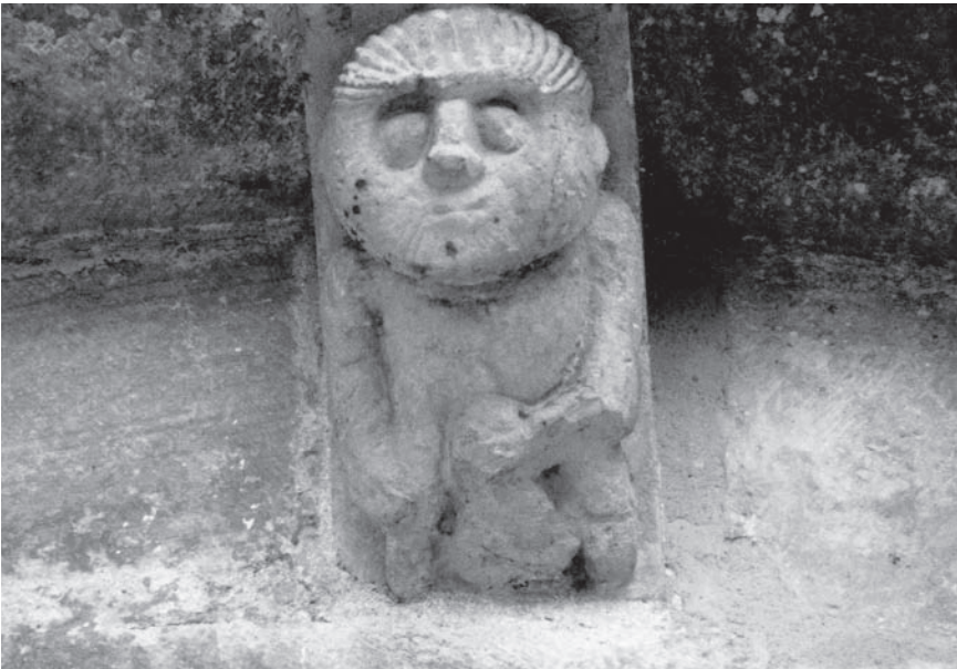
Figure 20. San Pedro de Villanueva near Cangas de Onis (Asturias), twelfth-century masturbating monkey.