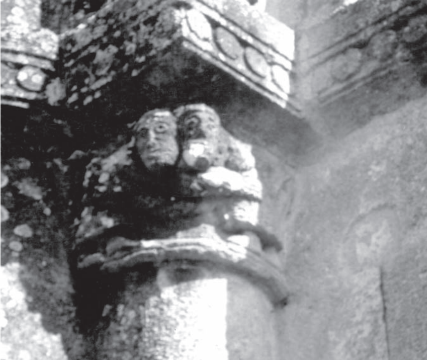
Figure 51. Moarves de Ojeda (Palencia, Castilla-León), late twelfth- or early thirteenth-century sculpture of two seated young men holding hands and shoulders touching on a capital of the left side of the porch.