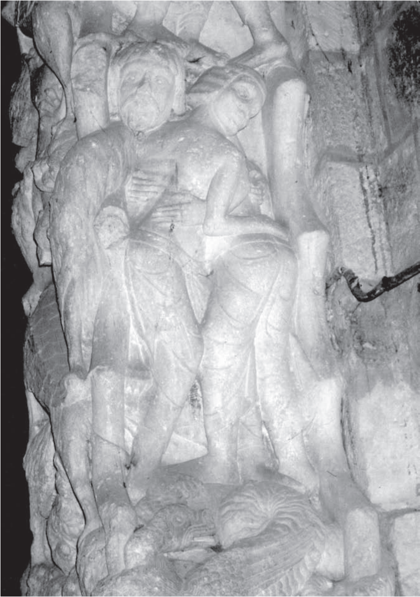
Figure 50. Ste Marie, Souillac (Lot, Midi-Pyrénées), bottom couple of right face of trumeau from about 1135, on which three couples wrestle, each a youth and a grown man.