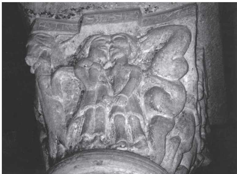
Figure 46. St-Genès, Châteaumeillant (Cher, Centre), twelfth-century capital of male-male love with two peasants embracing and kissing, one peasant apparently holding his erect penis with his left hand as it emerges from the folds of his clothing, with inscription “hac rusticani mixti.”