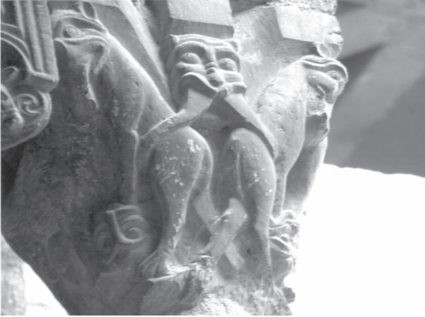
Figure 35. Sta. Maria de L'Estany (Catalonia), "tails" of two lions in a monster's mouth, about 1124–33.