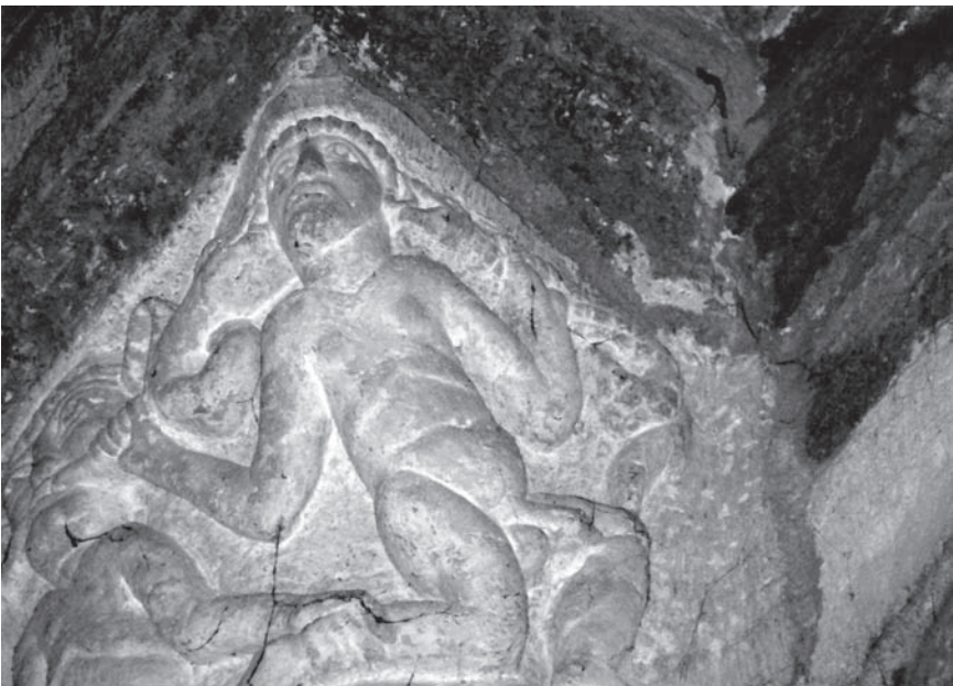
Figure 15. Saint-Julien, Brioude (Auvergne), capital with fully exposed genitals.