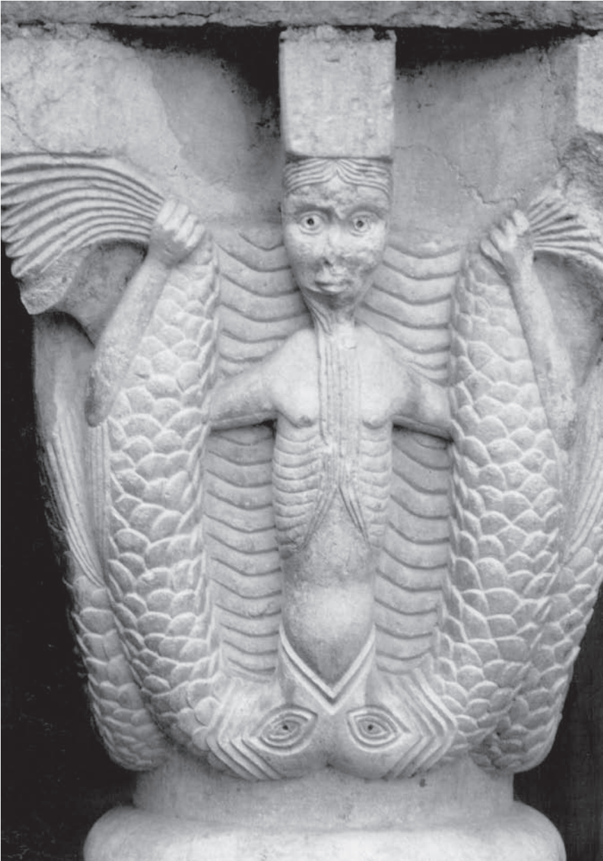
Figure 32. Sant Pere de Galligans, Girona (Catalonia), nereid or siren exposing herself revealing an eye/vagina on the inside of each thigh, on twelfth-century capital from the cloister.