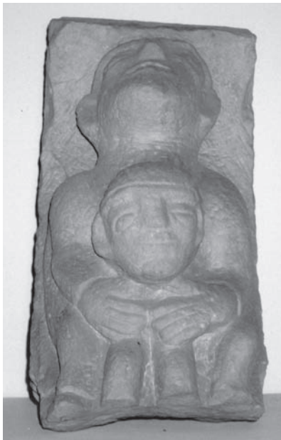
Figure 8. Colegiata at Santillana del Mar (Cantabria), presentation of pederasty on cancello now in the cloister, late twelfth century – front view.