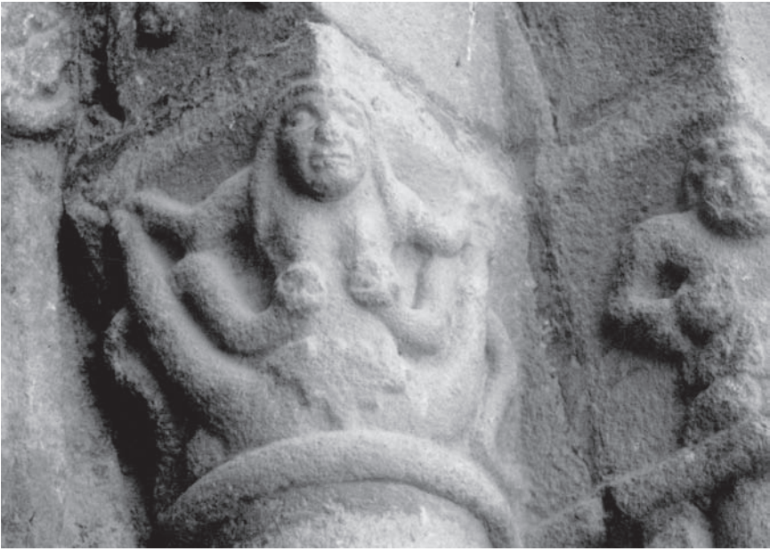
Figure 22. Seo de Urgell (La Seu d'Urgell) (Lleida, Catalonia), nereid on an exterior twelfth-century capital beside north porch with serpents gnawing at her breasts.