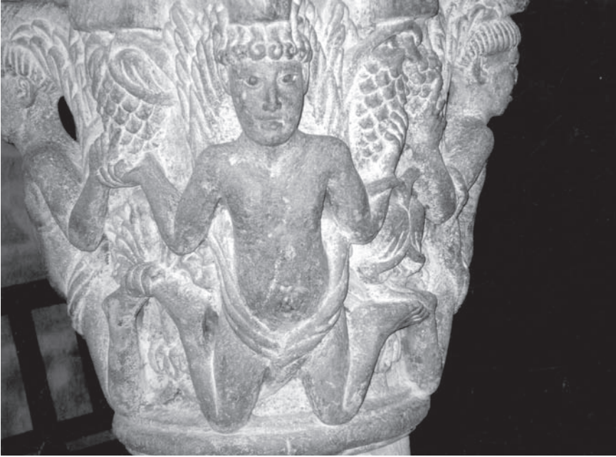
Figure 14. Mozat (Mozac), near Clermont-Ferrand (Auvergne), displaced capital on display at back of church with Telamons on each of its four corners, about 1080.