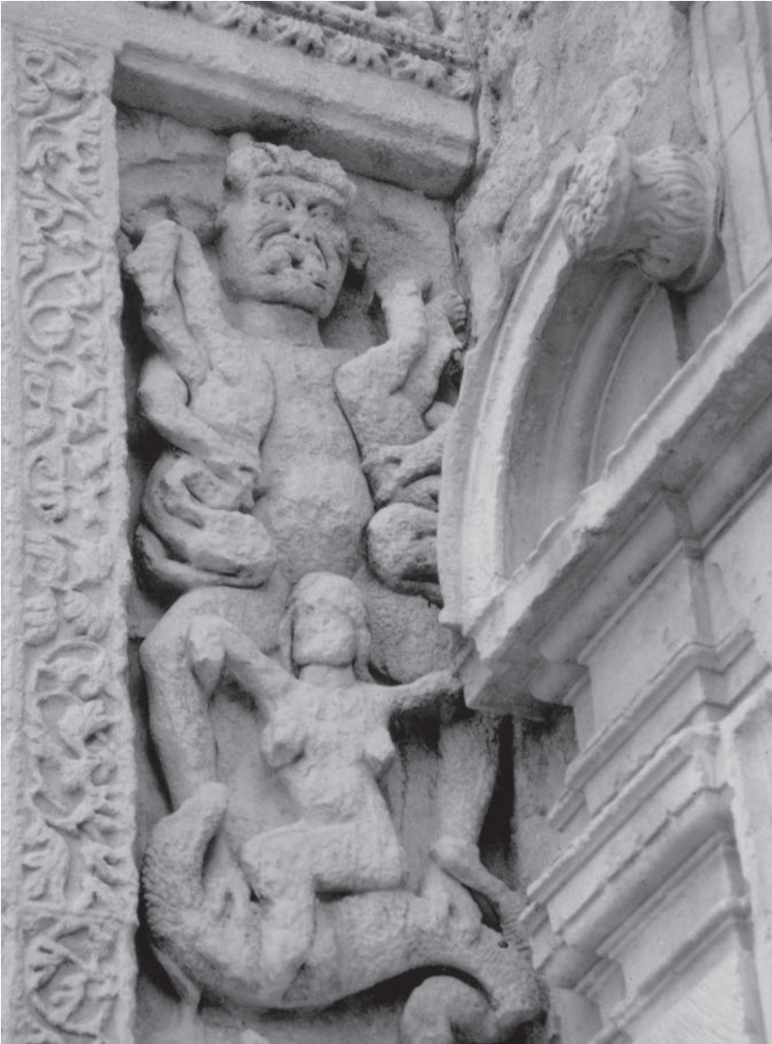
Figure 18. Saint-Trophime, Arles (Provence-Alpes-Côte d'Azur), right side of the main portal, Satan sitting naked, one of the damned upside-down under each arm, and a luxuria figure, perched on or riding a dragon, sitting with the back of her head against Satan's crotch, about 1190.