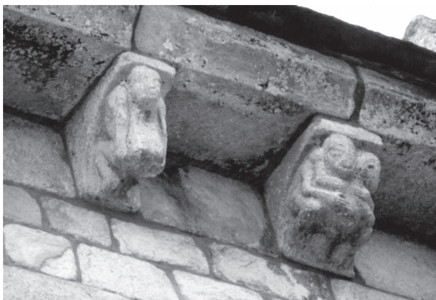
Figure 6. San Martin de Mondoñedo, outside Foz (Lugo, Galicia), man baring his anus on a canecillo next to a couple in coitus, twelfth century.