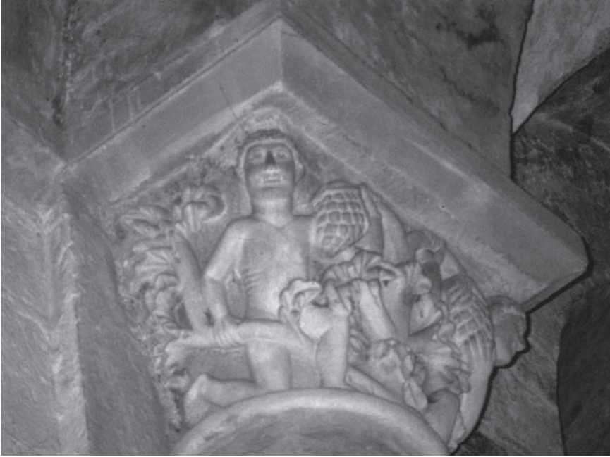
Figure 10. Mozat (Mozac), near Clermont-Ferrand (Auvergne), one of two nude boys or young men, with knee on ground, on nave capital of about 1080.