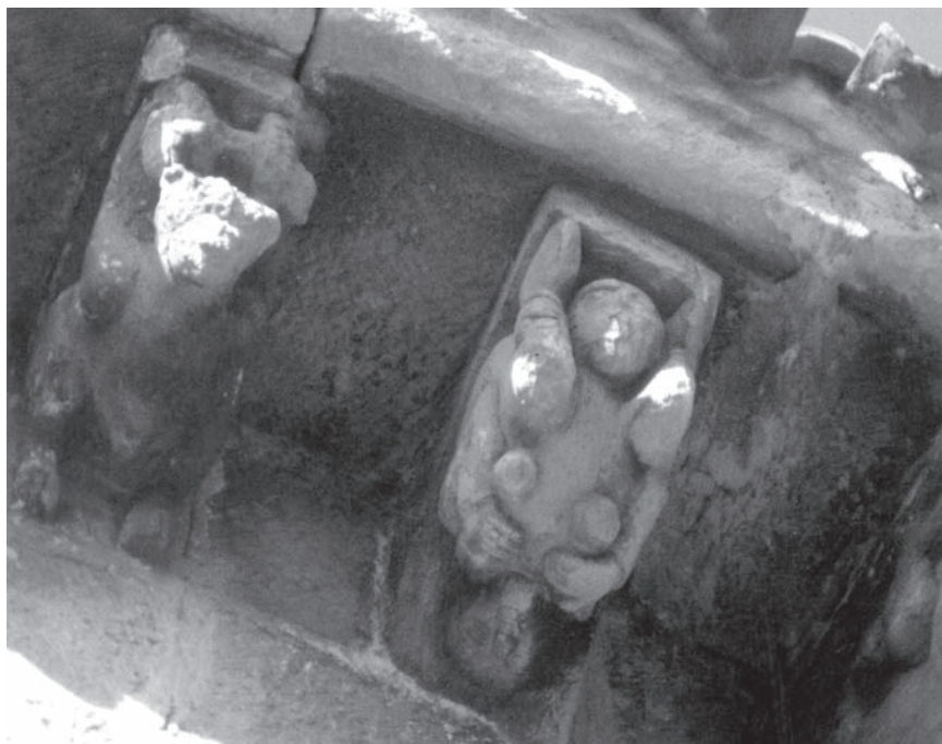
Figure 2. San Pedro de Cervatos (Cantabria), erotically interlaced nude man and woman peering down from apse canecillo, twelfth century.