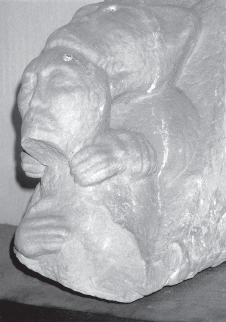
Figure 37. Colegiata at Santillana del Mar (Cantabria), late twelfth century.