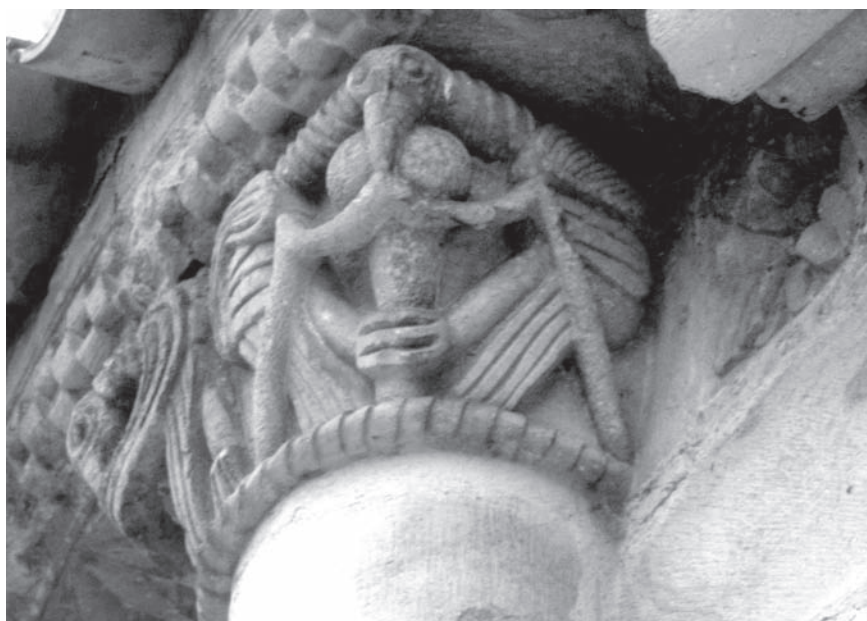
Figure 24. San Pedro de Villanueva near Cangas de Onis (Asturias), one of restored twelfth-century apse canecillos with ithyphallic masturbating bird figures.