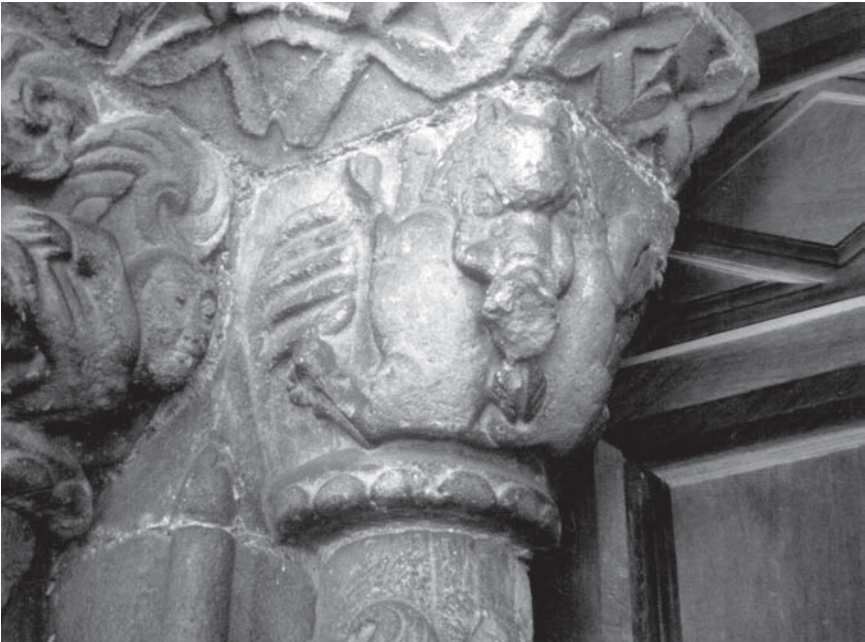
Figure 34. Santa María de la Oliva, Villaviciosa (Asturias), porch showing the punishment of an upside-down "luxurious" man, whose genitals are being devoured by a wild boar.