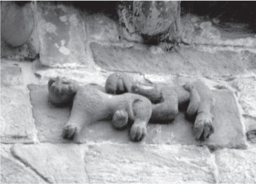
Figure 43. San Cipriano, Bolmir (Cantabria), twelfth-century bas relief, probably of animals playing.