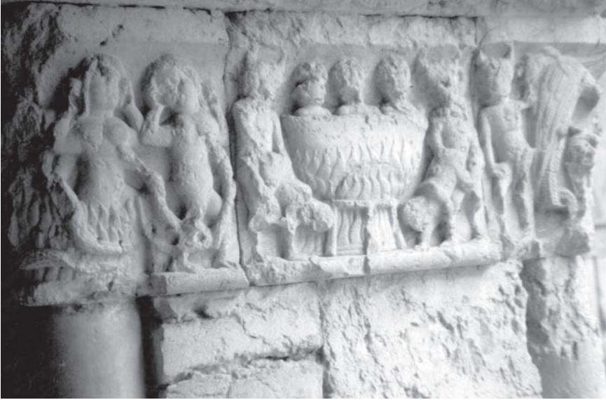
Figure 33. Girona (Catalonia), twelfth-century panel in the cathedral cloister apparently built around the theme of lust, depicting three men in a cauldron signifying hell, a devil on either side of the cauldron sodomizing a man, and two flanking luxury figures.