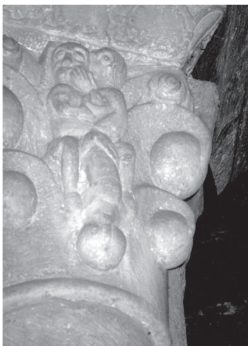
Figure 39. Colegiata at Santillana del Mar (Cantabria), woman presumably masturbating man, late twelfth century.