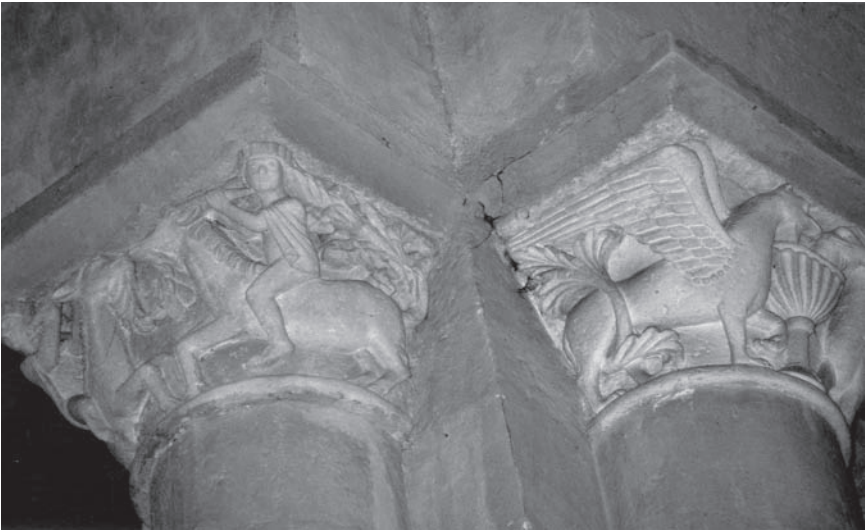
Figure 11. Mozat (Mozac), near Clermont-Ferrand (Auvergne), nave capital (on left) showing two nude but caped youths riding two goats, of about 1080 (griffin on right capital).