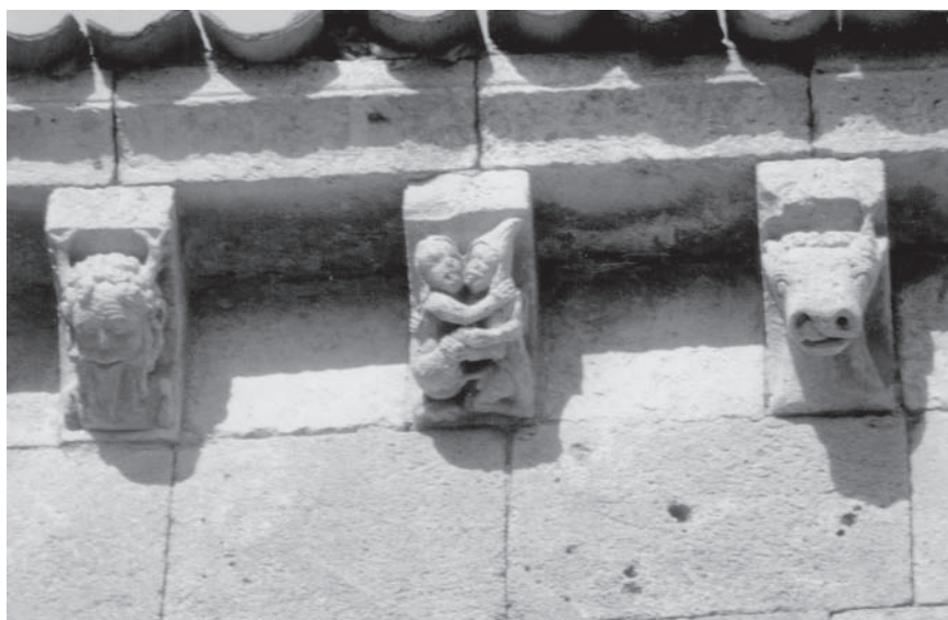
Figure 28. San Miguel, Fuentidueña (Segovia), seated coital couple on twelfth-century nave canecillo who seem to be enjoying themselves at our expense, both sticking out their tongues at us.