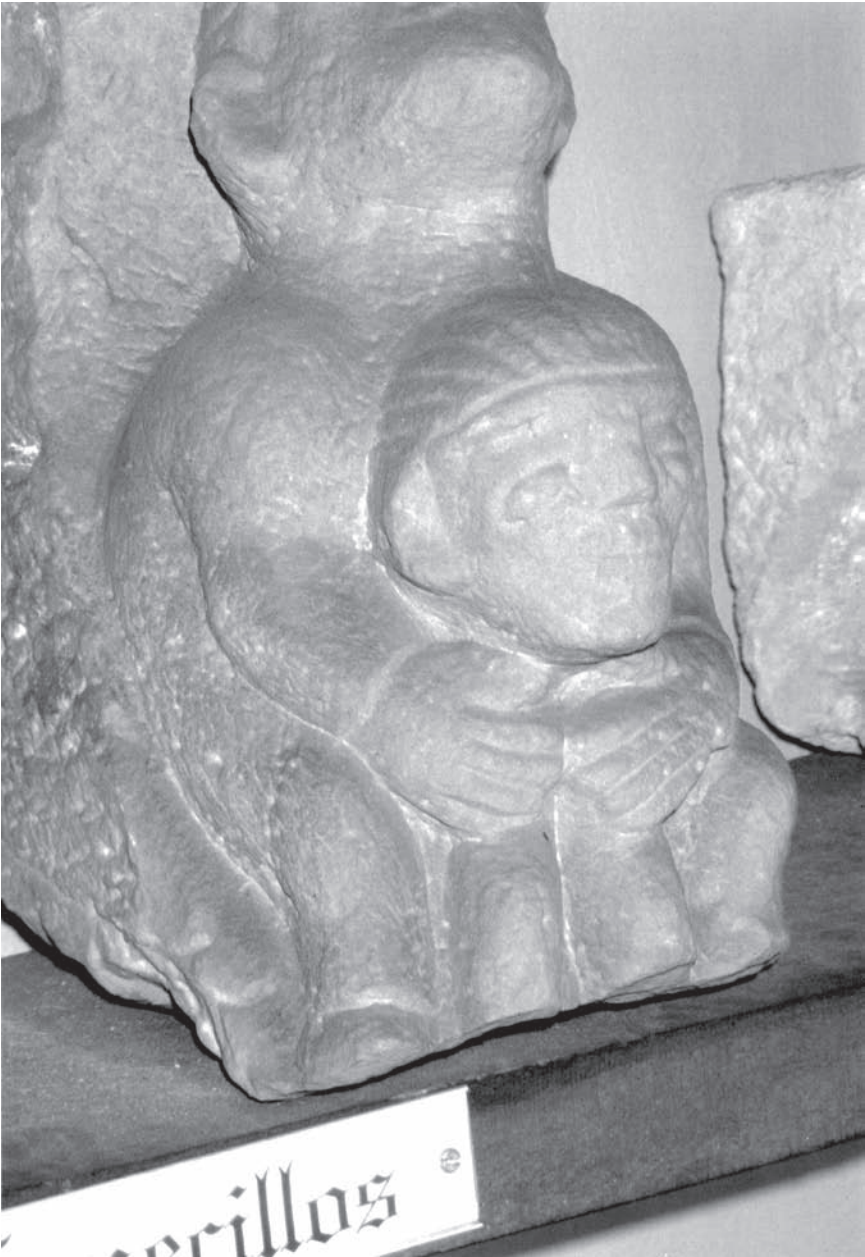
Figure 9. Colegiata at Santillana del Mar (Cantabria), presentation of pederasty on can- ecillo now in the cloister, late twelfth century – angle view.