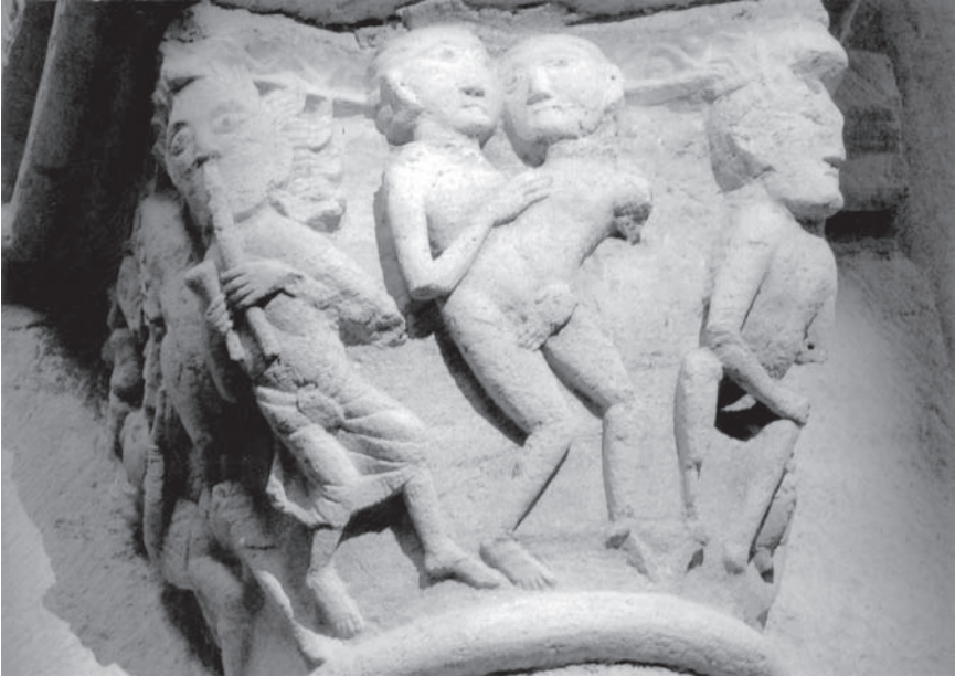
Figure 41. Anzy-le-Duc (Burgundy), man doubled from the waist up with two trunks and heads, twelfth century (there seems to be some patching in the genital area, but this does not seem to be a portrayal of an erection).