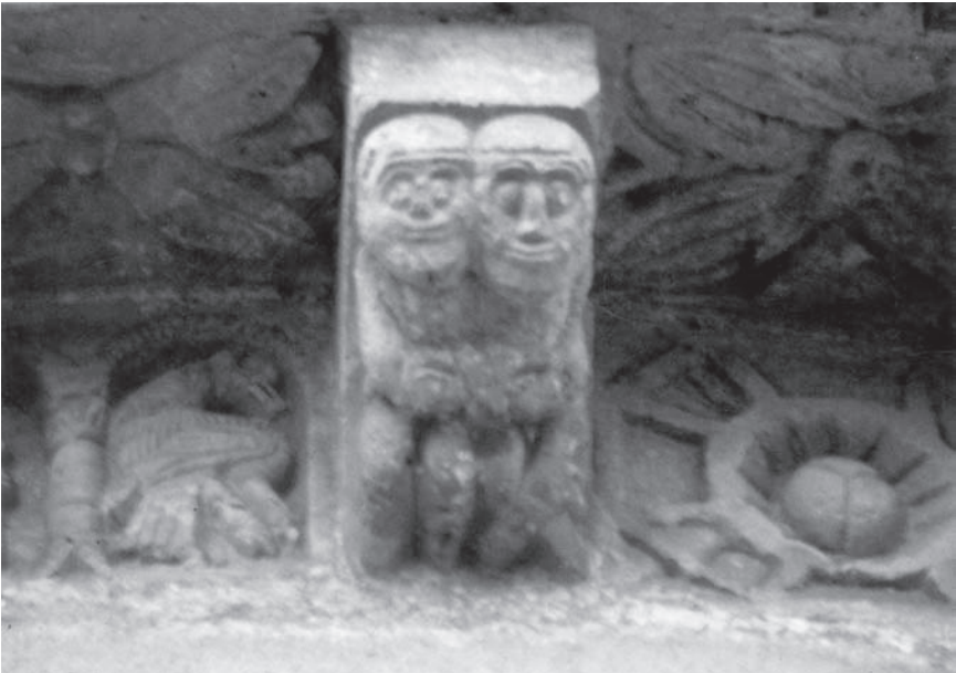
Figure 26. San Pedro de Villanueva near Cangas de Onis (Asturias), restored twelfth-century apse canecillo with possible portrayal of male same-sex love.