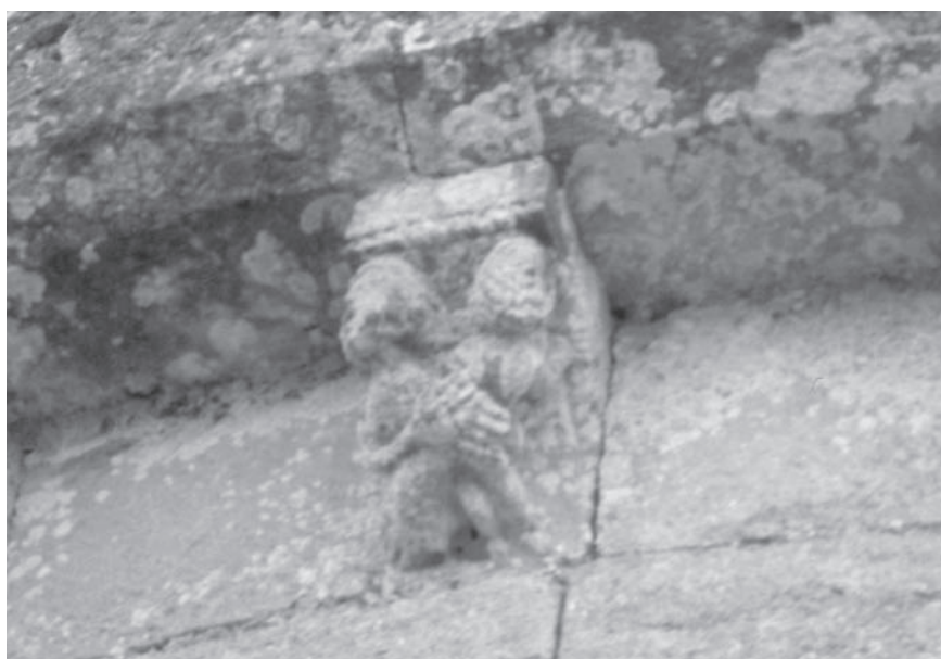
Figure 4. Monprimblanc (Gironde, Aquitaine), modillion with one bearded man apparently attempting anal intercourse on another a little before 1100.