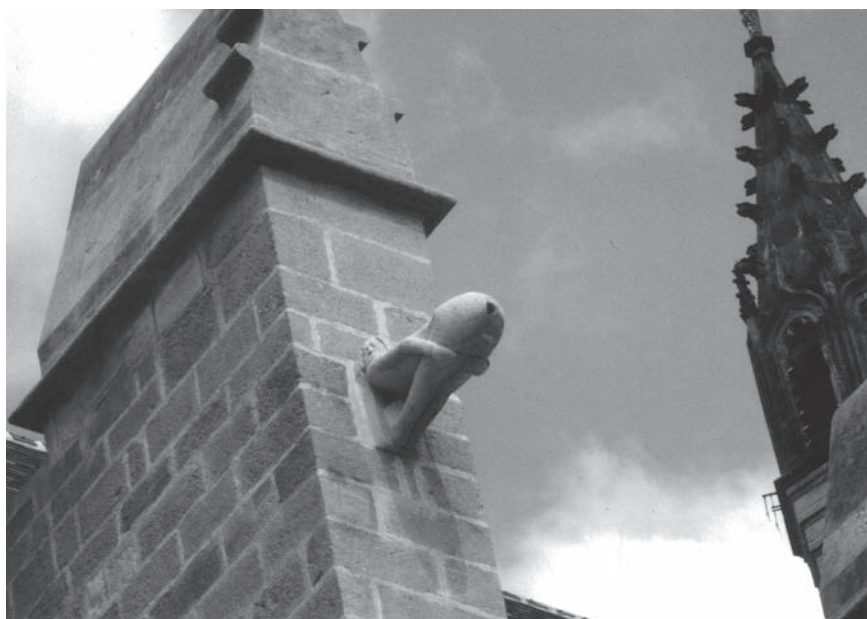
Figure 47. St Lazare, Autun (Saône-et-Loire, Burgundy), thirteenth-century “mooning” figure.