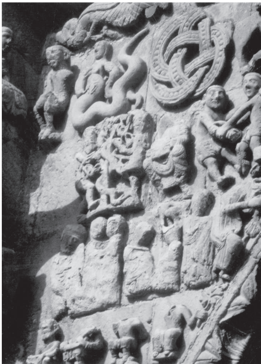
Figure 31. Santa Maria la Real, Sangüesa (Navarra), woman on upper-left of the porch being attacked by a huge serpent with a semi-human face, about 1170.