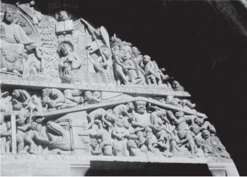
Figure 21. Conques (Languedoc-Roussillon), tympanum of the West portal, about 1135.