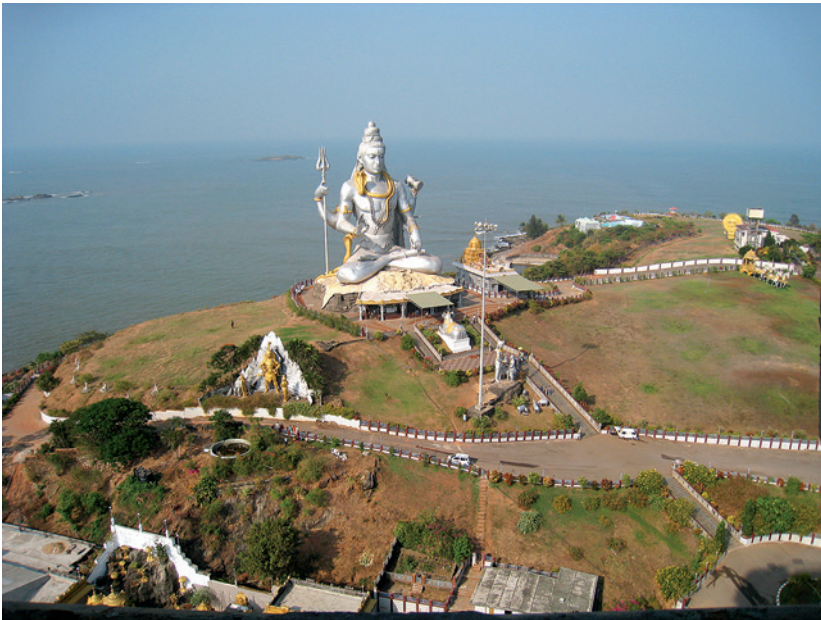
PLATE 2 Kashinath, 123-ft. seated Shiva, Murudeshwar, Karnataka, completed in 2002. View from Shri Murudeshwara temple gopuram, March 2012.