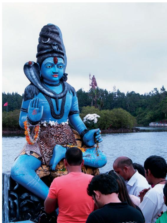
PLATE 14 ( right ) Shiva statue outside Mauritiusheshwarnath Shiv Jyotir Lingum temple (Shiv Parivar Mandir) with monumental Shiva in the background. Ganga Talao, Mauritius, January 2014.