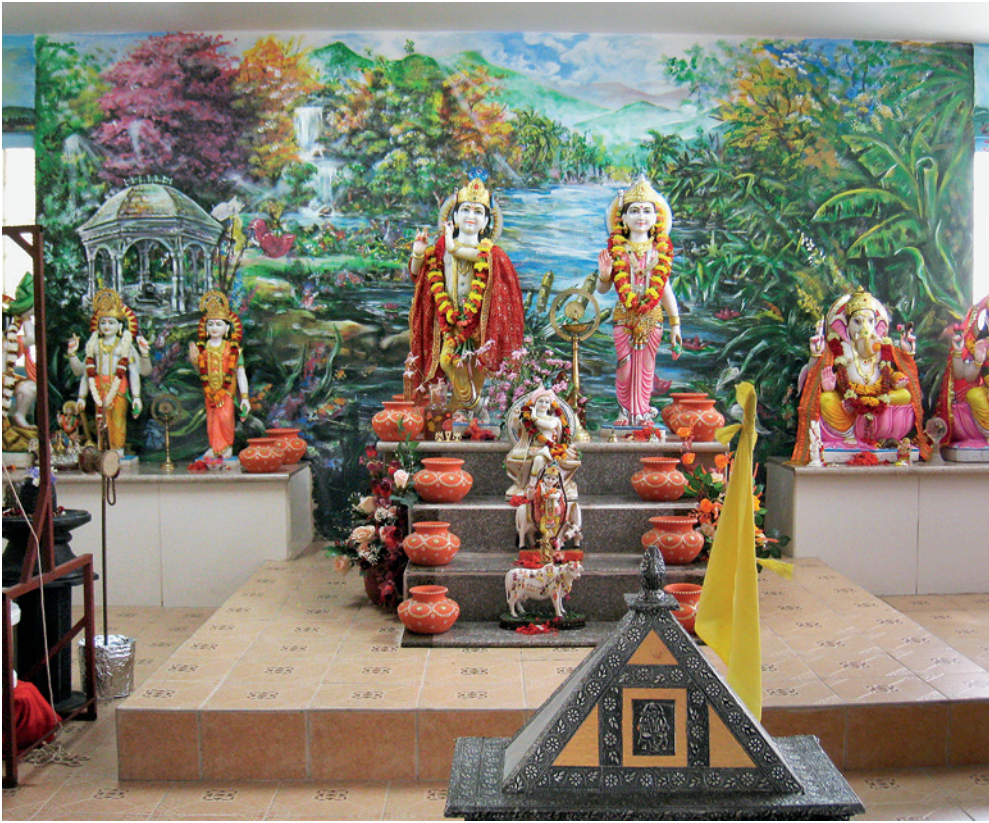
PLATE 11 ( above ) Mural in Gita Ashram prayer hall, Carapichaima, Trinidad, December 2009.