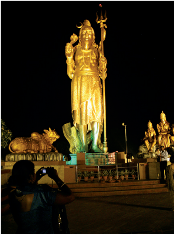
PLATE 7 ( above ) Kanwariya pilgrims returning from Hari- dwar arriving at Birla Kanan for a rest stop and to pay obeisance to Mangal Mahadev, July 2009.