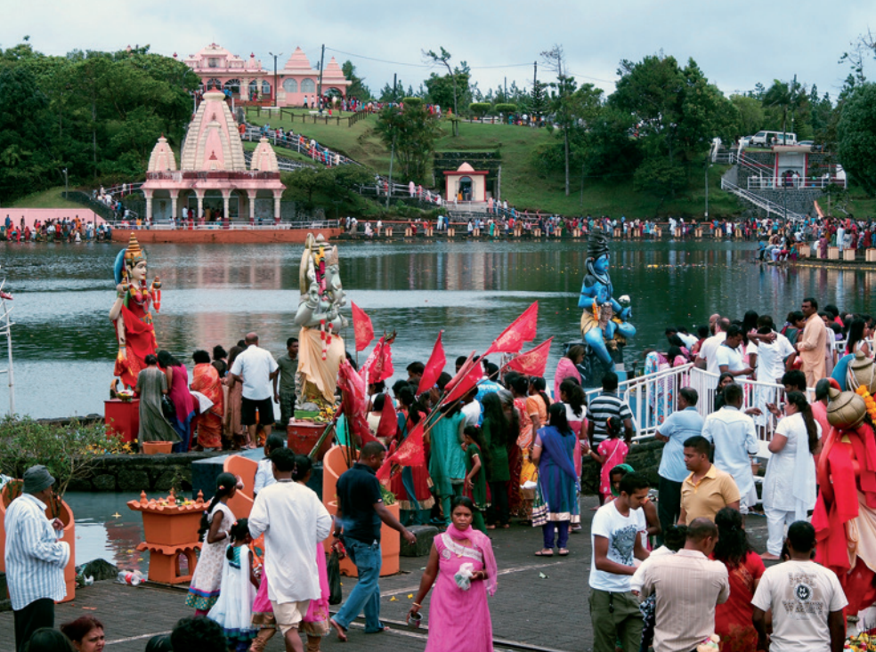
PLATE 13 ( above ) View of temple complex at Ganga Talao, Mauritius, New Year's Day, 2014. On the far side of the lake is the Hindu Maha Sabha's Kashi Vishwanath Mandir.