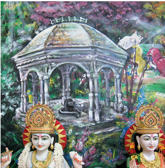
PLATE 12 ( left ) Gita Ashram mural, detail showing Shiva lingam in gazebo with jhandis (flags) next to it. Trinidad, December 2009.