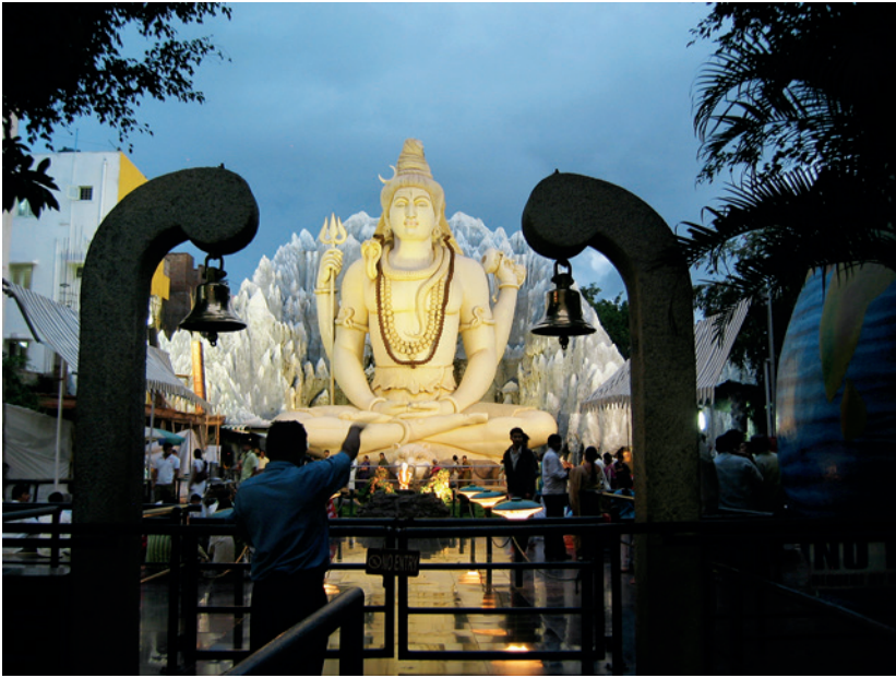
PLATE 1 Kashinath, 65-ft. seated Shiva at Kids Kemp department store, also known as Kemp Fort, Old Airport Road, Bangalore, inaugurated in 1995. Photographed in 2007.