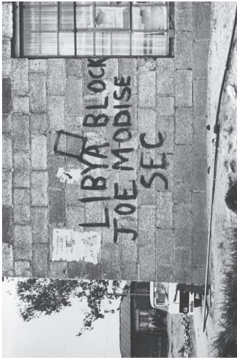
Plate 5: House in 11th Avenue, Alexandra Township, 1986. 'Libya Block' is an example of the re-naming of blocks after revolutionary icons; 'Joe Modise Section' is an example of the division of the township into sections, each controlled by a different Youth Group, and their naming after revolutionary icons – in this case Joe Modise, an ANC leader in exile. Streets were also renamed.