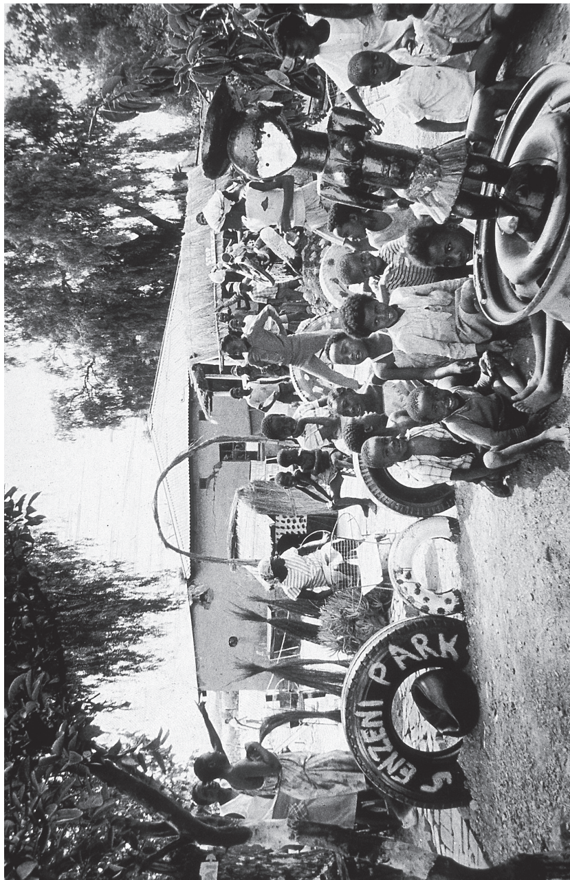
Plate 4: A 'People's Park', Alexandra, 1986.