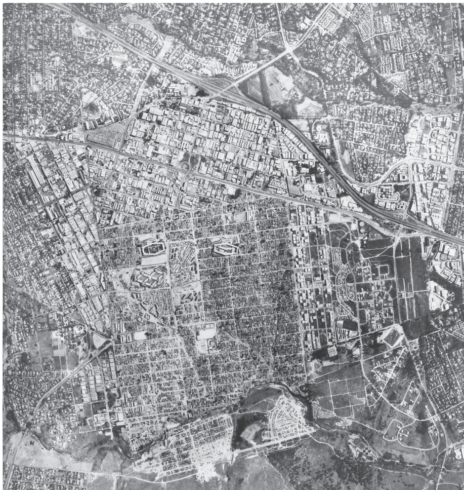
Plate 1: Aerial photograph of Alexandra Township and the surrounding areas, taken in 1987. Alexandra is the very dense, square area in the middle of the photograph. Within Alexandra the three large hostels appear as white hexagonal figures. Partly surrounding the dense township area is the slightly less dense 'buffer zone' of factories and businesses, while further out are the much more generously laid-out white suburbs.