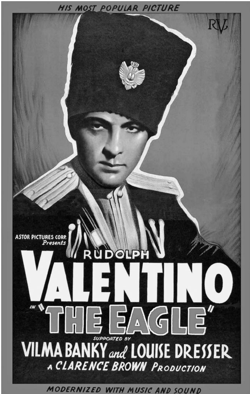
Figure C.2 Movie poster for The Eagle (1925), based on Aleksandr Pushkin's novel Dubrovskii .