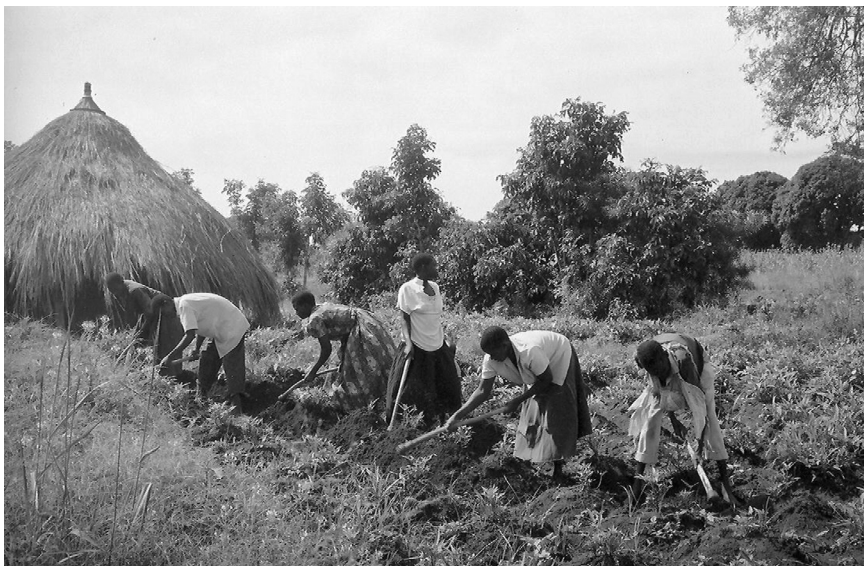
Plate 1 A farm labour group ( aleya ) at work