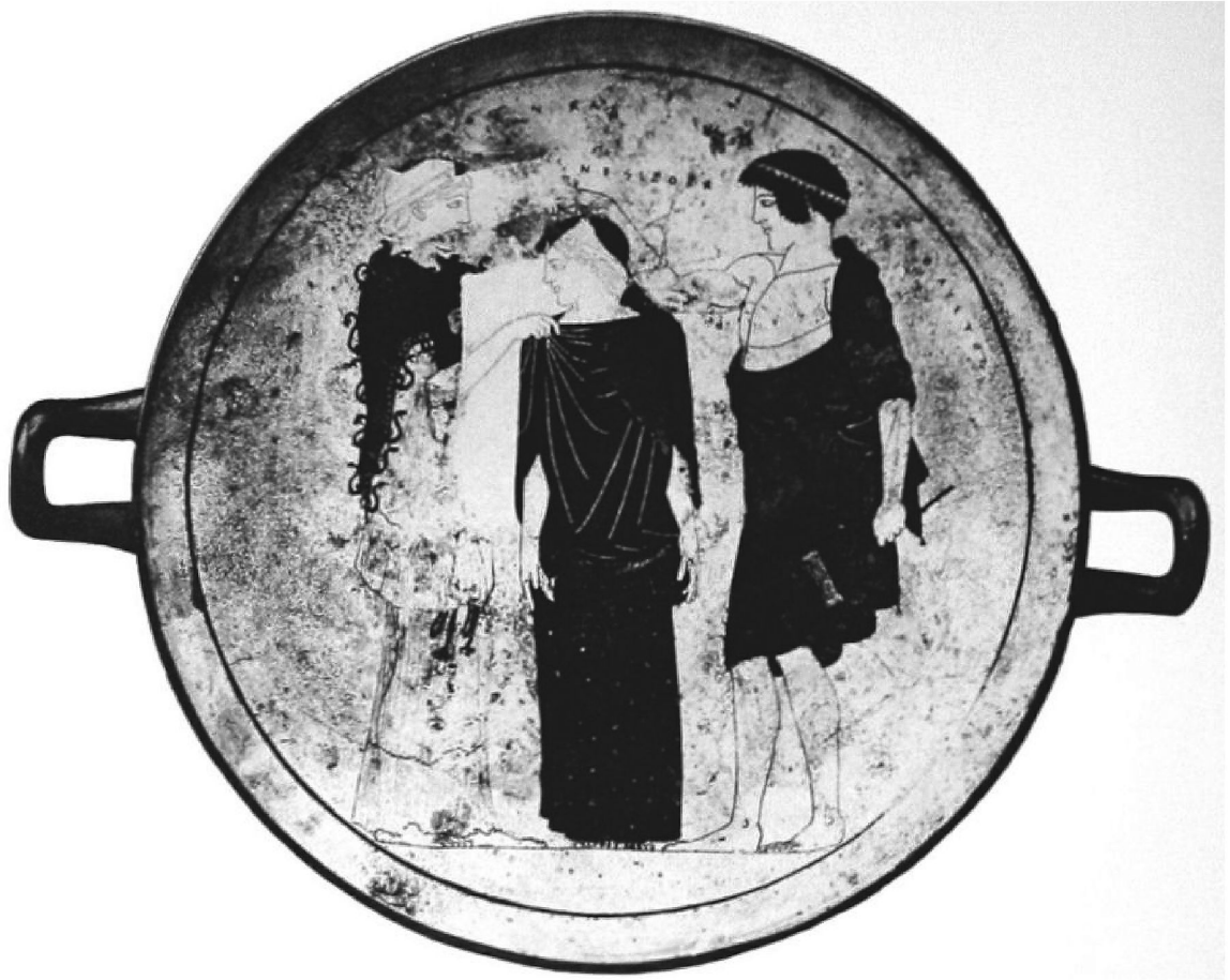
Pandora (Anesidora) between Pallas Athene and Hephaestus (The Blade Kylix)