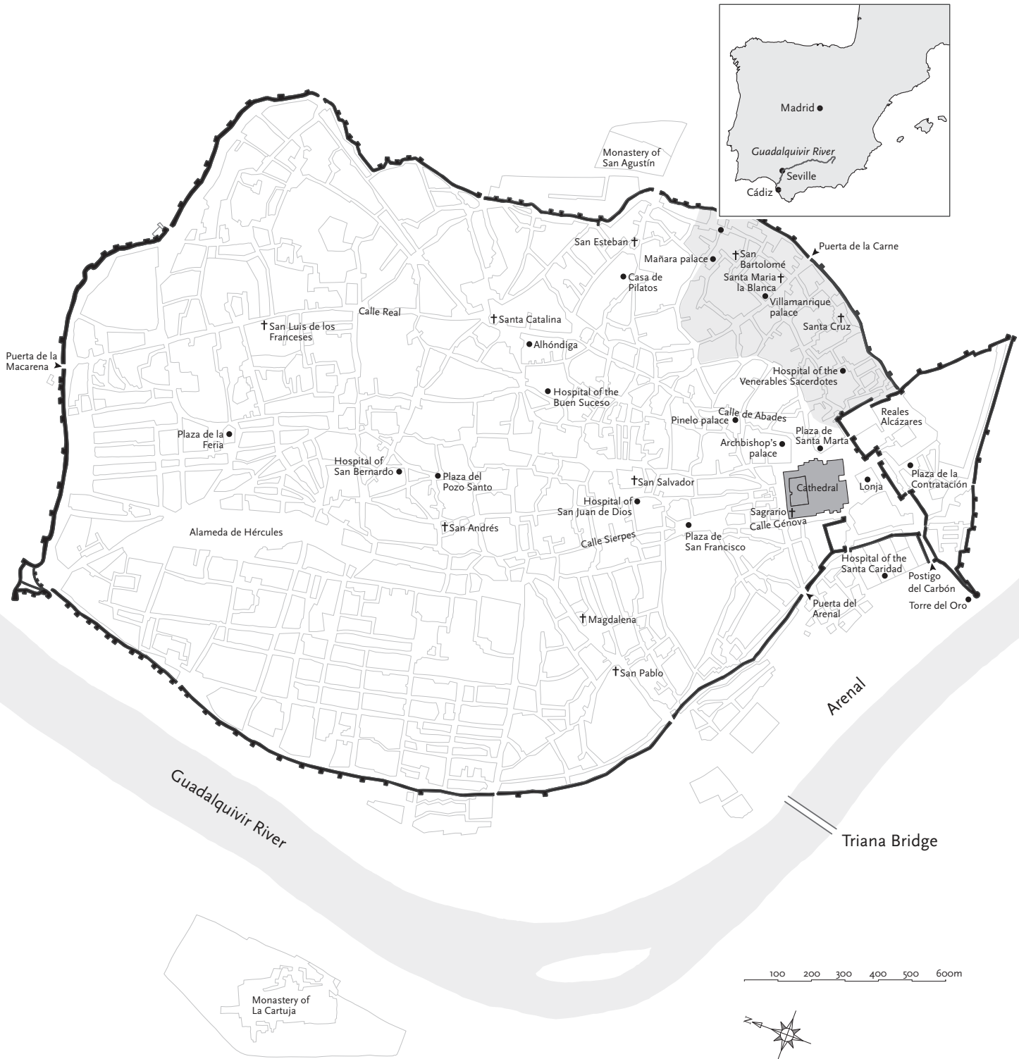
SEVILLE IN THE SEVENTEENTH CENTURY Shaded area indicates the former Jewish quarter. Drawing by Maura Whang.