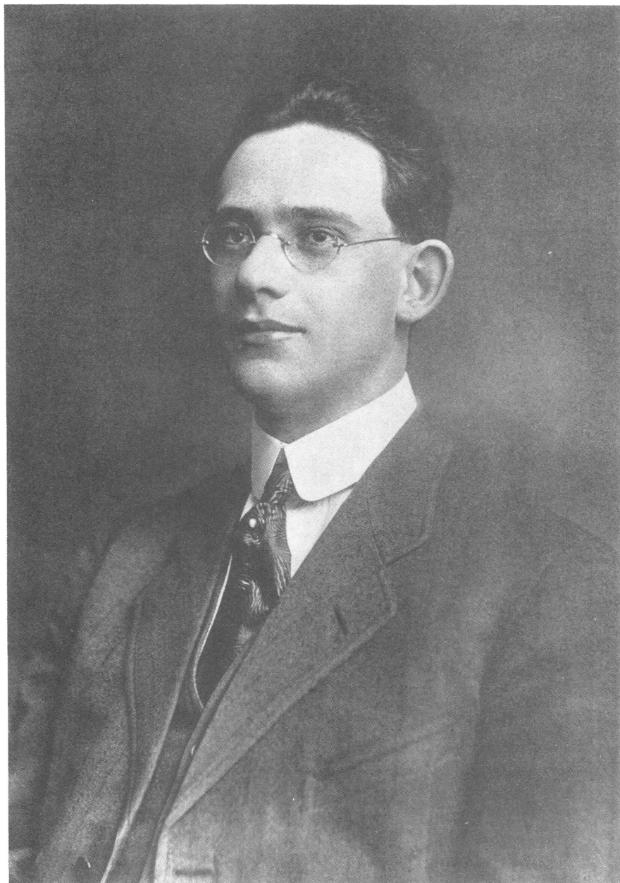
Edward Sapir 1913.