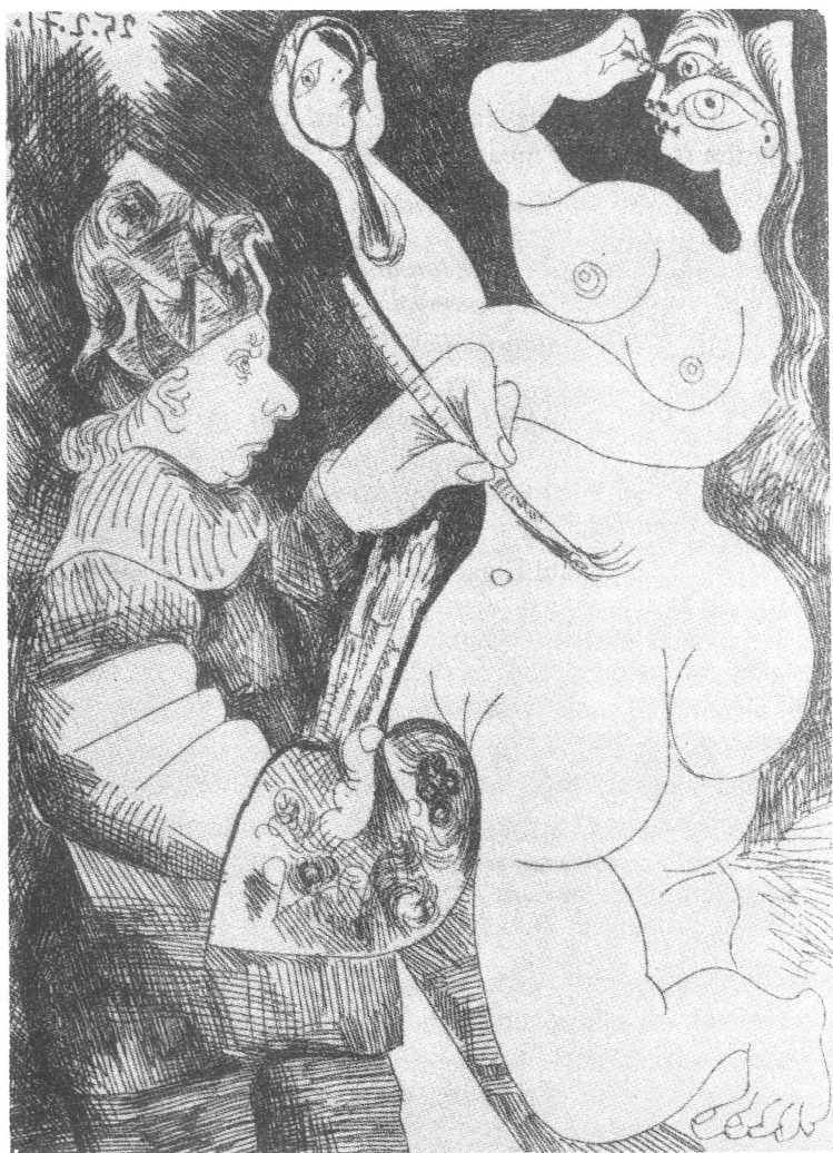
Picasso, Pablo. 25.2.1971. "Katalog No. 58". Aus den letzten graphischen Blättern. Aachen: Sammlung Ludwig. (Reproduced with permission.)